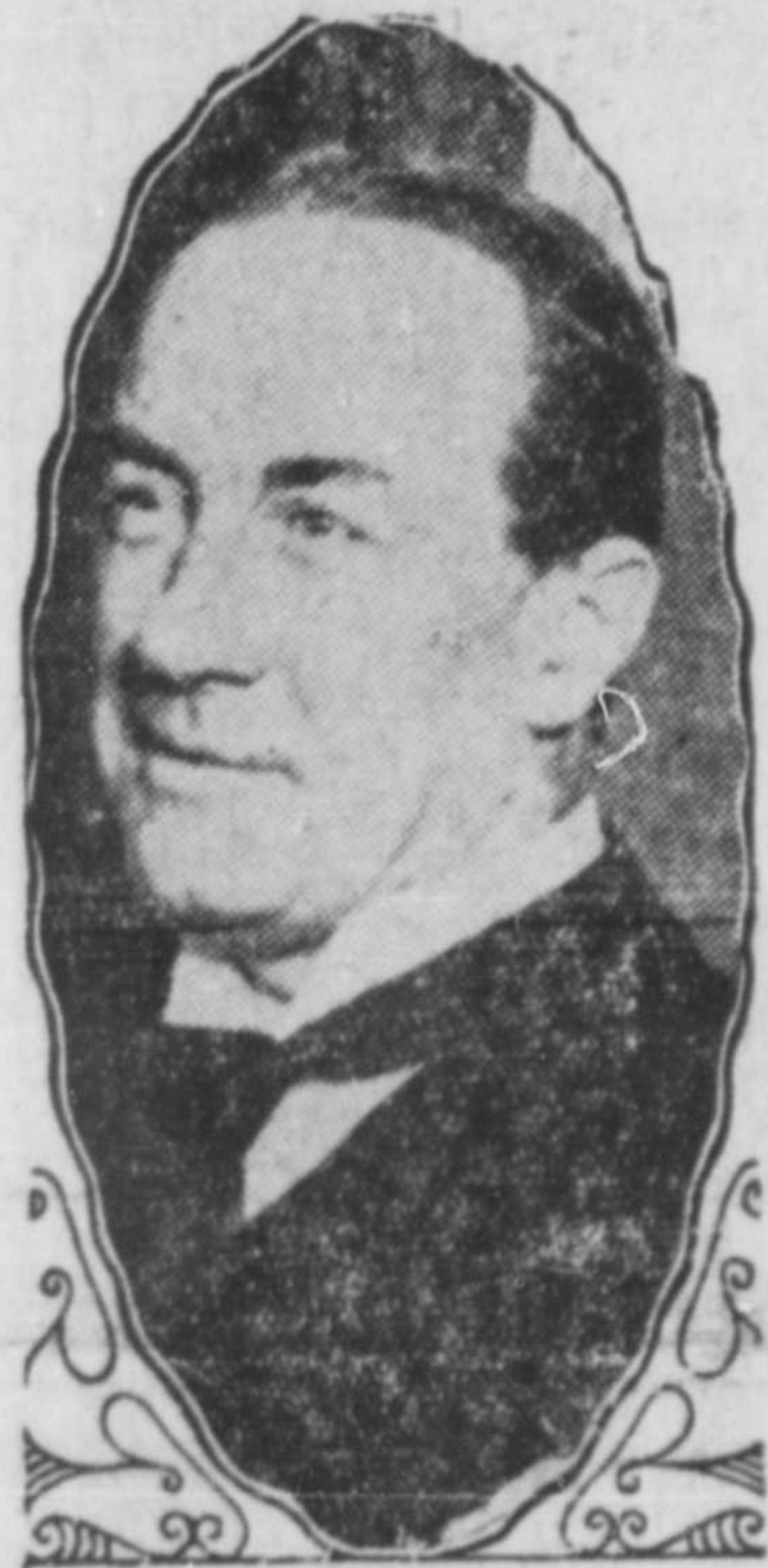
Rt. Hon. Stanley Baldwin who expects great things from the forthcoming Imperial economic conference.

Herriot Sees Pact as Resurrection of Entente Cordiale—Italy Announces It Will Also Adhere to New Consultative Agreement