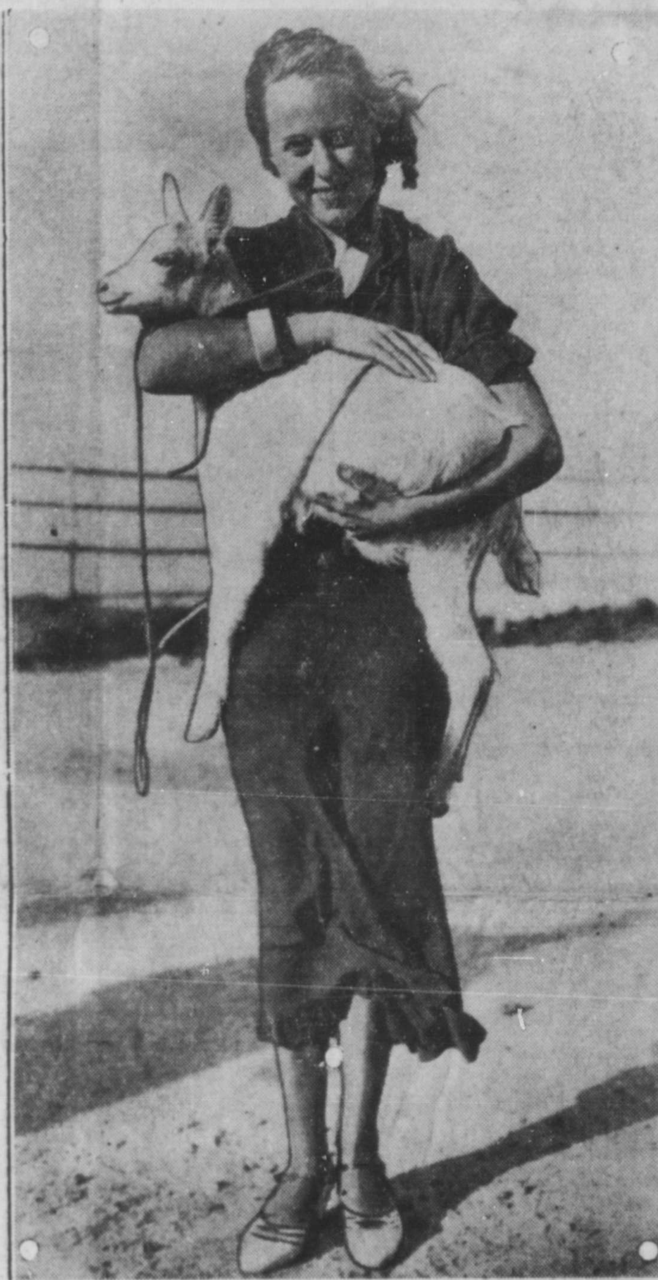
Nearly got her goat. This "maiden, pure and fair" and her goat were exhibits A and B in a black magic demonstration that went blooey atop the Bracken mountain near Berlin. Witches tried to turn the goat into a man.