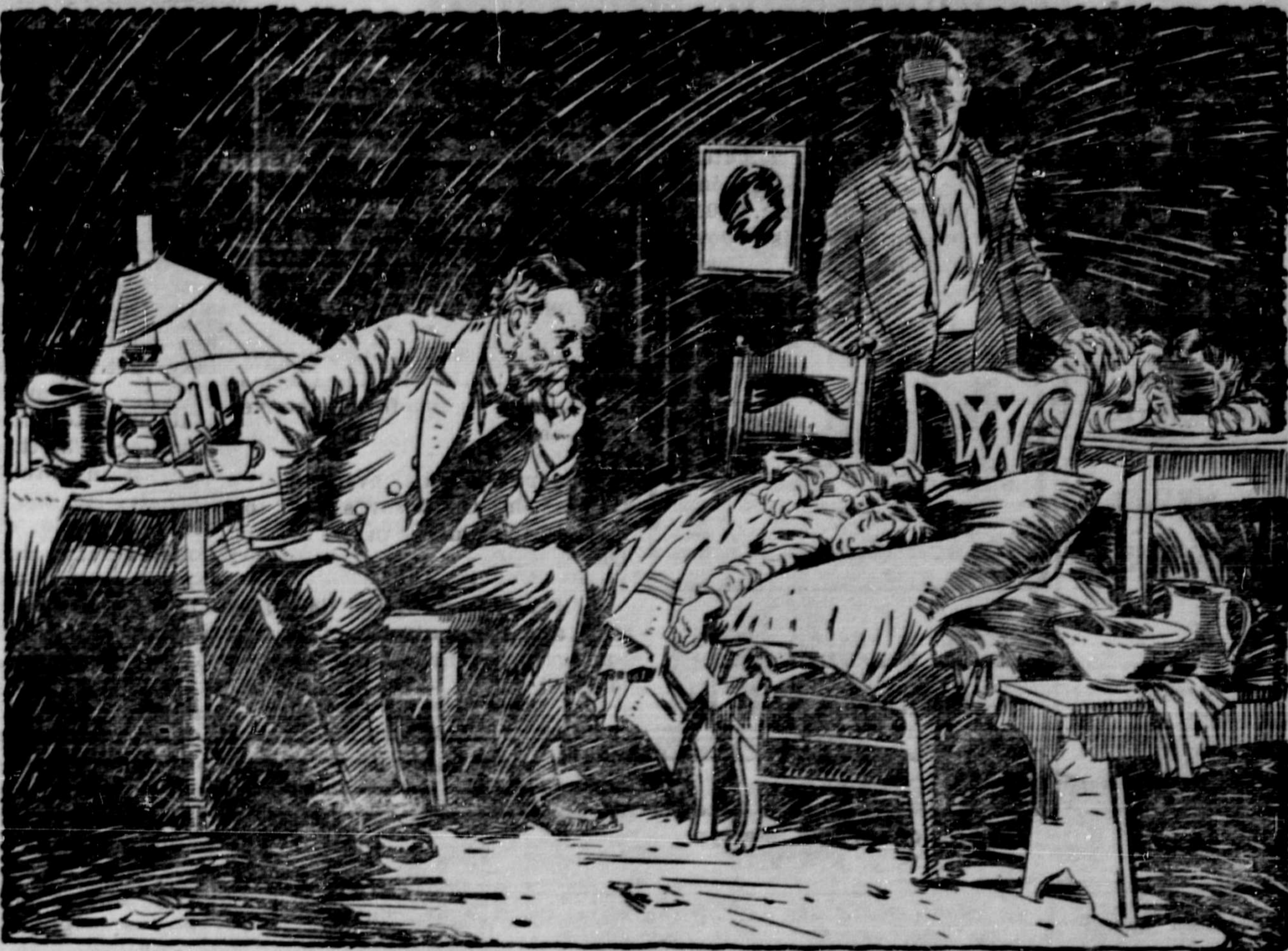
Acknowledgments to Luke Fildes

We have a balance of trade on the right side. From being debtors of others, we have become their creditors. But the transformation is owing to the war, and to that alone. It is up to each individual Canadian to make the most of the opportunity that offers by the exercise of thrift, thrift, and yet more thrift—thrift in every way—in order that our present favorable position may be rendered safe and secure against the uncertain days ahead.