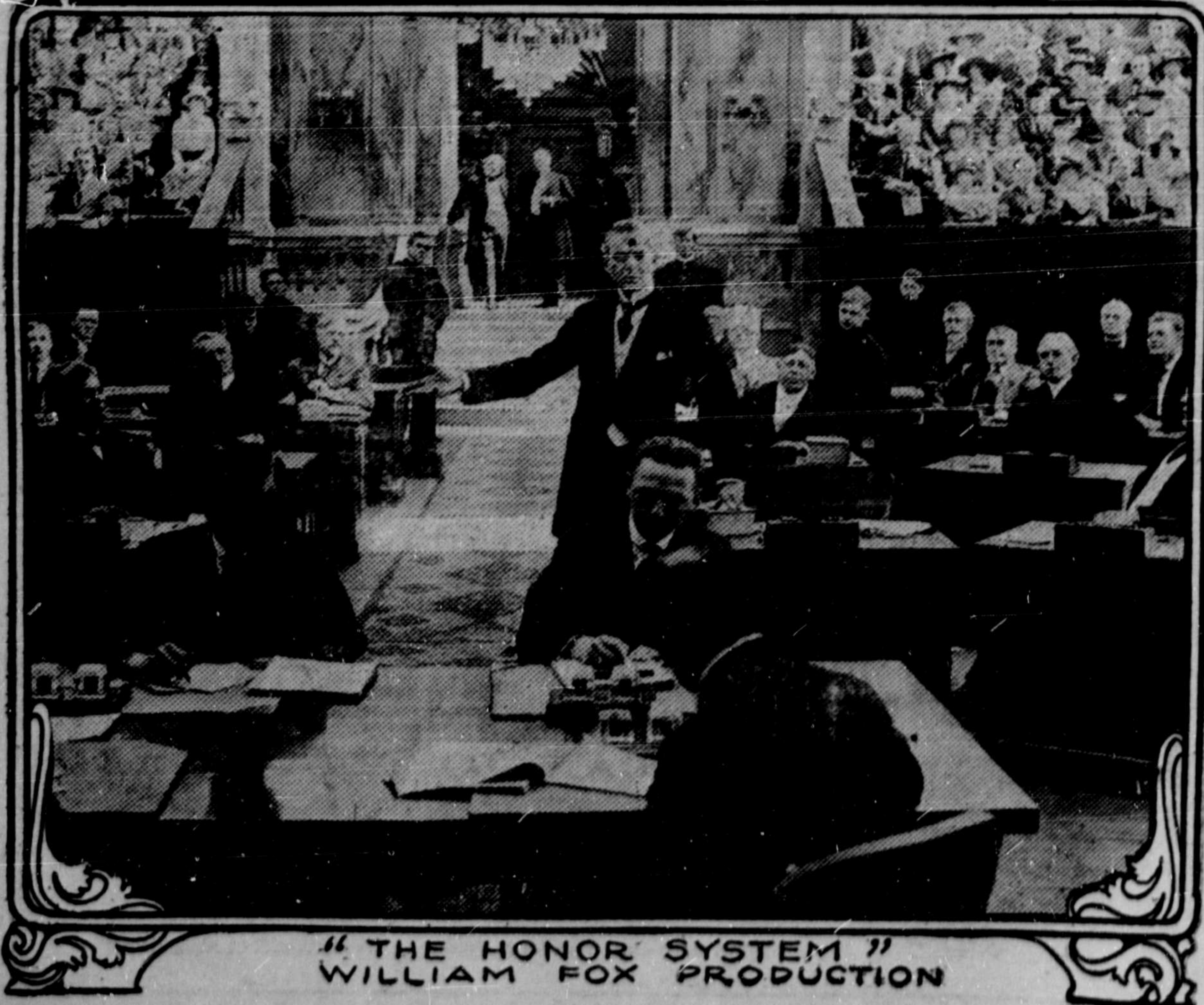
"THE HONOR SYSTEM" WILLIAM FOX PRODUCTION

In "The Honor System" at the Westholme Theatre tonight