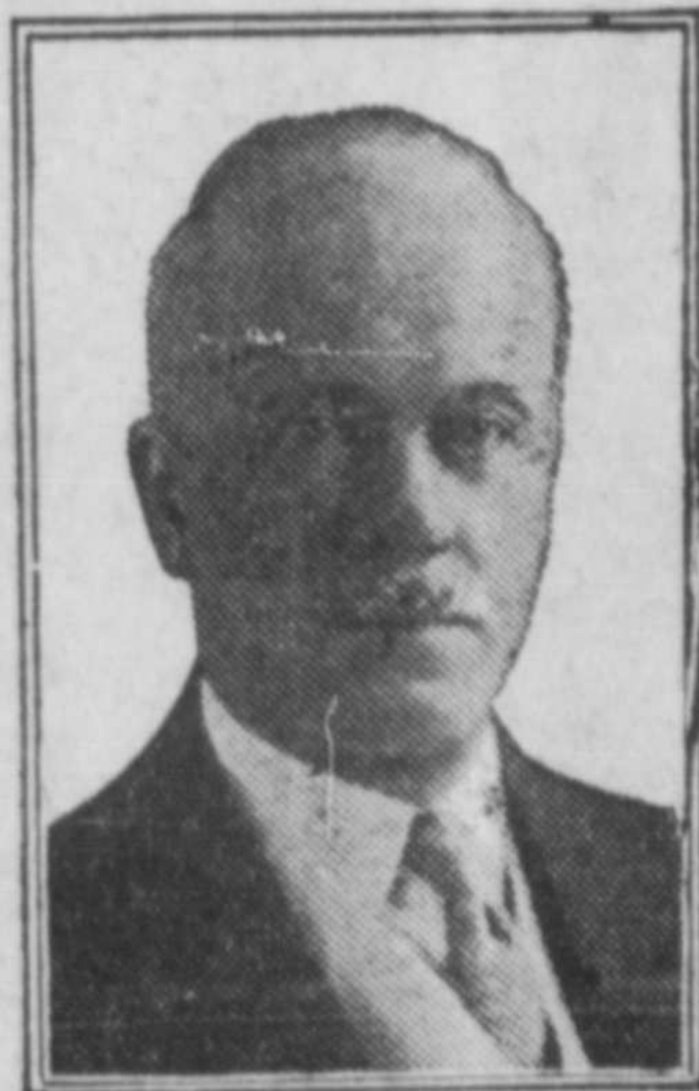
Earl of Bessborough, Governor General of Canada.