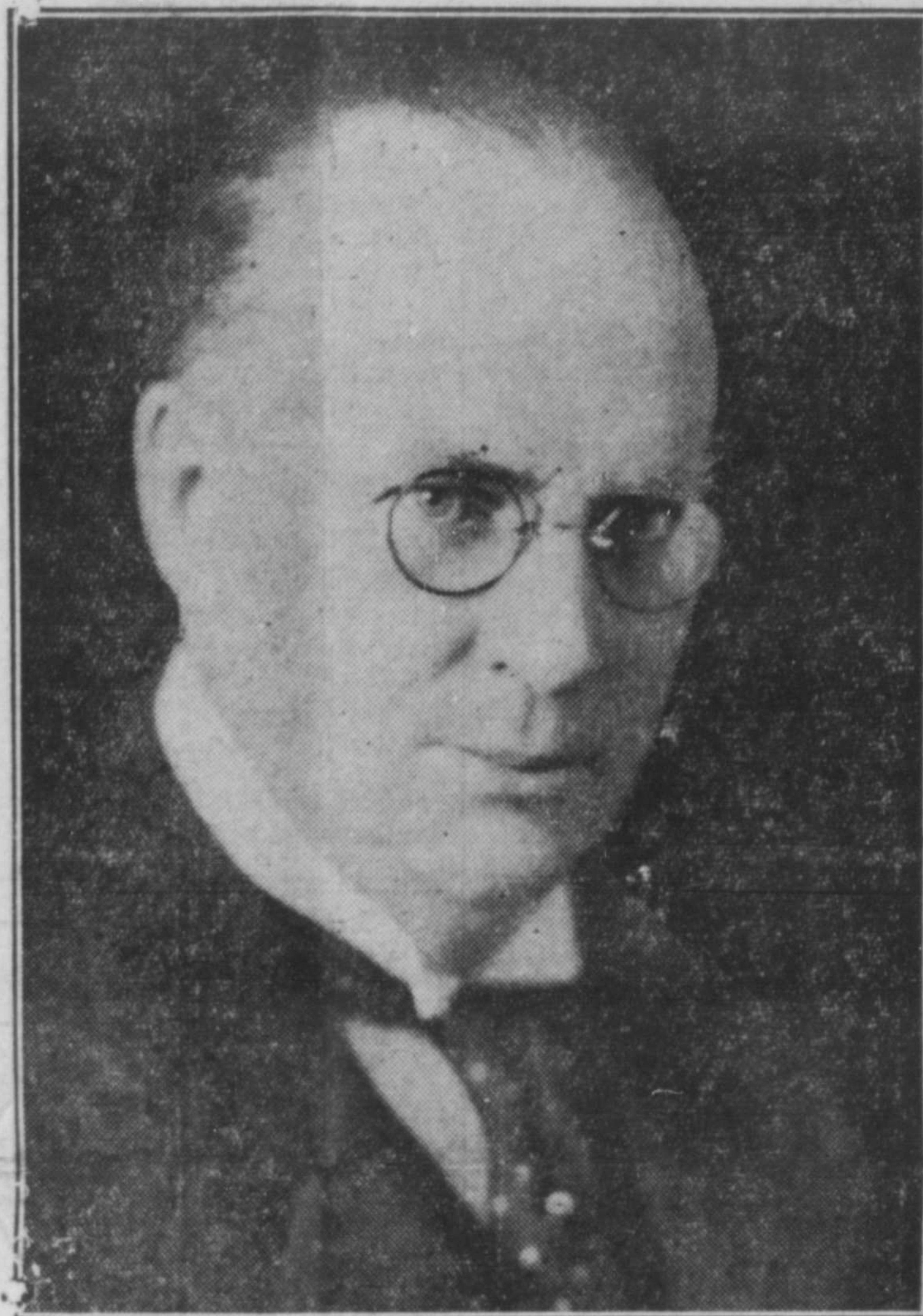
Premier Bennett who took lead in offering proposals at economic conference today.