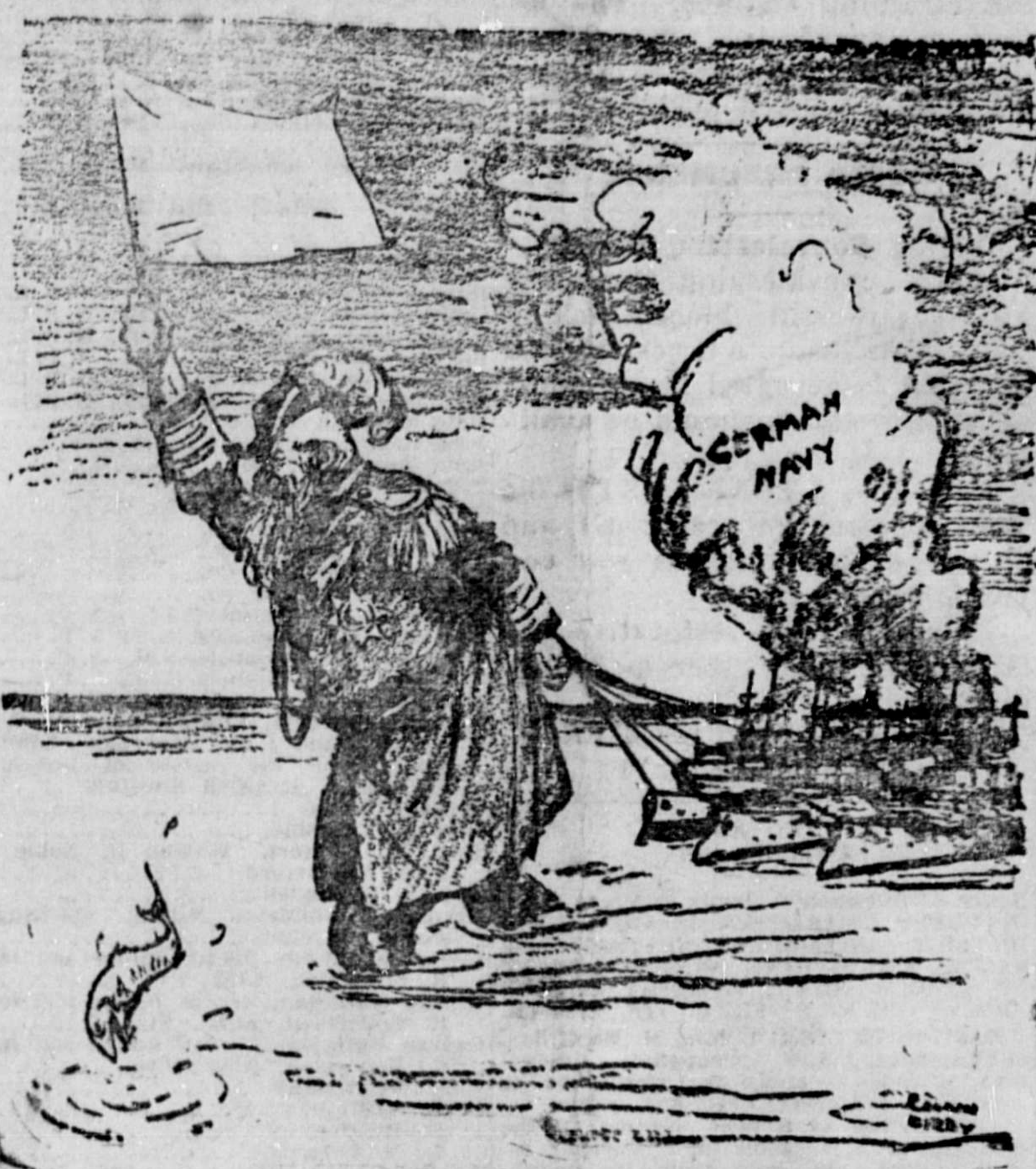
OUT AT LAST.

Ladysmith Wellington Coal reduces your fuel bill and gives satisfaction. Phone 15. P. R. Coal Co.