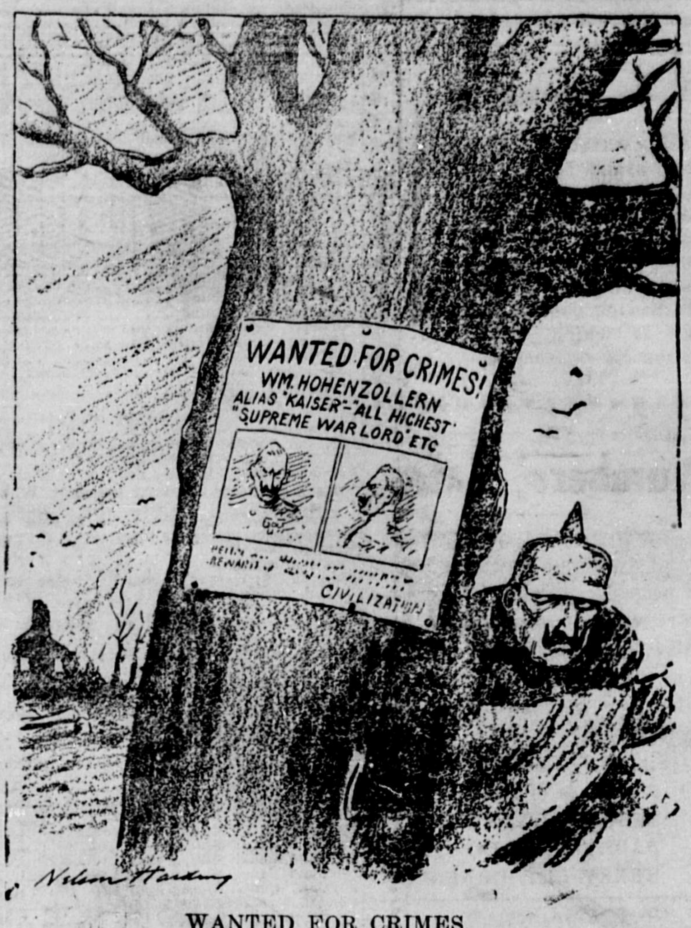
WANTED FOR CRIMES.

(Special via G. T. P. Telegraphs.) Copenhagen, Dec. 14.—The German armistice has been extended until five o'clock of the morning of January 17, according to despatches from Treves.