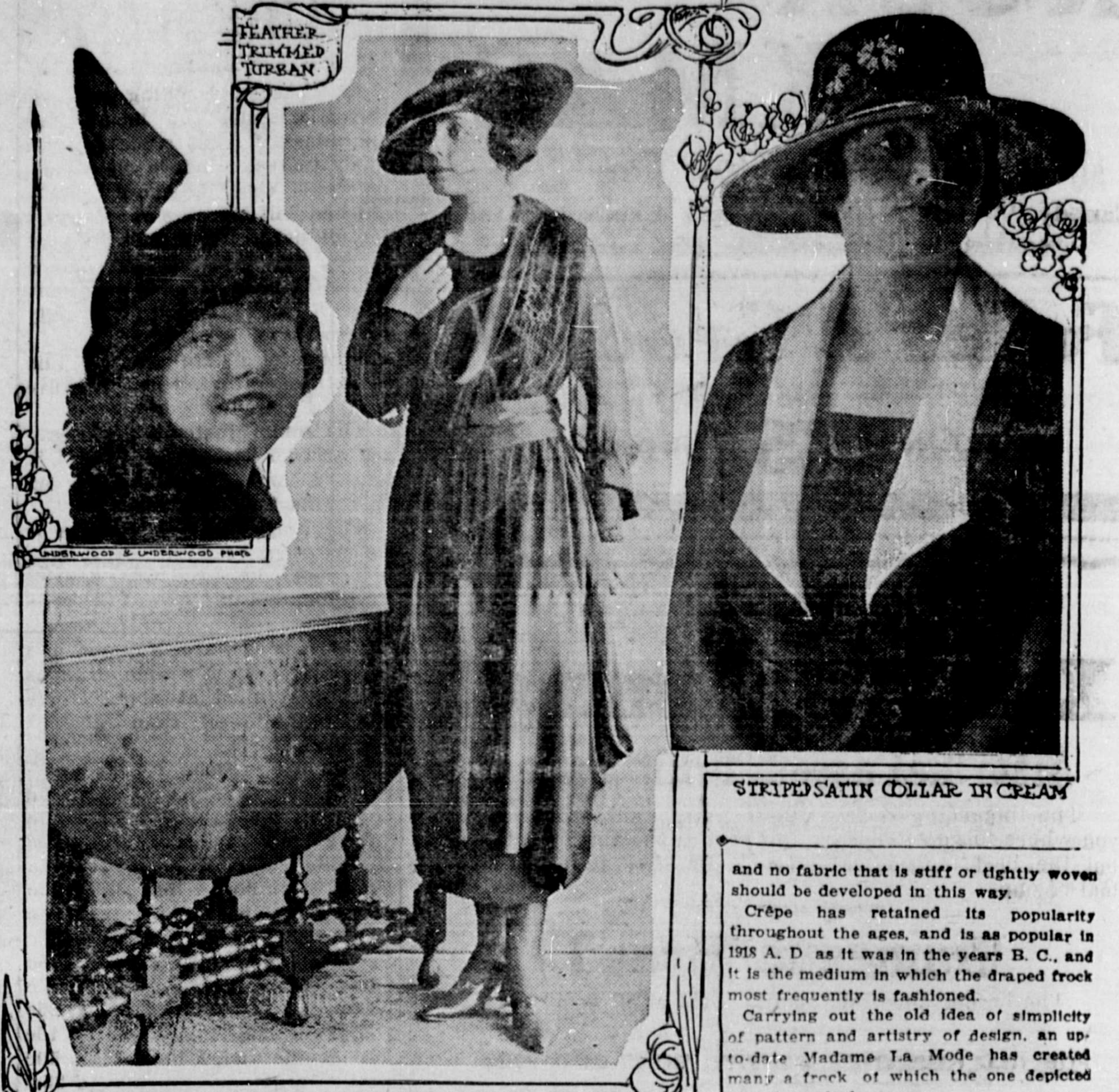
AFTERNOON FROCK OF SILK AND GEORGETTE