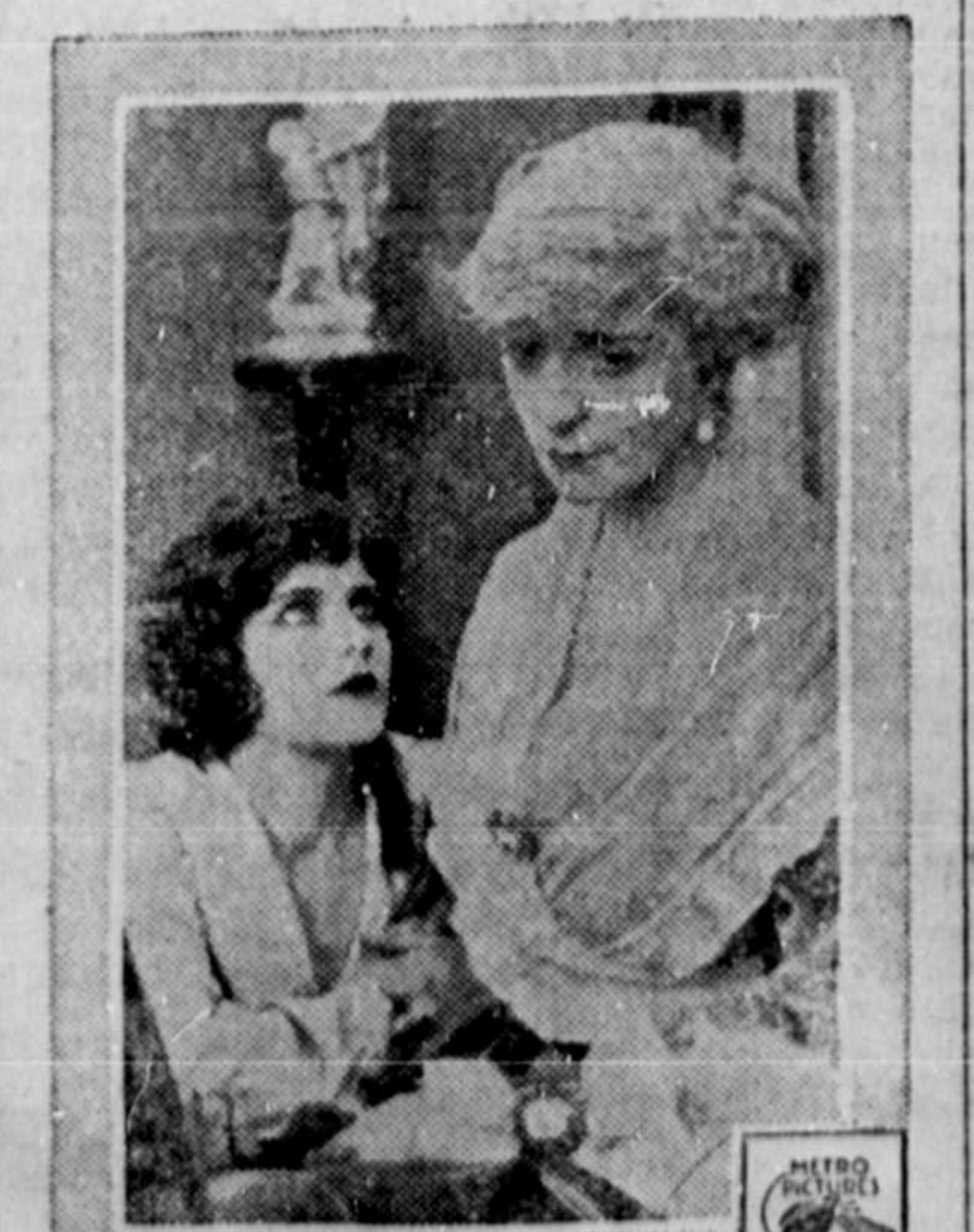
VIOLA DANA in "A WEAVER OF DREAMS" At the Westholme Tonight.