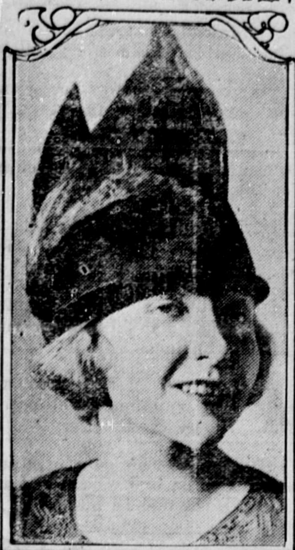
CANADIAN NEWS PAPER UNION

Speaking of hats, perhaps never has there been a season when their variety has been more evident and their variety more pronounced.