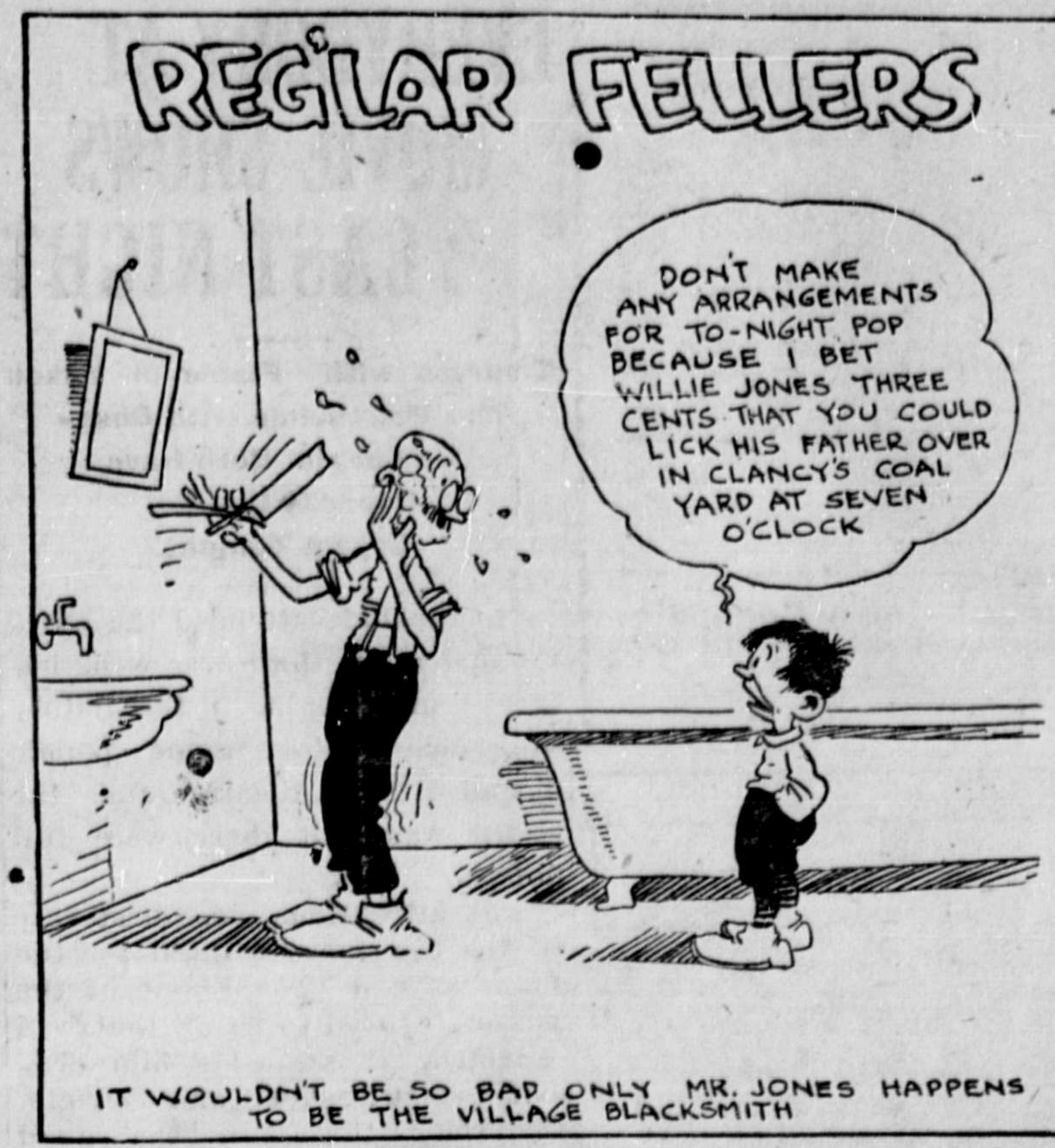
IT WOULDN'T BE SO BAD ONLY MR. JONES HAPPENS TO BE THE VILLAGE BLACKSMITH

As it is expected that it will take at least another twelve months in which to bring all the men back from the front, the Dominion Government has decided after the 31st of March next to supply any deficit which may be required to carry on the work of the Canadian Patriotic Fund after that date. It is therefore earnestly hoped that all who have so gen-