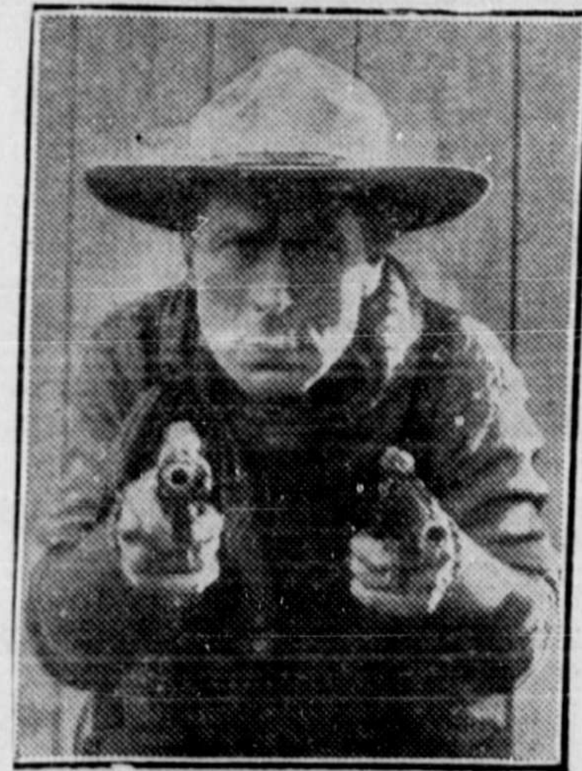
BIG BILL HART.

William S. Hart as the "two-gun man" in the great dramatic success, "The Bargain" will be