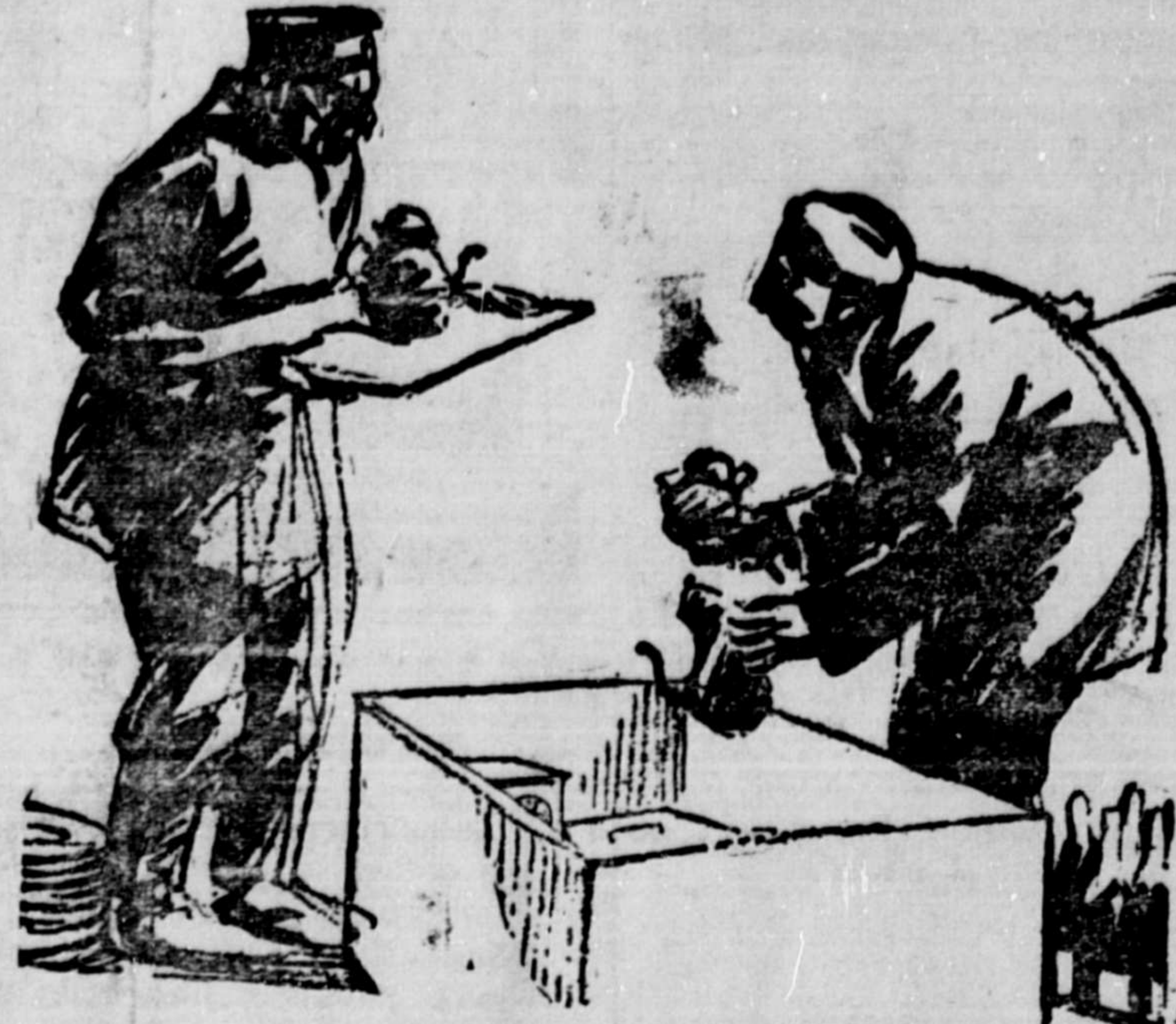
BUT TELL ME, FRITZ, WHEN WE ARE A REPUBLIC WHOM SHALL WE HAVE TO KICK US.

***** * "DEMERS" * * Ladies! Be as particular * * about the fit of your corsets * * as about the fit of your shoes, * * if you would have comfort and wear. * * We have the corset to fit * * you, either front or back * * lace, at prices from $1.75 * * to $10.00 * * * * * * * COME AND SEE * * * * * *