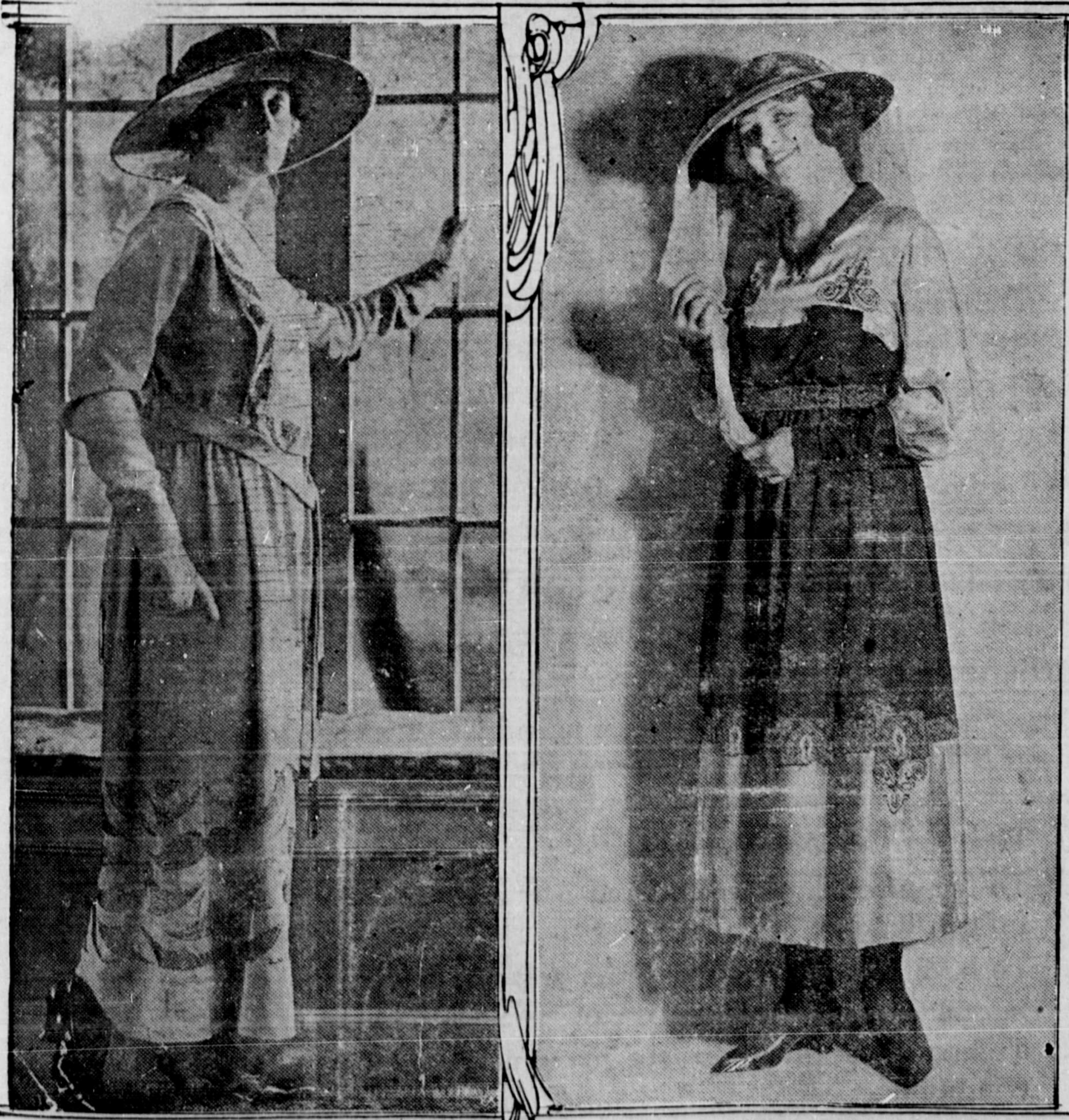
JET BEADS ADORN THIS DUVETYN DRESS