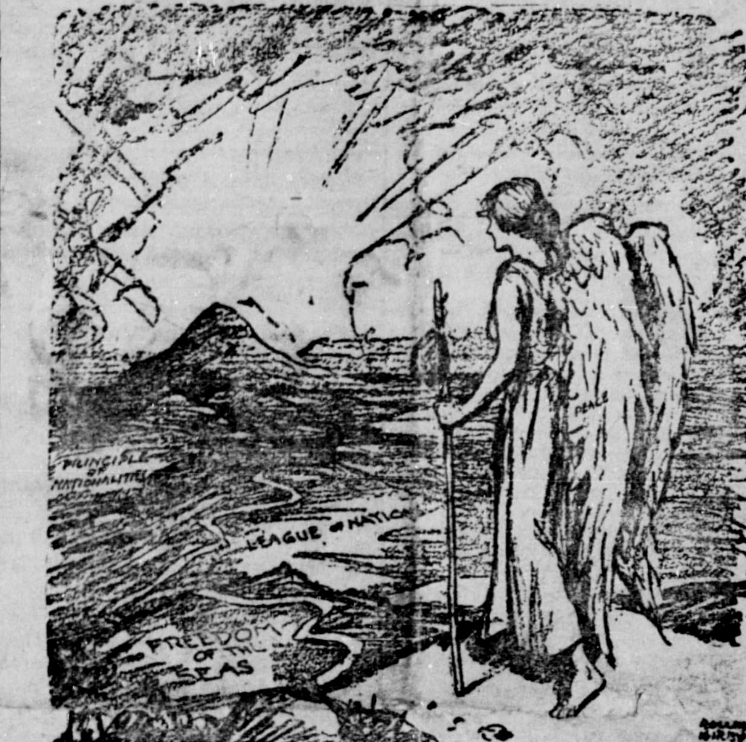
A TWISTING ROAD.