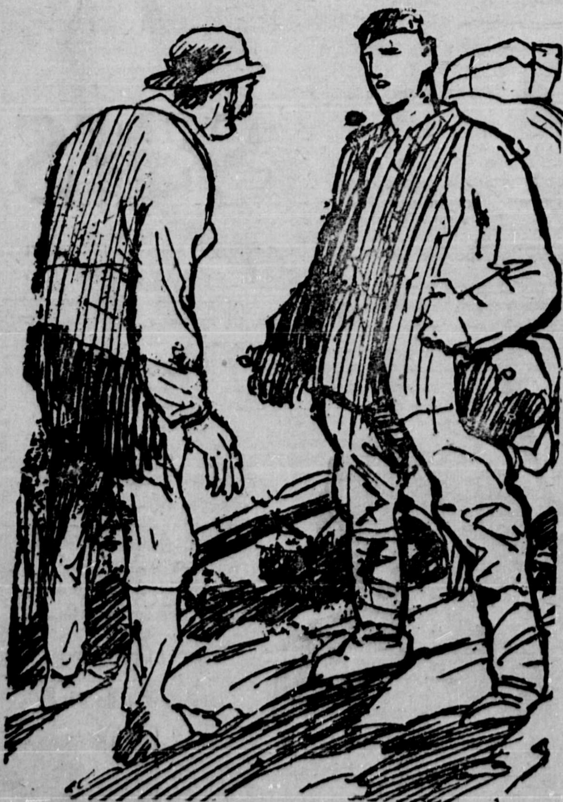
FATHER, THE NEW DAY HAS DAWNED; COME, GIVE ME THE PLOUGH.

"In July, 1917, the Whitley Report was issued. It recommended the setting up, by voluntary co-operation, in well-organized trades of Joint Standing Industrial Councils, representative of employers and employed through their respective organizations. These councils are to act as industrial parliaments, and to deal with conditions of employment, methods of fixing, paying, and readjusting wages; methods of negotiation, security of earnings and employment, technical education, research and invention, legislation affecting the industry, and means for securing to the workpeople a greater share in the control of industry."