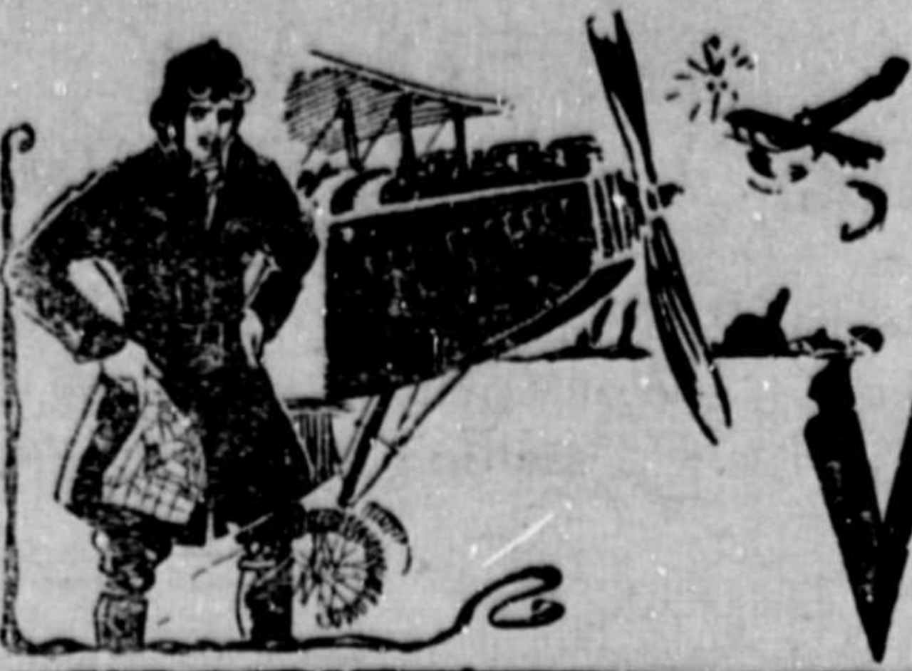
Article No. 10 Cut out for Reference