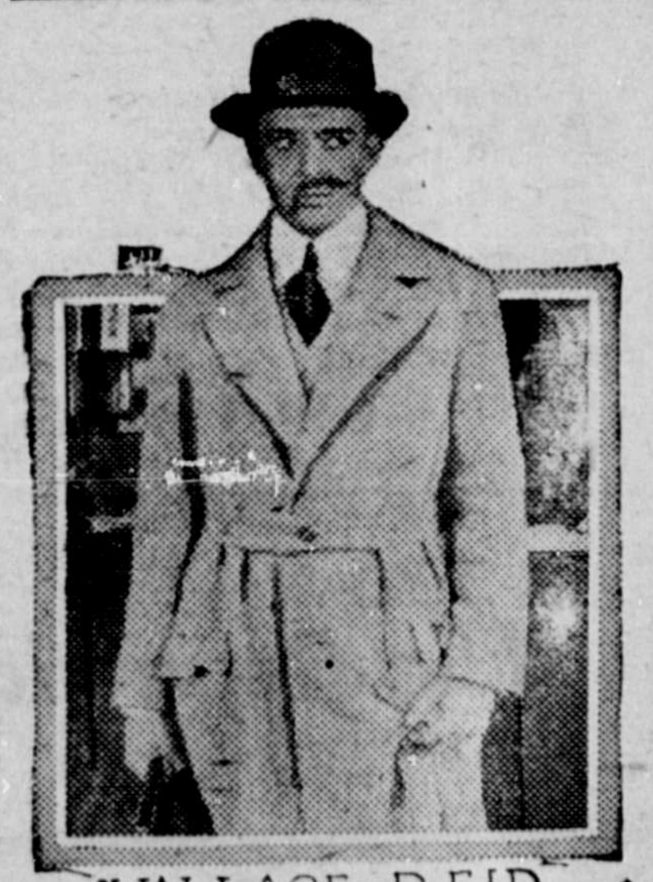
WALLACE REID in "Believe Me Xantippe"

A Wealthy clubman, whose favorite expression is "Believe Me, Xantippe," on discovering that his apartment has been robbed, one night bets $20,000 with two friends that he can commit a crime and elude the police for a year. He forges a check for $100 and goes to Colorado, followed by many police circulars.