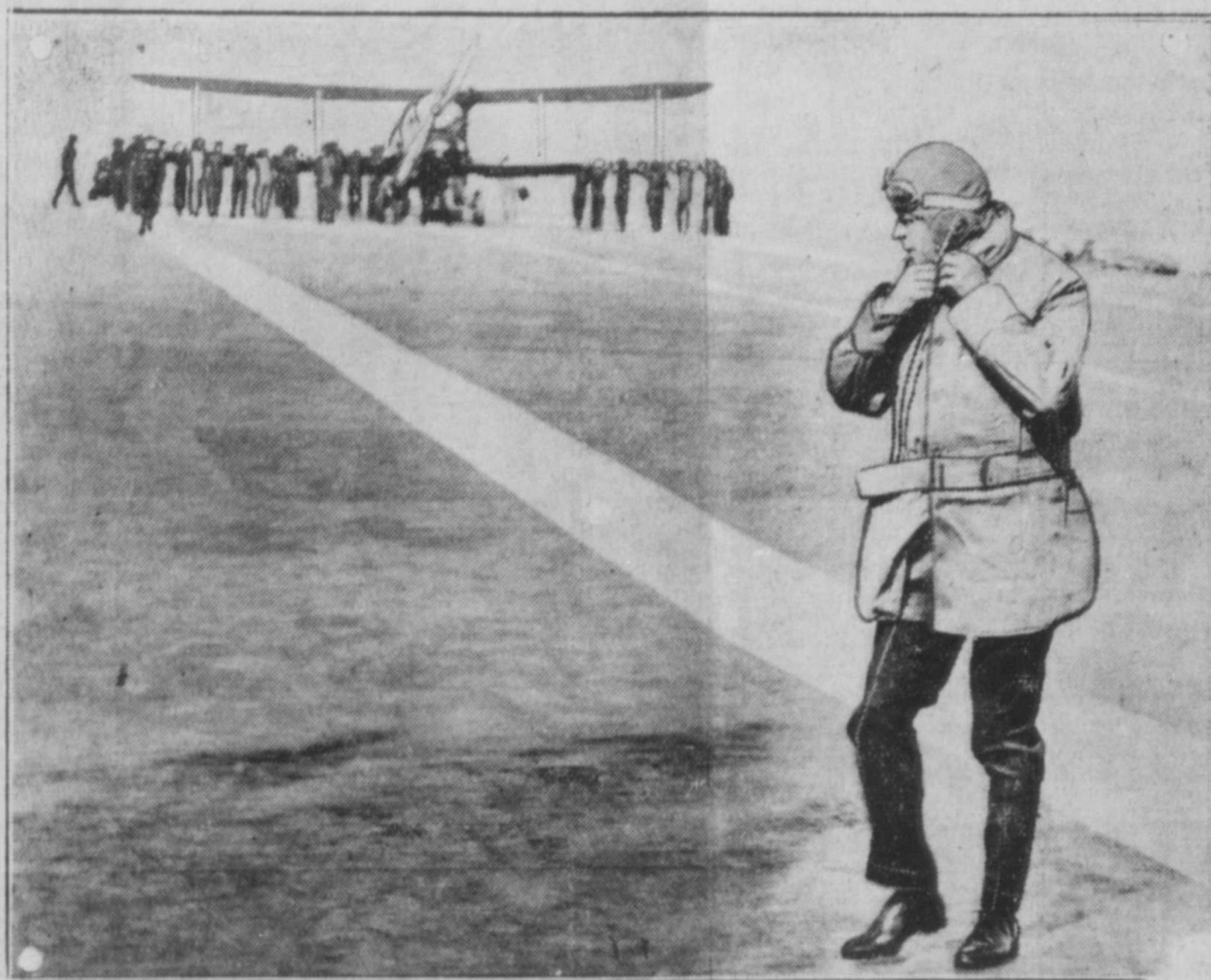
The Prince of Wales adjusts his helmet on the deck of the aircraft carrier Courageous just before taking off for a look at the British fleet from the air during the Weymouth review.