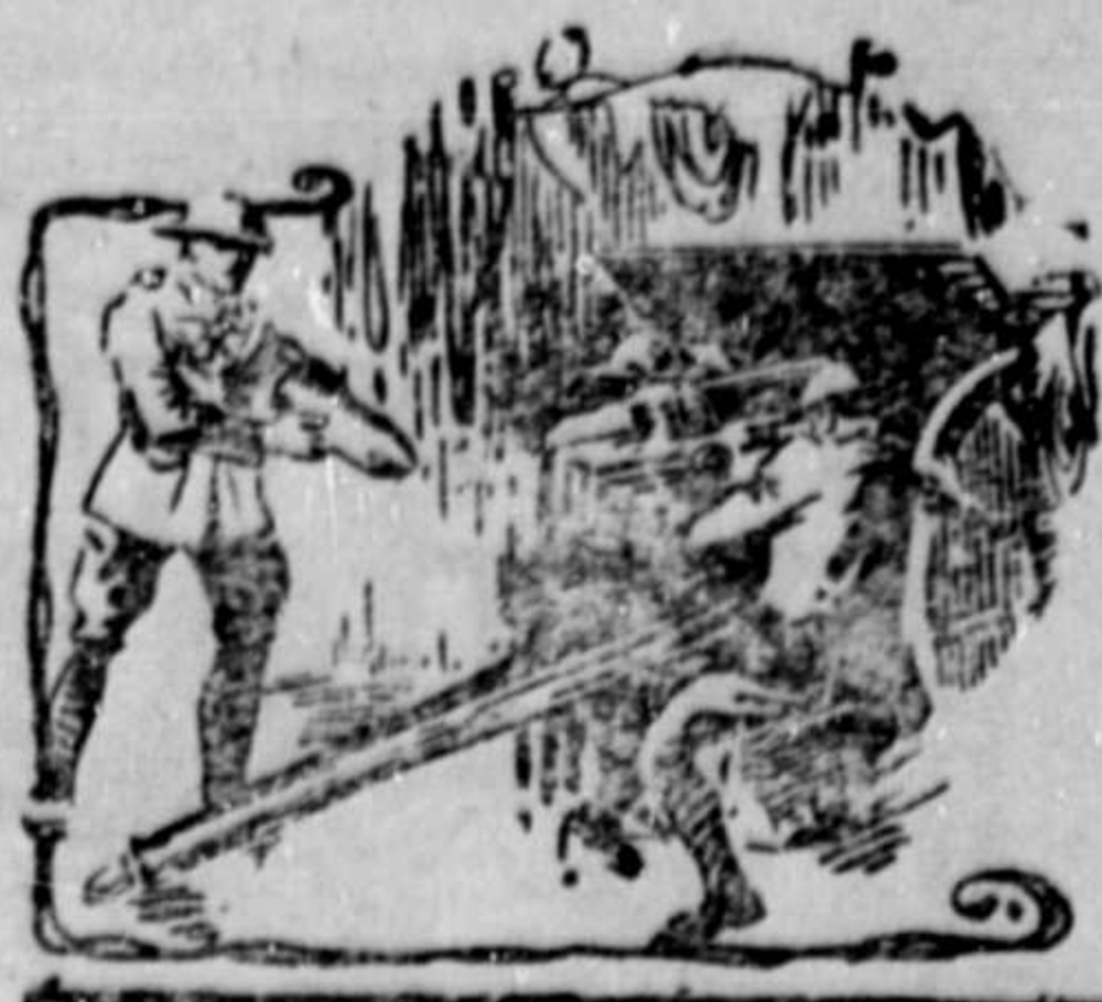
Article No. 13 Cut out for Reference