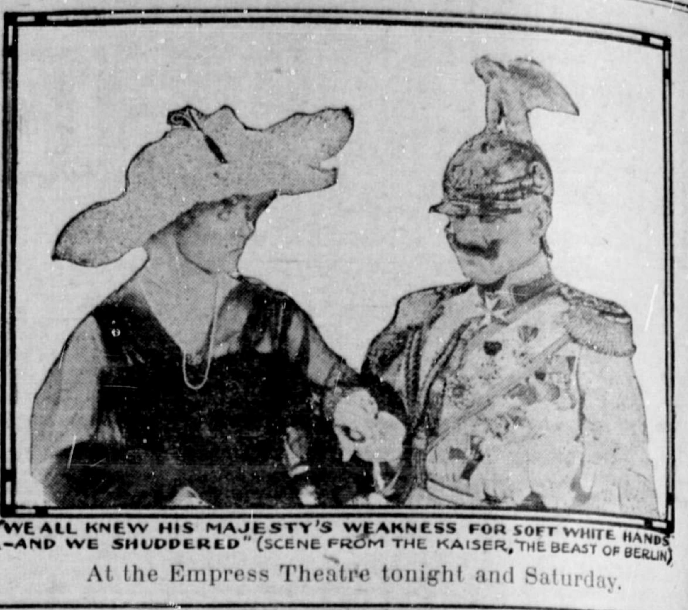
WE ALL KNEW HIS MAJESTY'S WEAKNESS FOR SOFT WHITE HANDS - AND WE SHUDDERED" (SCENE FROM THE KAISER, THE BEAST OF BERLIN) At the Empress Theatre tonight and Saturday.