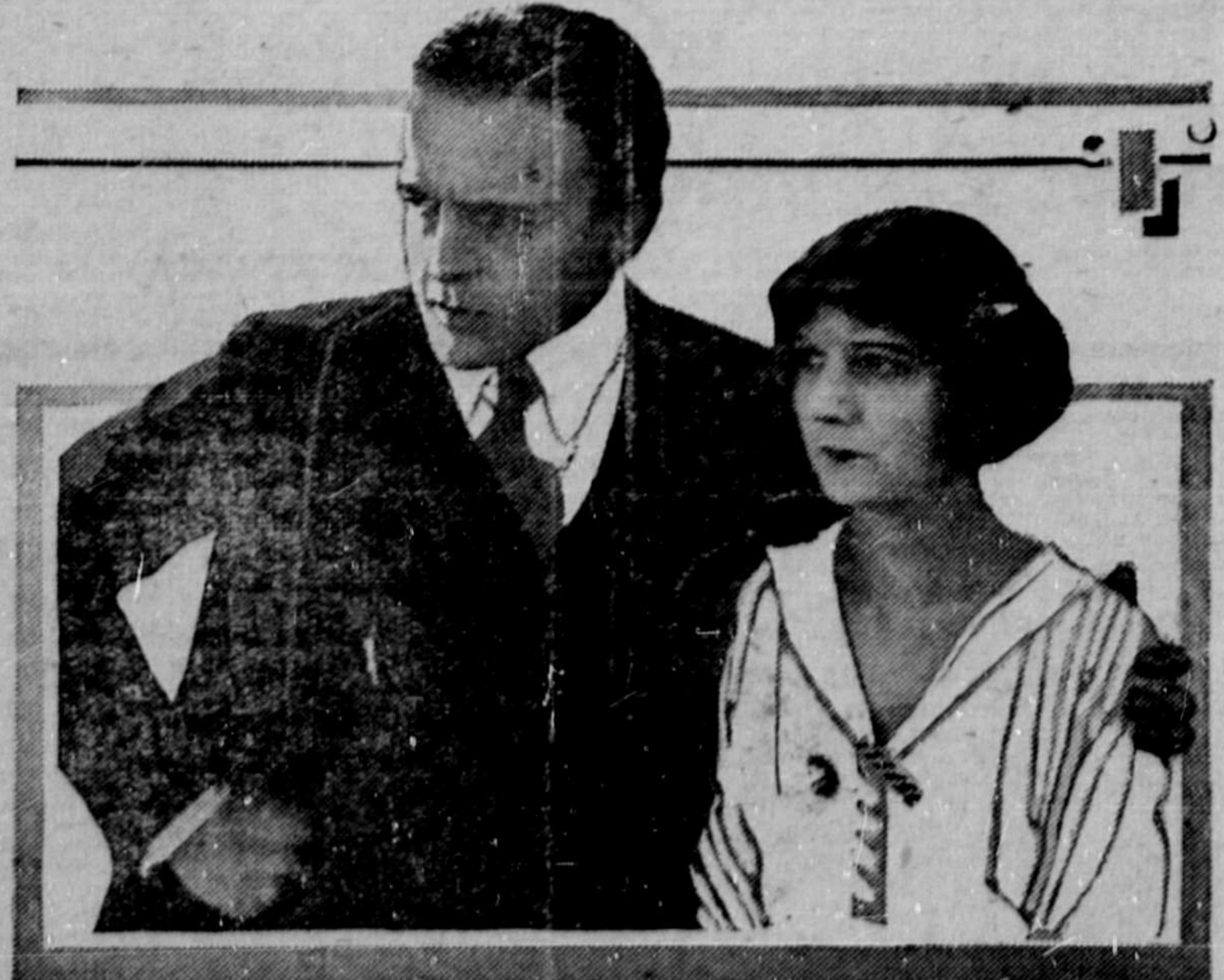
"The trial" WALLACE REID in "The Madonna Funeral Range" Starring tonight at the Westholme Theatre.