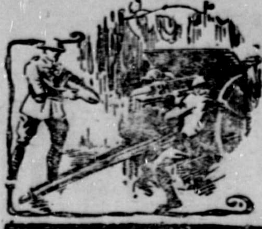
Article No. 15 Cut out for Reference