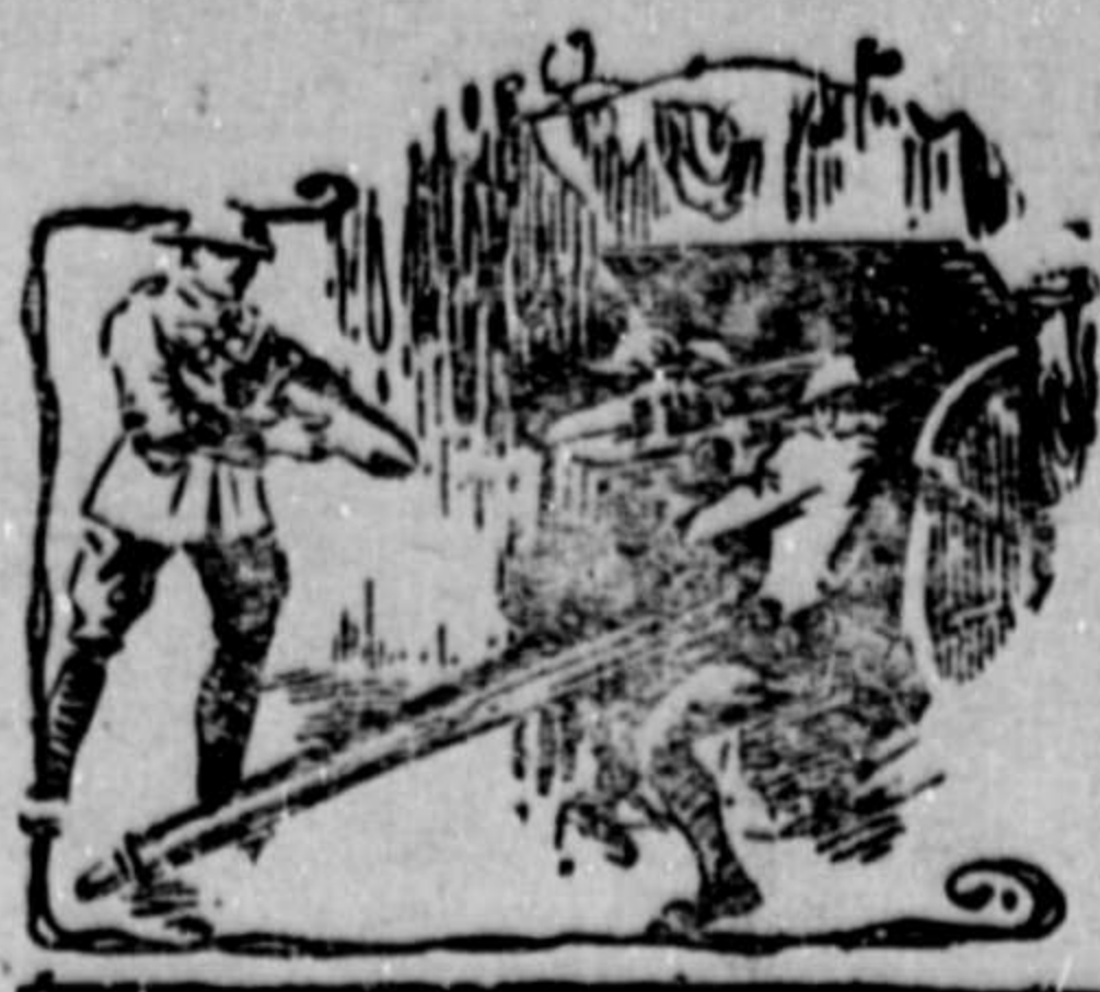
Article No. 13 Cut out for Reference

LAND ACT NOTICE OF INTENTION TO APPLY TO PURCHASE LAND. N QUEEN CHARLOTTE ISLANDS LAND DISTRICT—RECORDING DISTRICT OF SKEENA—AND SITUATE ON THE SHORE OF GRAY BAY, MORESBY ISLAND. TAKE NOTICE that I, Yoshimatsu MUKAI, of Vancouver, British Columbia, farmer, intend to apply for permission to purchase one hundred and sixty acres of land bounded as follows:— Commencing at a post planted at the North East corner of Lot 866, Moresby Island, on Gray Bay; thence West twenty chains; thence North eighty chains; thence East twenty chains to the foreshore; thence following the foreshore southerly to the point of commencement, containing 166 acres more or less. YOSHIMATSU MUKAI, A. D. DATED this 5th day of December, 1918.