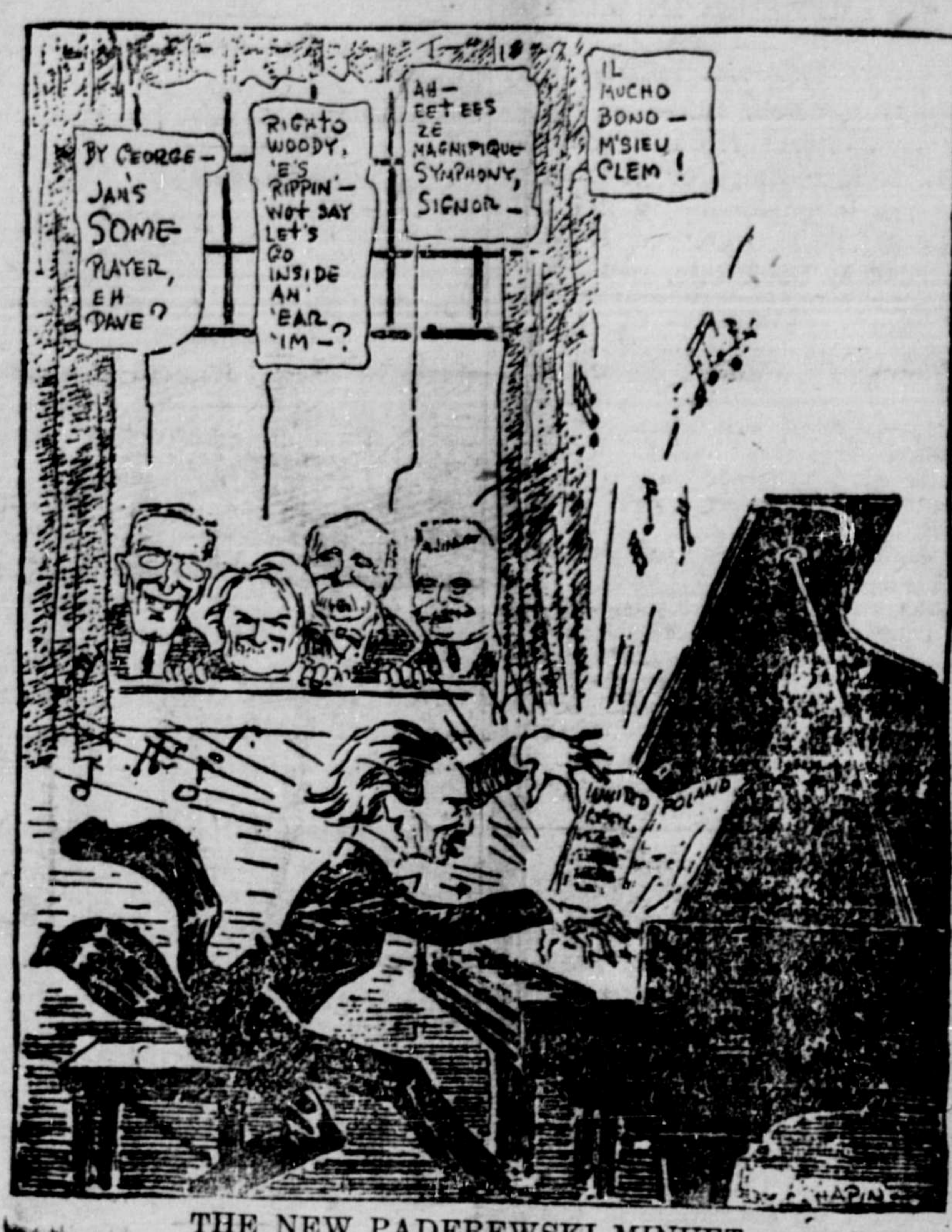
THE NEW PADEREWSKI MINUET.