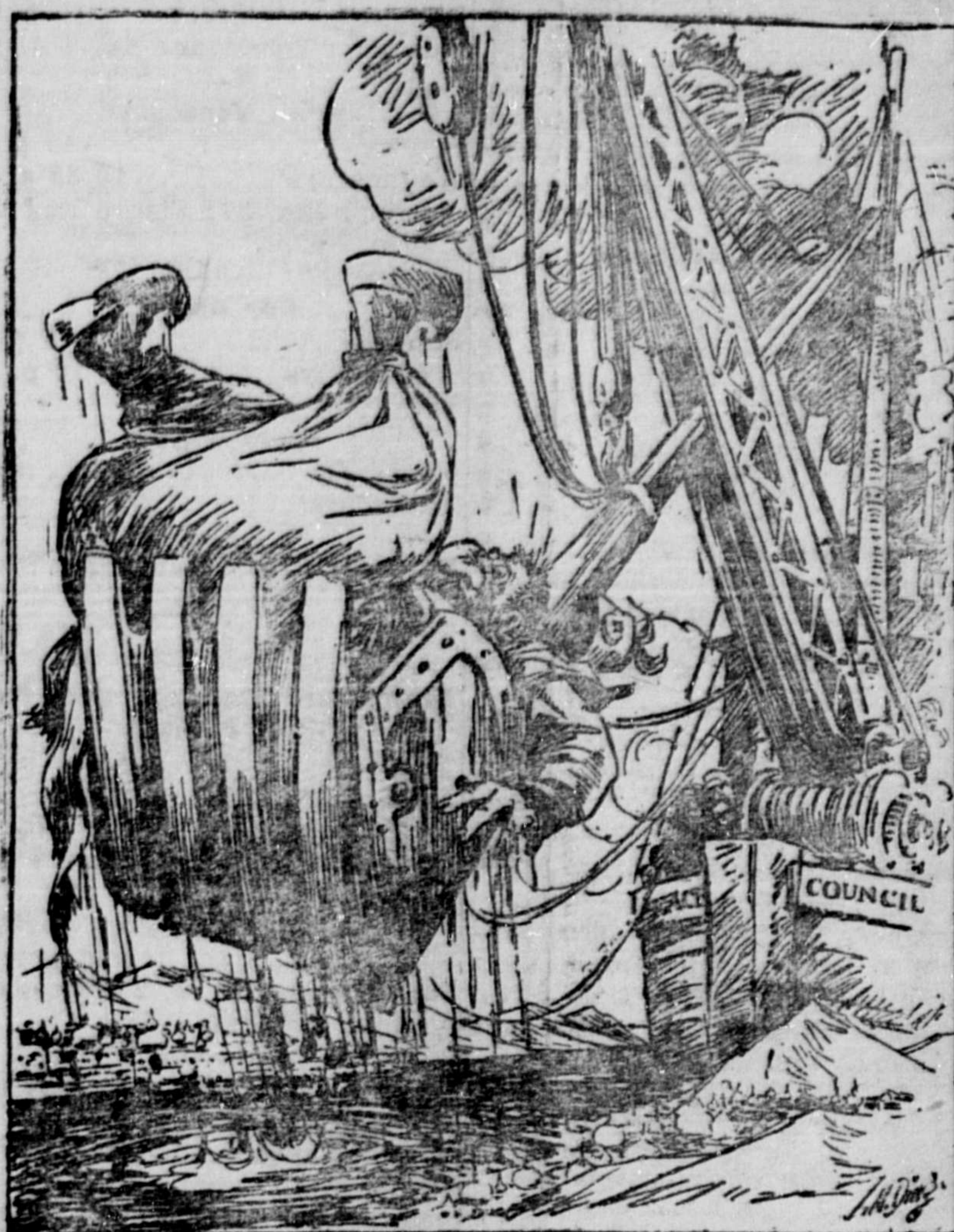
MAKING THE DARDANELLES SAFE FOR NAVIGATION.

The talk of the town, "A Perfect 36," at the Westholme tonight.