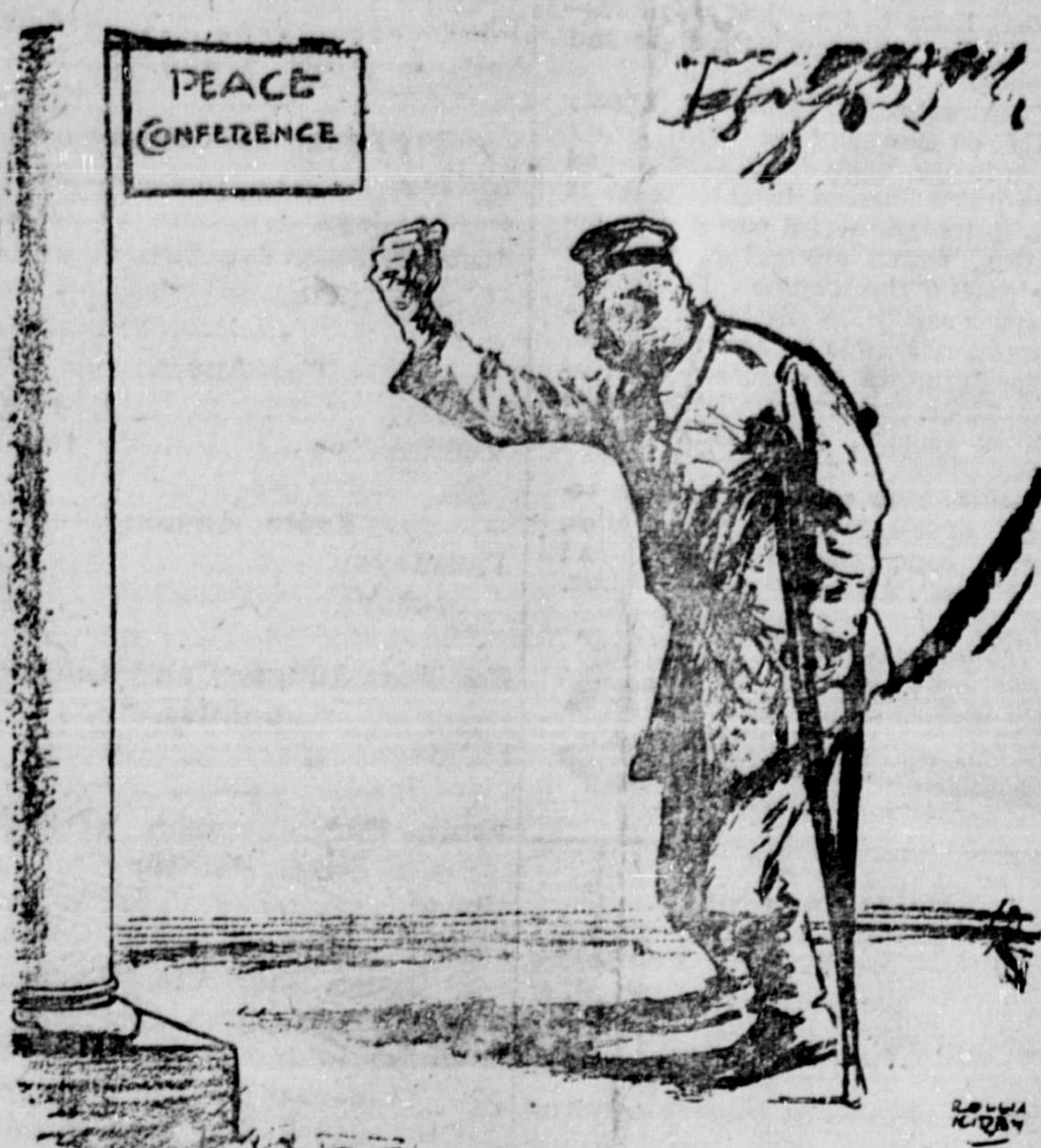
LOOK OUT OR I WON'T CONSIDER MYSELF DEFEATED

SOPHIA INQUIRY Vancouver, March 1. The Princess Sophia inquiry which has been adjourned at Juneau, will be resumed at either Victoria or Vancouver but no date has been set as yet.