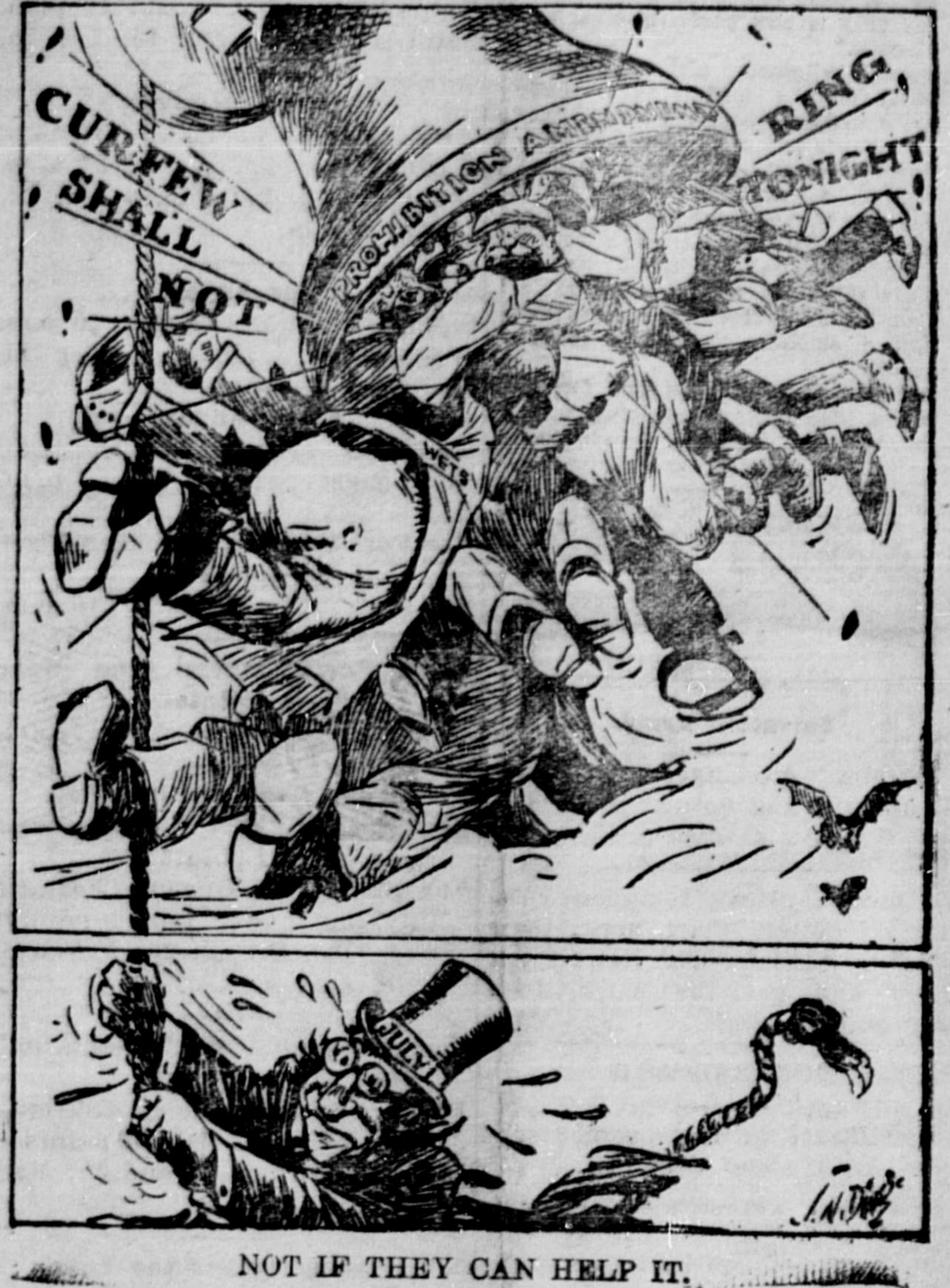
NOT IF THEY CAN HELP IT.