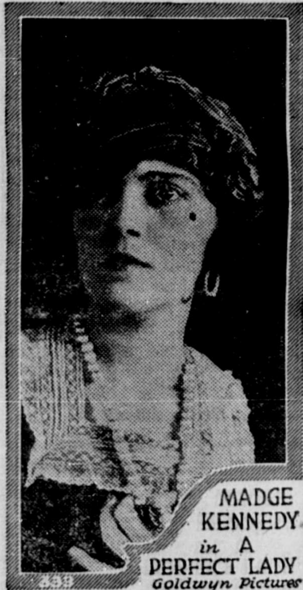
MADGE KENNEDY in "A PERFECT LADY" Goldwyn Picture

The photoplay to be screened at the Westholme Theatre this evening is one of the newest Goldwyn pictures. "A Perfect Lady" is a photoplay full of exciting situations and humorous