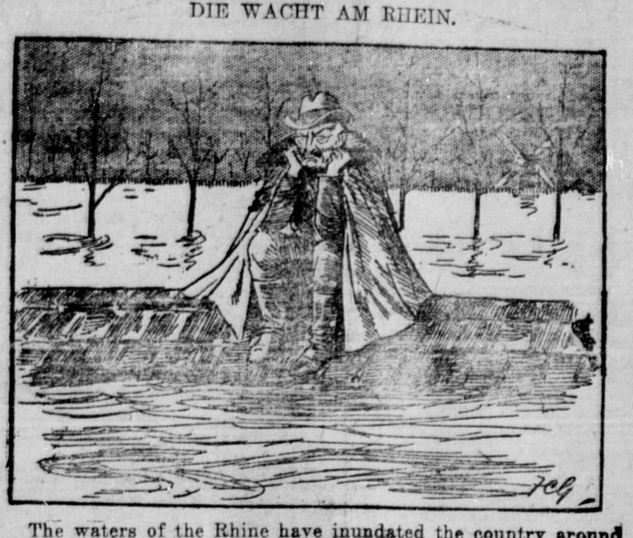
The waters of the Rhine have inundated the country around Amerongen.