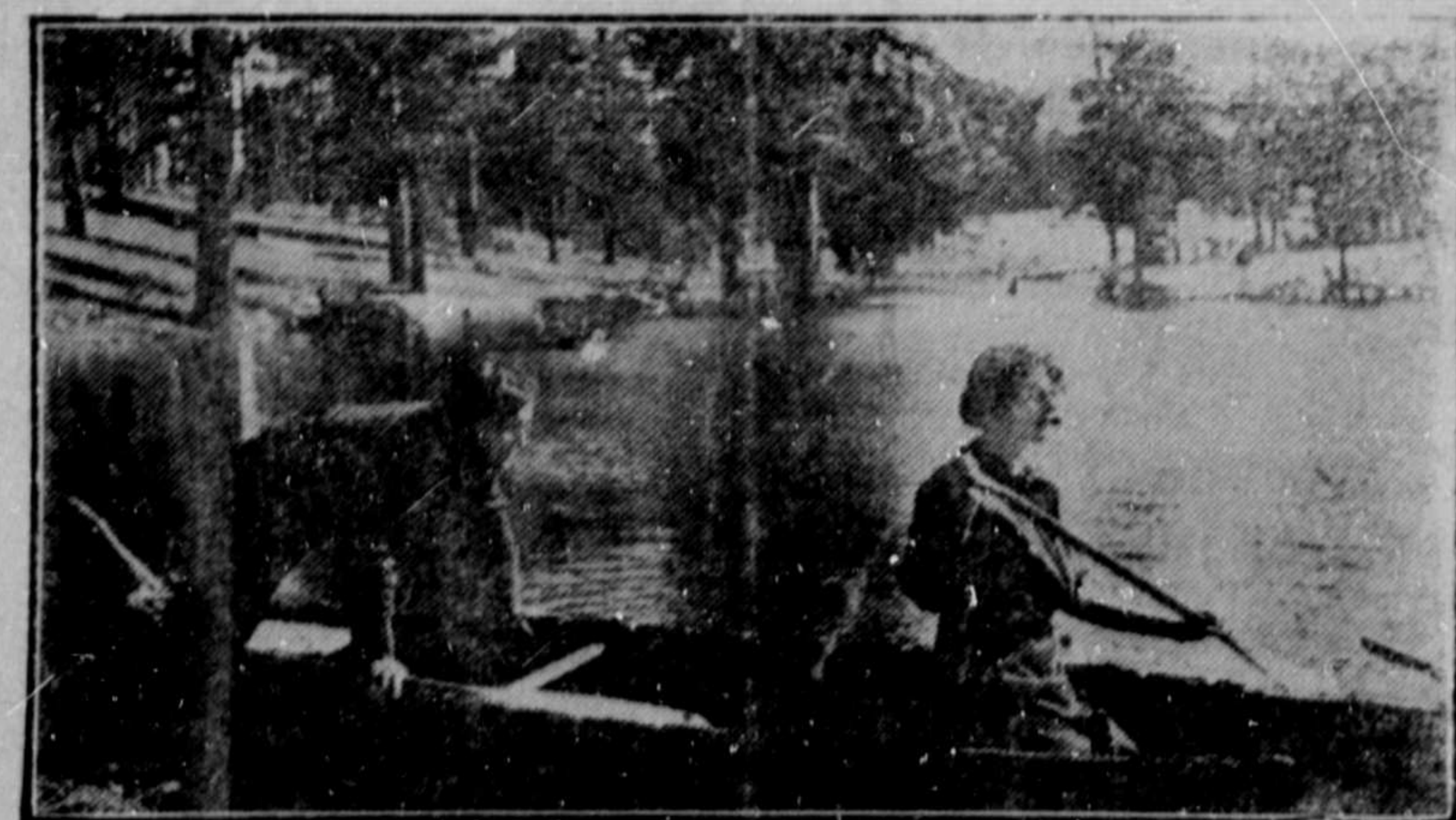
At the Empress Theatre tonight