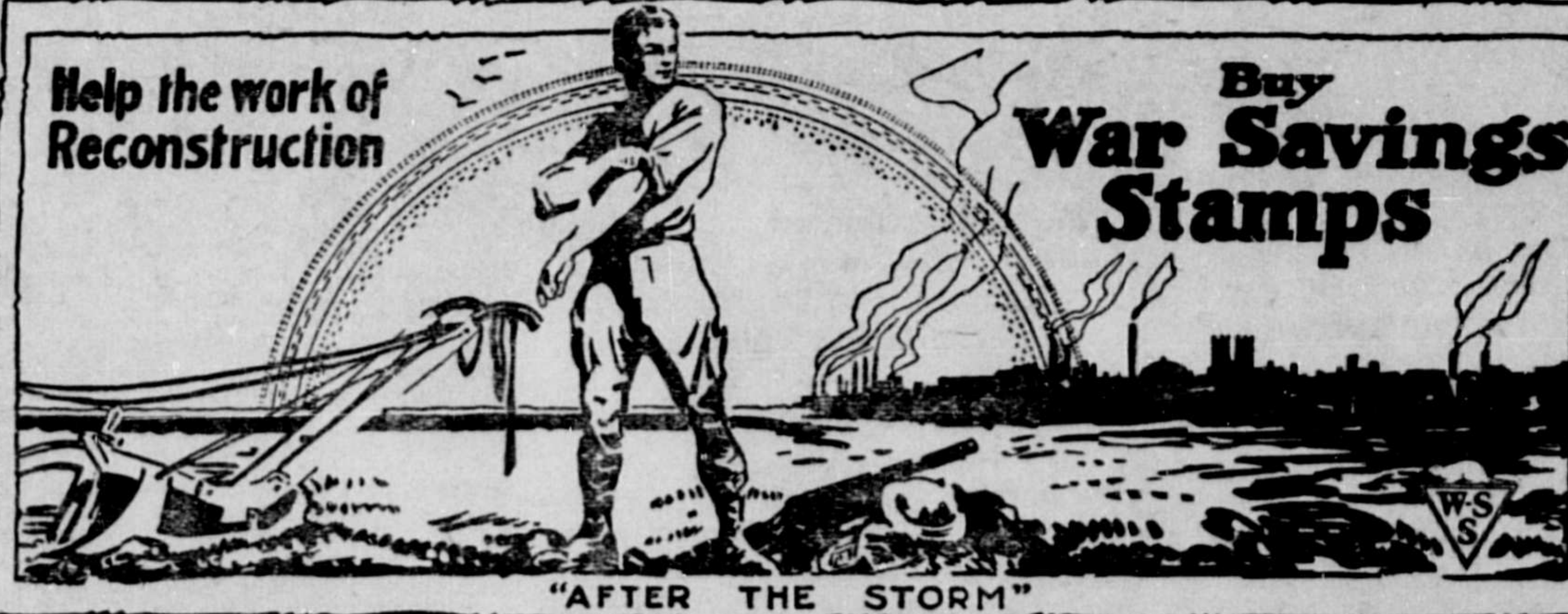
"AFTER THE STORM"