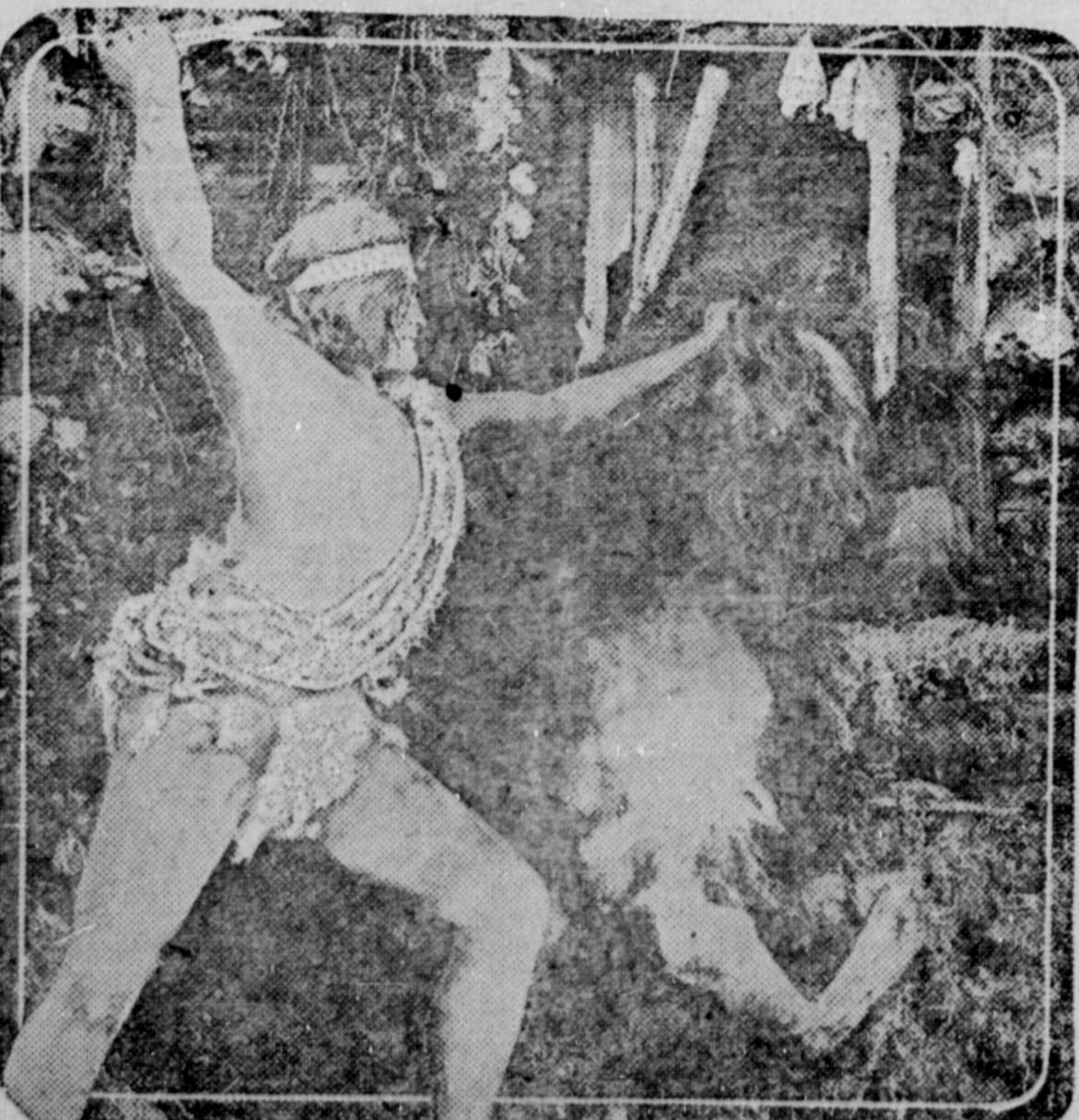
TARZAN OF THE APES DROVE HIS KNIFE DEEP INTO THE LION

Starring tonight at the Westholme Theatre.