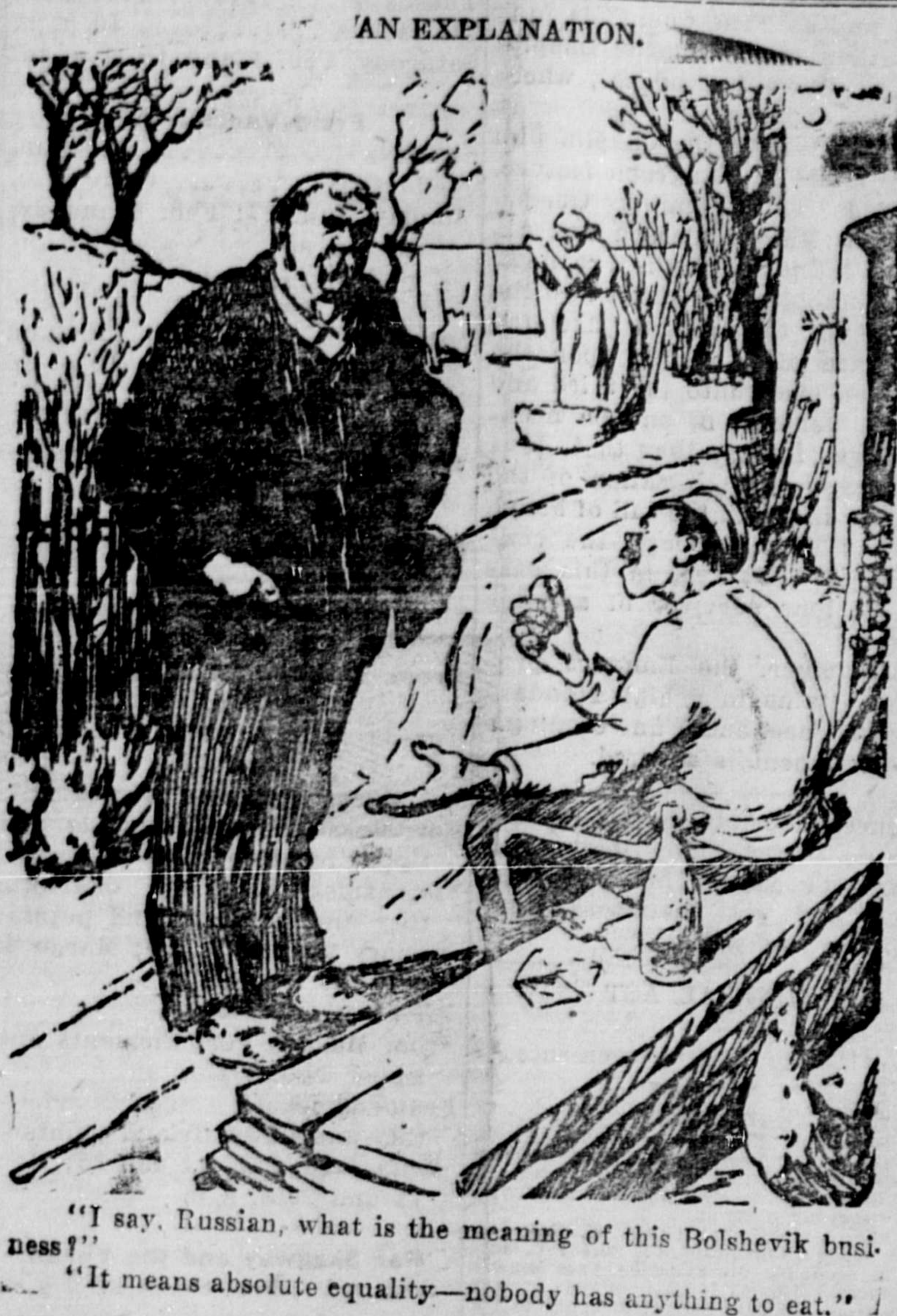
"I say, Russian, what is the meaning of this Bolshevik business?" "It means absolute equality—nobody has anything to eat."