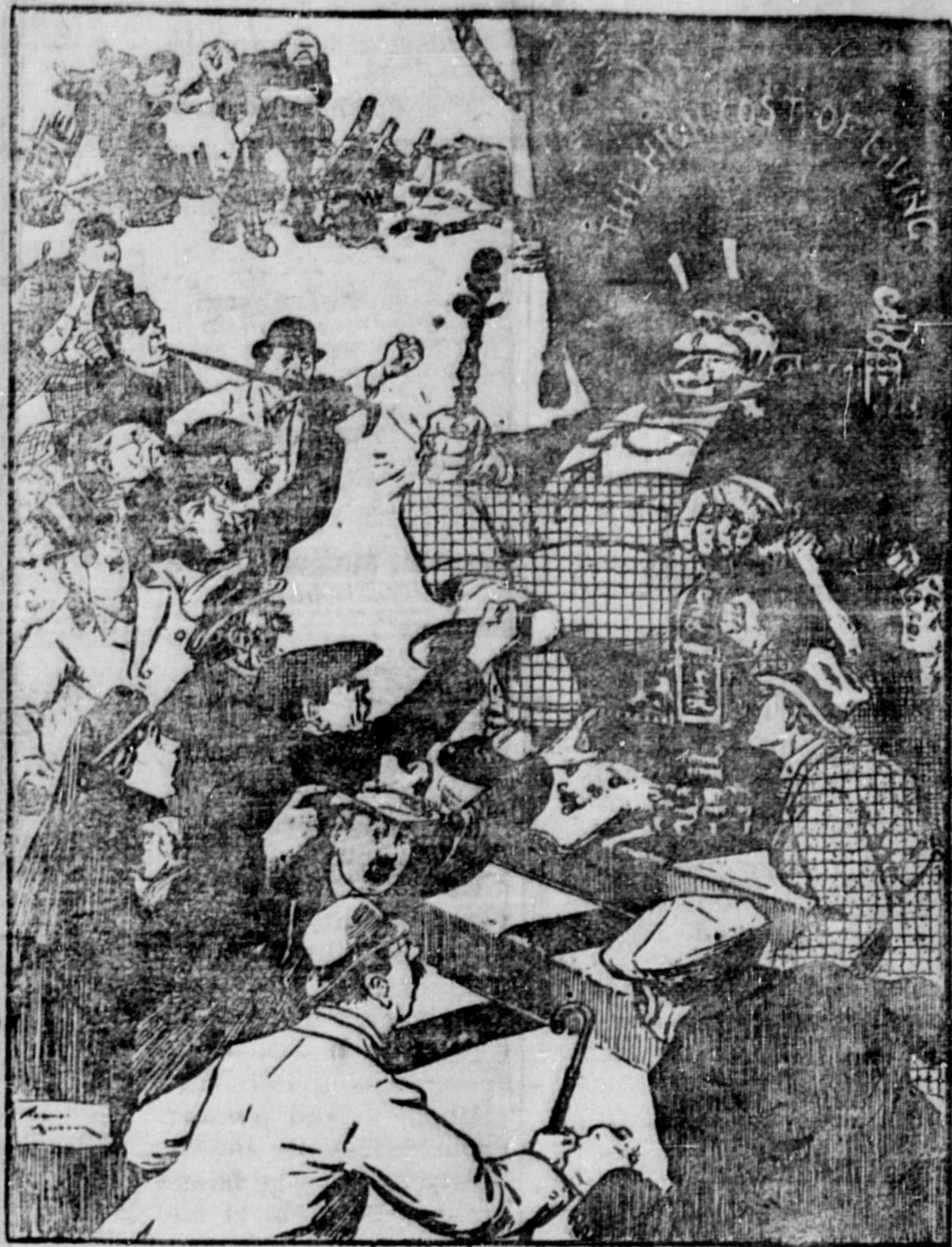
THE LAST OF THE TYRANTS.

No Canadian Wrong. If the battle of Cambrai was wrong it was not due to General Currie and to the Canadian high command. If anything was wrong it was due to the British general staff, and their action had the concurrence of the greatest military genius of the age.