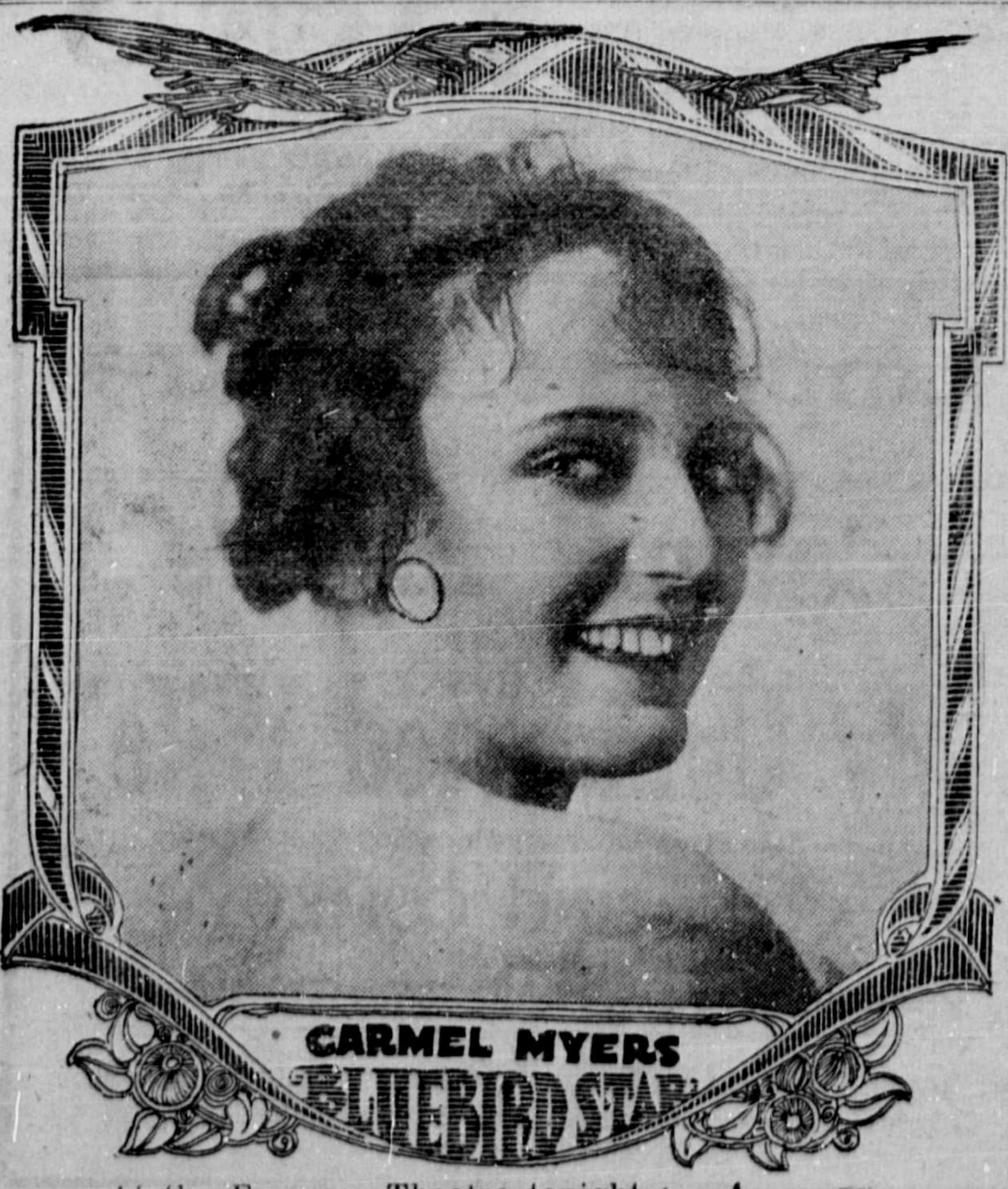
At the Empress Theatre tonight

Local Irishmen are celebrating the day by a concert in the Westholme Theatre and a dance in the St. Andrew's Hall.