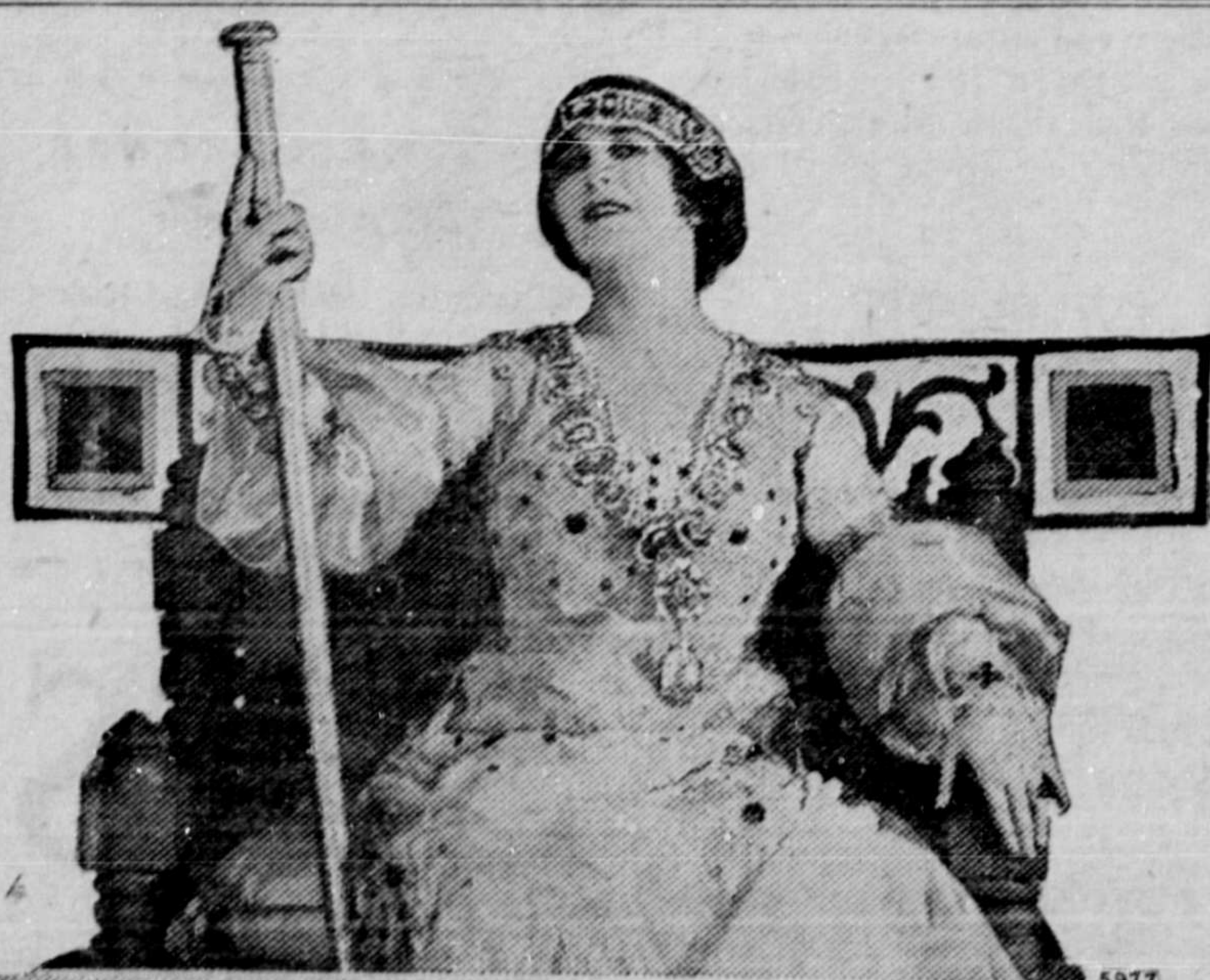
LINA CAVALIERI in "Love's Conquest" Starring tonight at the Westholme Theatre.

The case of the Hindus is quite different, however. They are British subjects and they have been fighting side by side with Canadians against the German menace. At the same time there is no good reason why they should be allowed to move to this country to the menace of our institutions. The Hindus are better in their own country and we must continue to insist that restrictions be maintained against any large immigration to British Columbia.