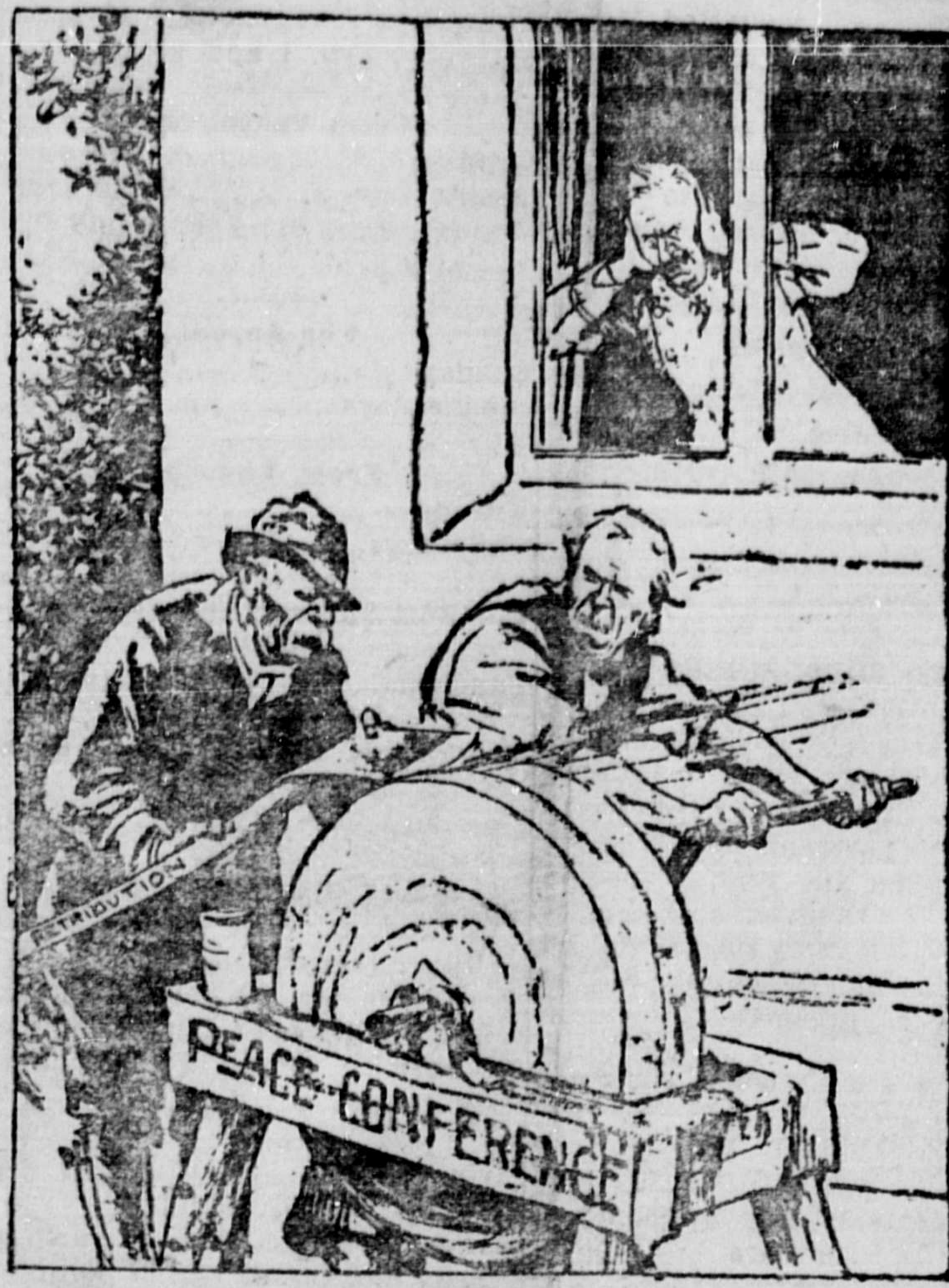
THE EX KAISER: "What a blood-curdling noise!"