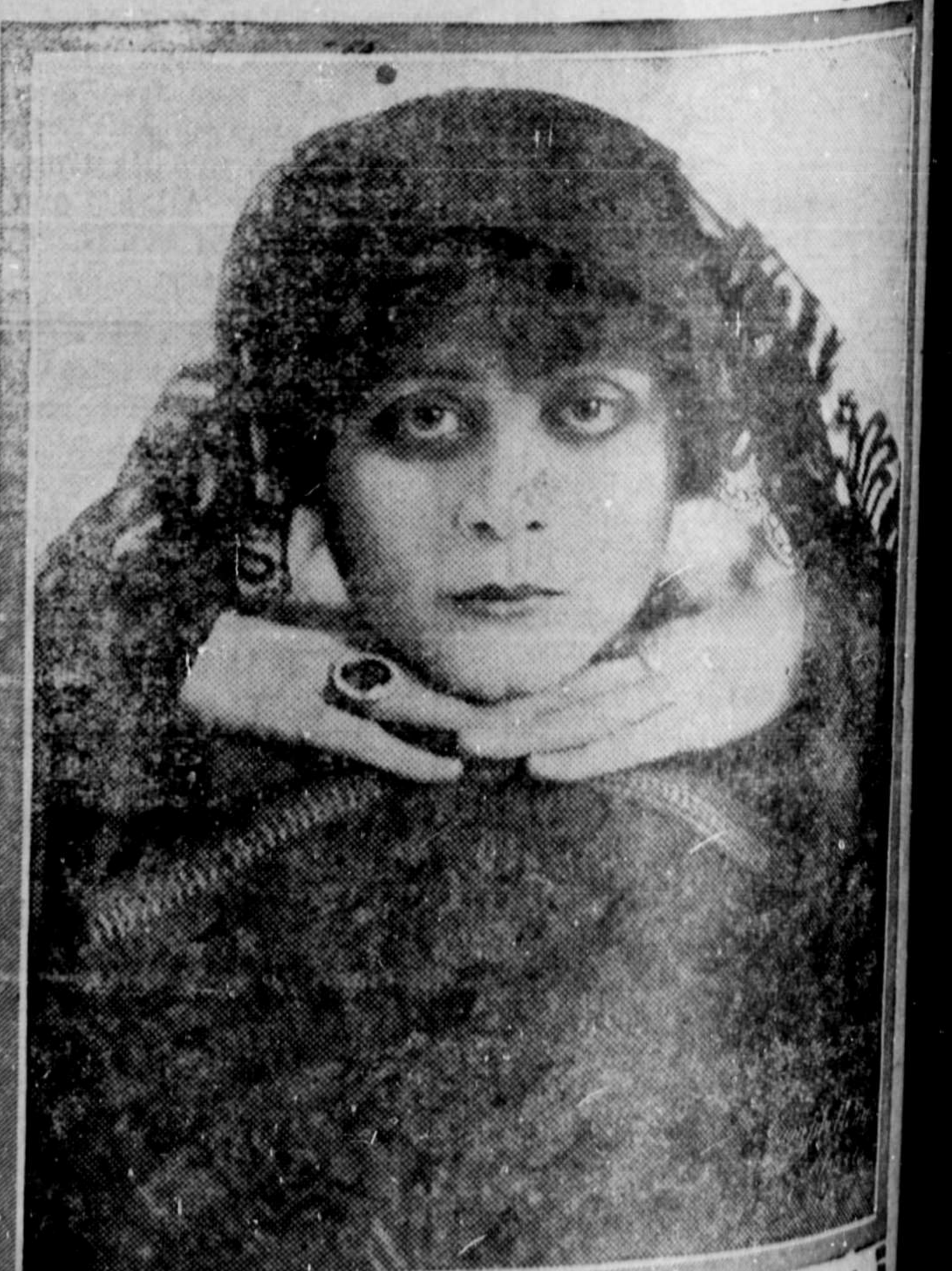
Starring tonight at the Westholme Theatre.

Prince Rupert Academy of Music in Connection with Store