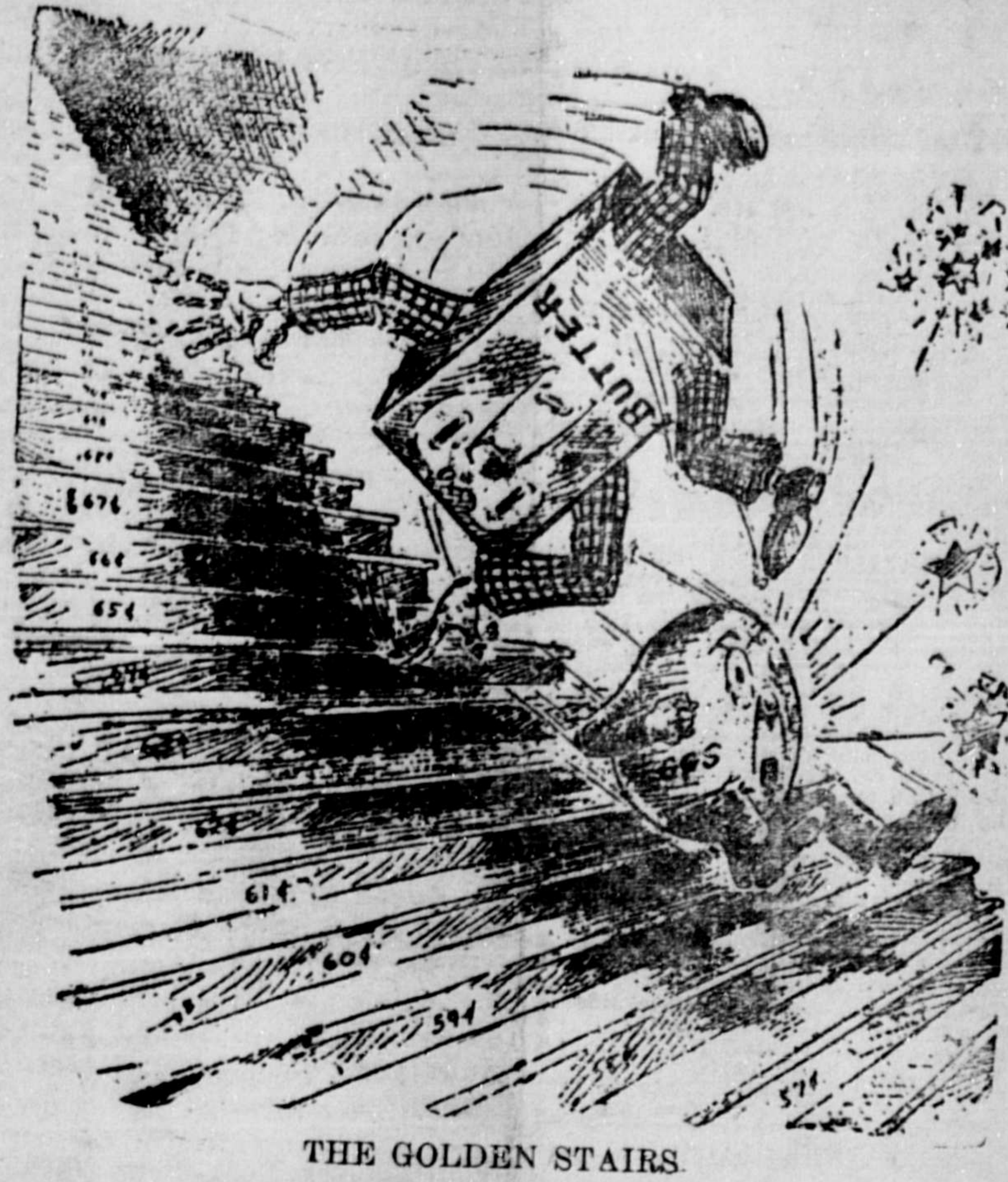
THE GOLDEN STAIRS.

Gray's Orchestra will give a dance in the St. Andrew's Hall, Monday, March 24. Ladies free, Gentlemen $1.00.