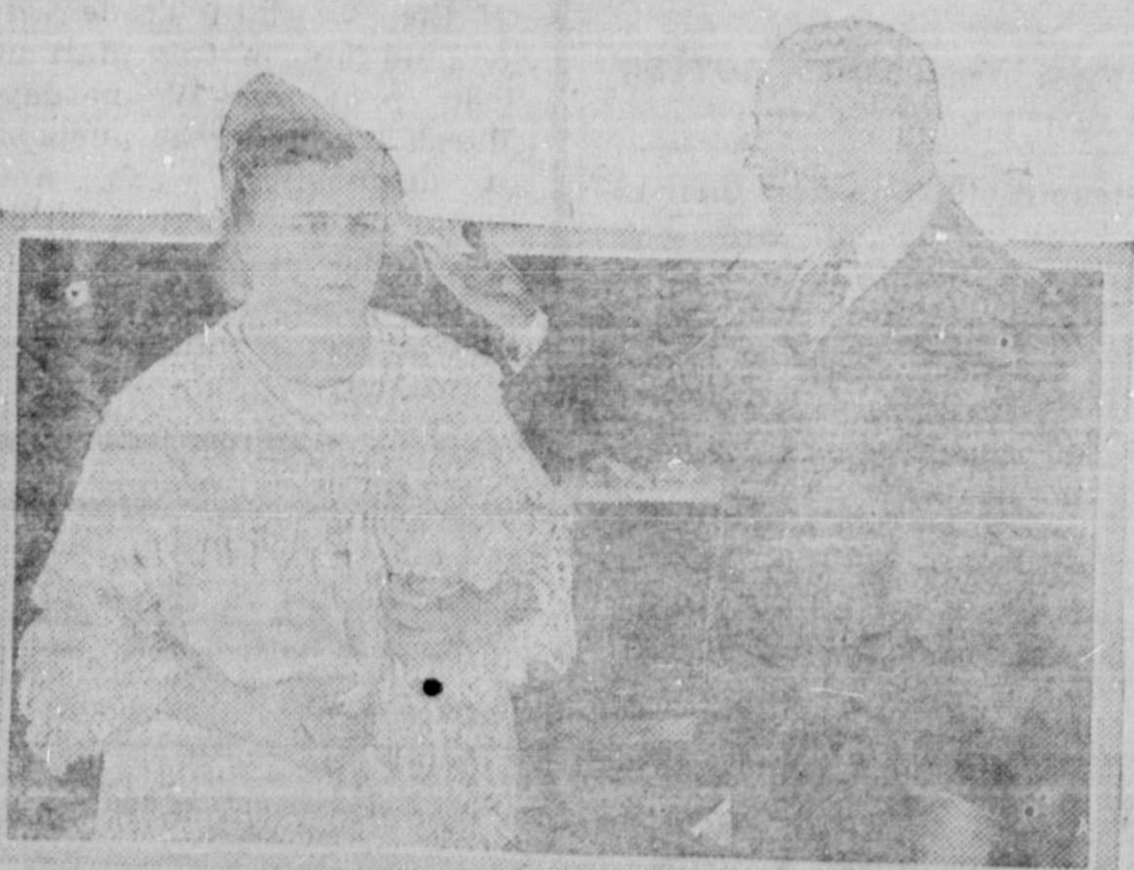
CECIL B. DEMILLE'S "Old Wives For New"

This suggests to Prince Rupert people that the northern British Columbia canners might take a hint from the Alaska canners. This should be the centre of supply both for labor and goods to the canneries of the Skeena and the Naas, as well as the Queen Charlottes and if sufficient pressure is brought to bear it will be found that we shall get the business. We must keep after it if we are to succeed.