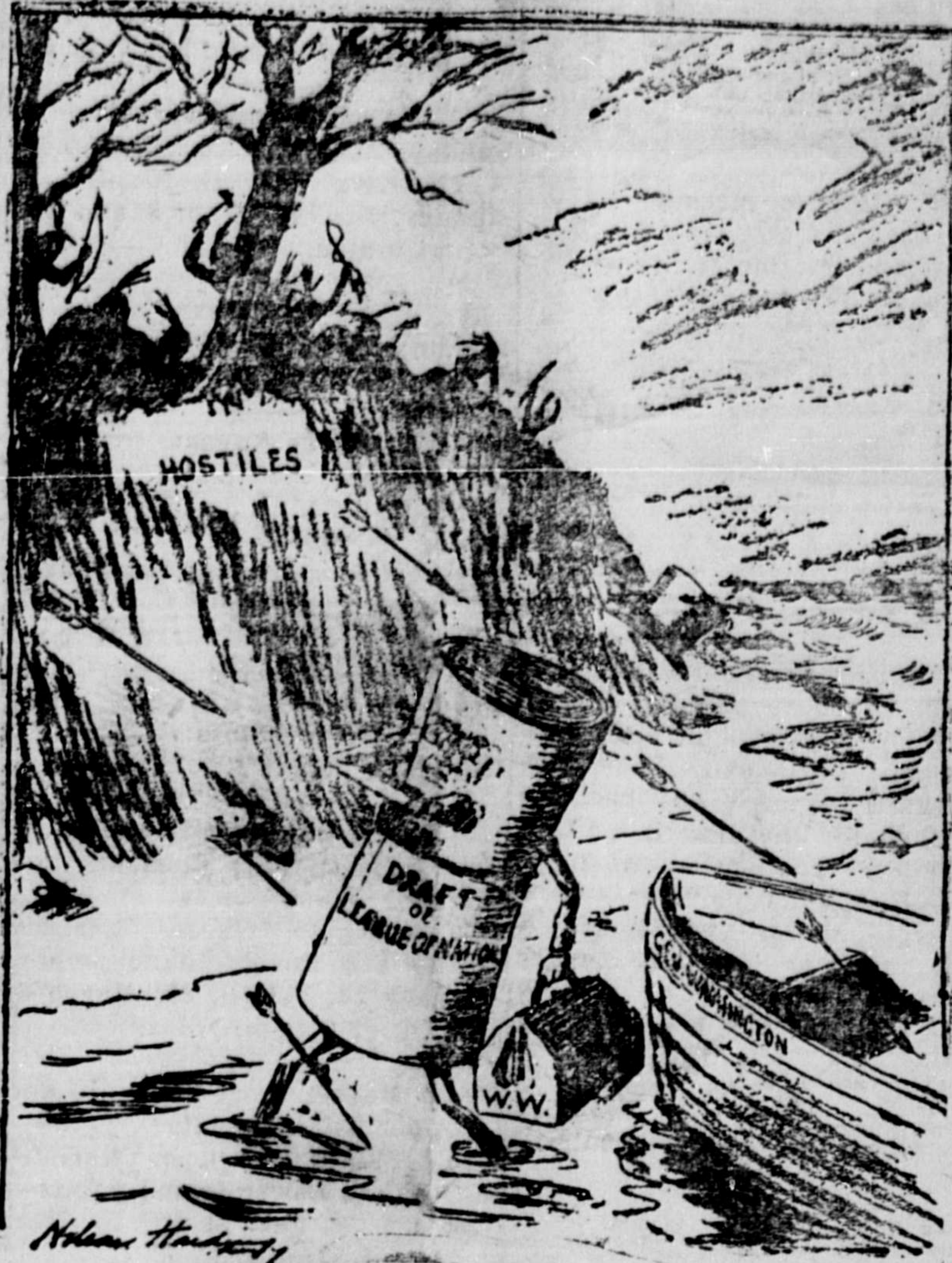
PILGRIM LANDING IN AMERICA, 1910.