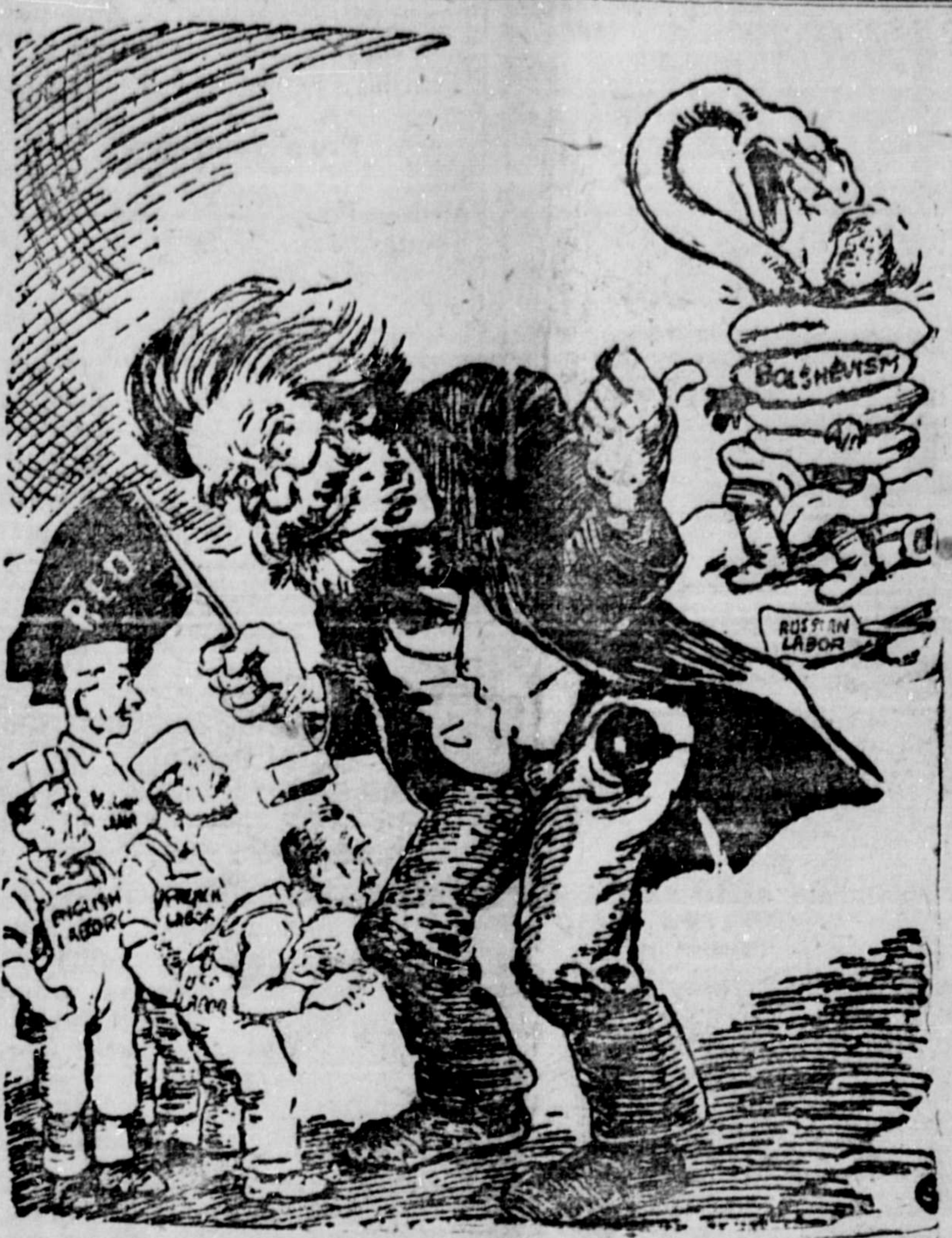
LET BOLSHEVISM EMBRACE YOU AND YOU WILL SOON BE AS HAPPY AS YOUR RUSSIAN BROTHER.

The halibut boat Chief Skugaid owned by the Canadian Fish and Cold Storage Co. is expected to get away for the halibut banks tonight. The Kelly, the first of the trawlers to go out since the tie-up, should be ready by Friday and the other trawler next week.