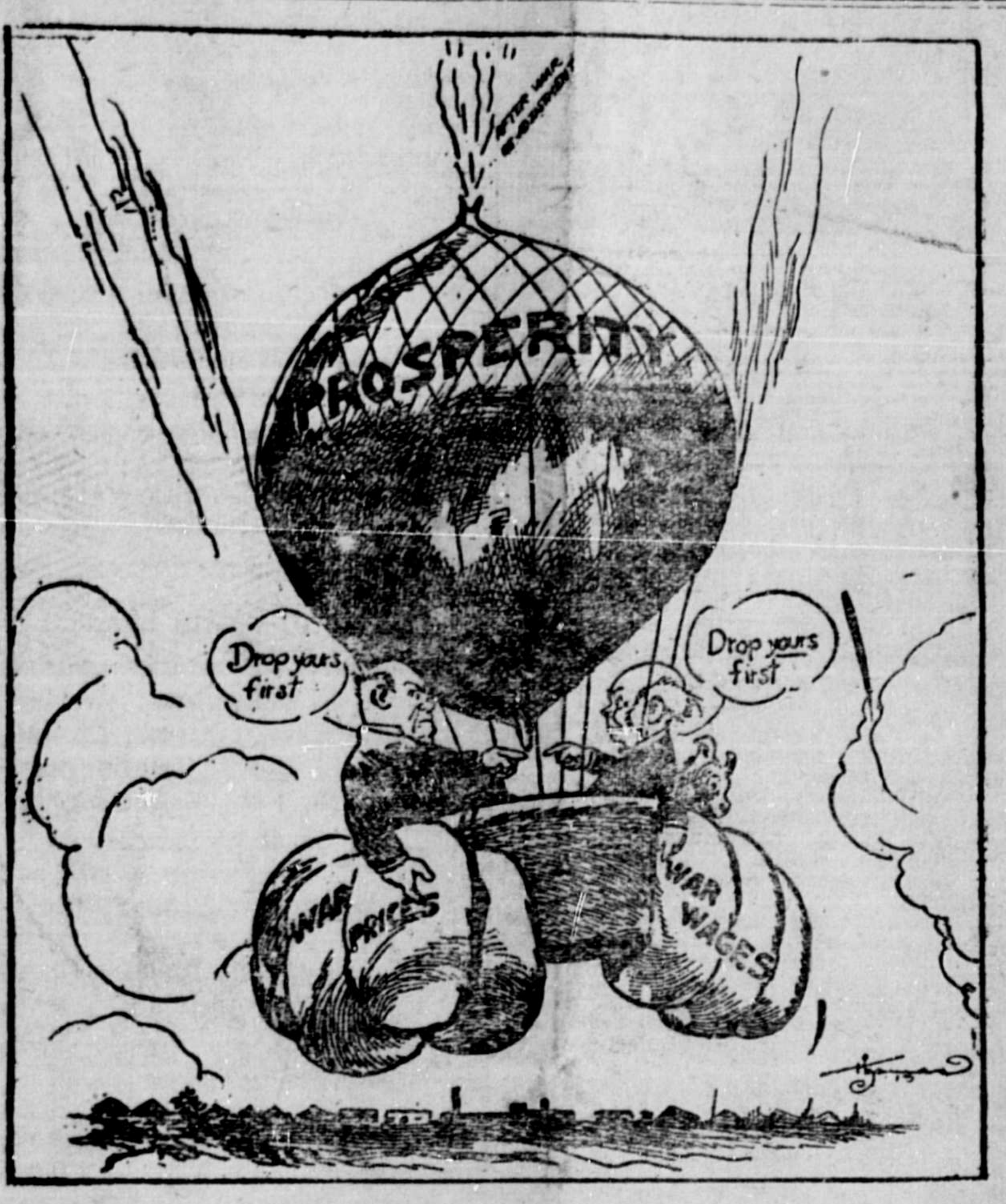
TOO MUCH BALLAST.