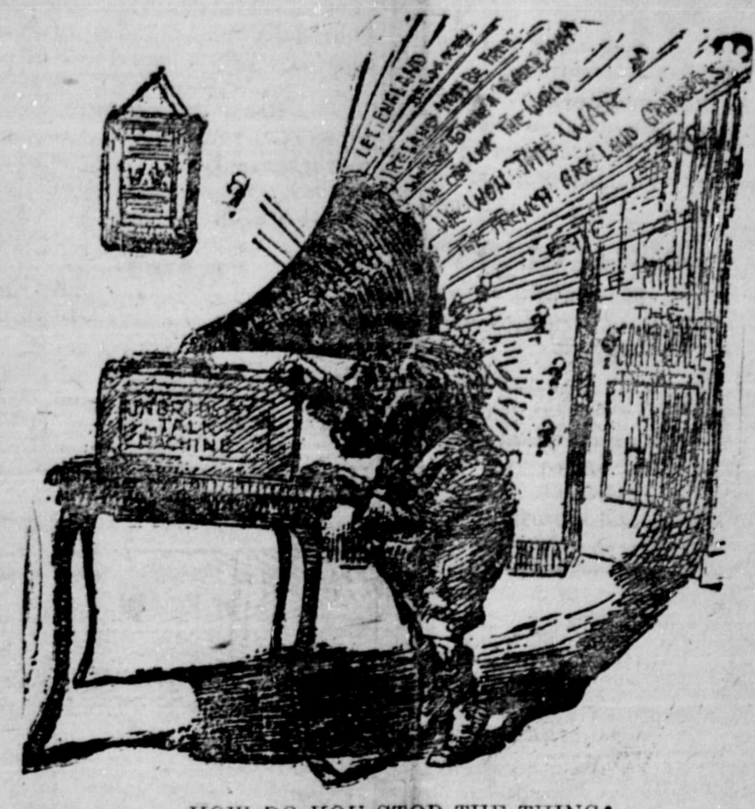
HOW DO YOU STOP THE THING!