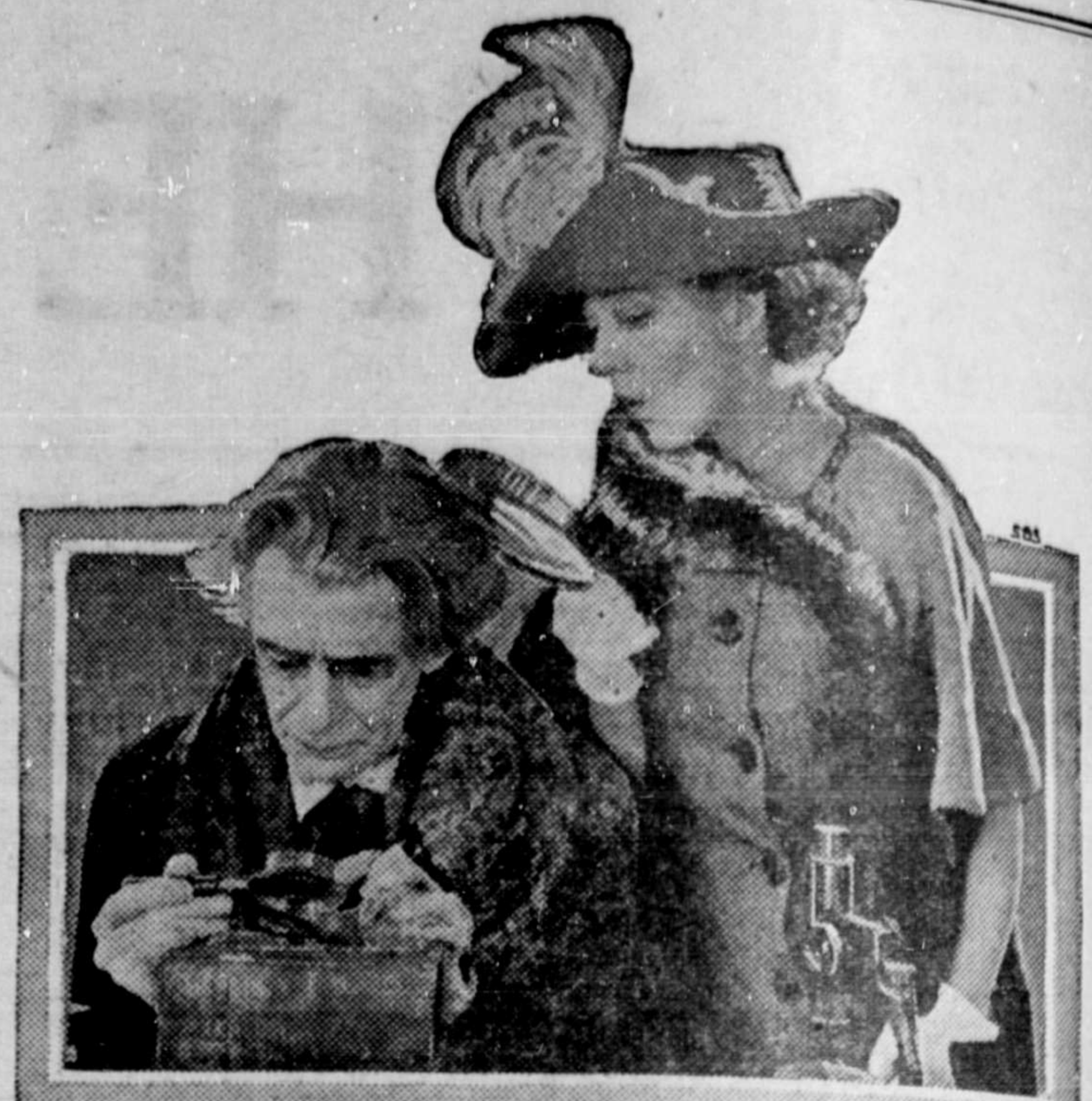
MARY PICKFORD in "How Could You, Jean?"