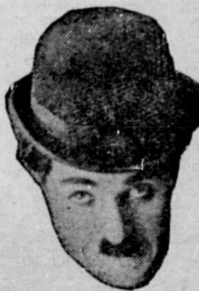
Showing to-night at the Westholme Theatre.

Intricate stage settings for the production of the new picture "The Kaiser's Shadow," starring Dorothy Dalton, are a feature of the film which is being offered at the Westholme Theatre tonight. Trap doors, sliding panels, all the elaborate mechanism that goes with a mystery story, are utilized effectively. It is one of the best Paramount pictures in which Miss Dalton has appeared so far and deserves the widespread interest shown by the photoplay public in the production.