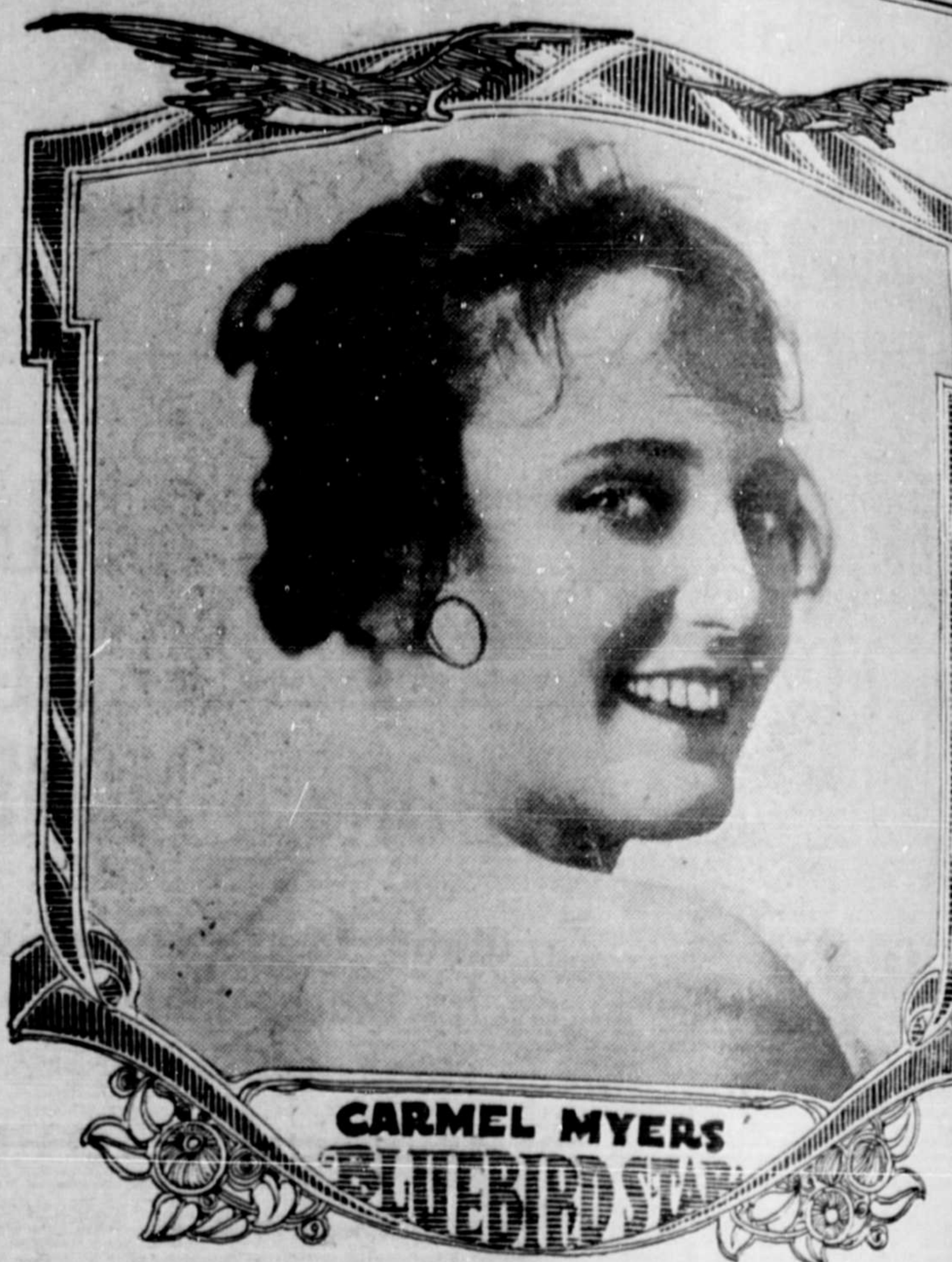
CARMEL MYERS BLUEBIRD STAR At the Empress Theatre tonight

G. R. NADEN, Deputy Minister of Lands. Lands Department, Victoria, B. C., 6th March, 1919. M 13