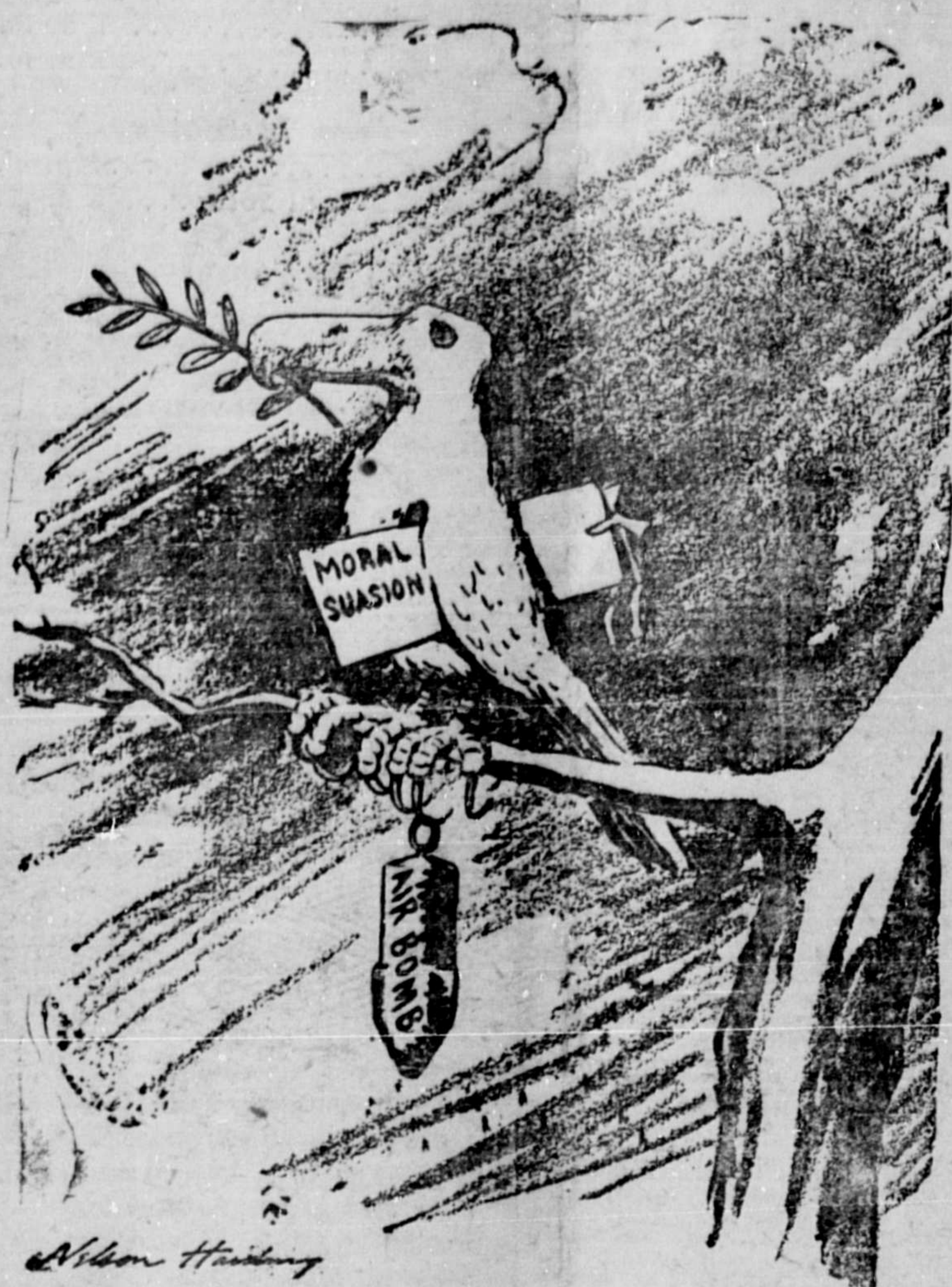
A DOVE OF PEACE TO SUIT EVERYBODY.

G. W. V. A. Election of Officers Wednesday, 8:30 p. m.