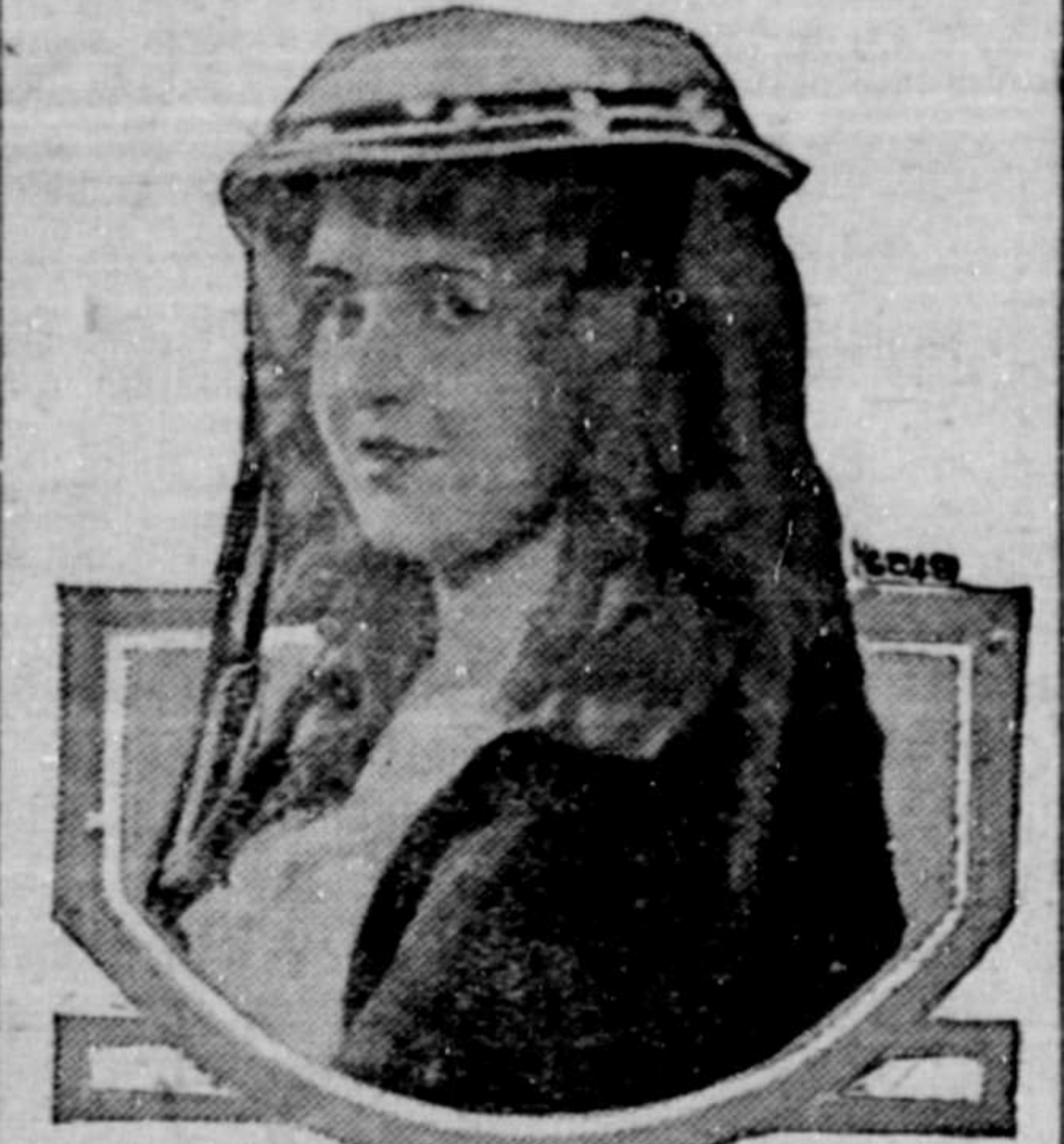
MARGUERITE CLARK in "Uncle Tom's Cabin" A Paramount Picture

"Uncle Tom's Cabin" is sure to draw crowded houses at the Westholme Theatre this evening. Even although the slave days in the southern states are long passed,