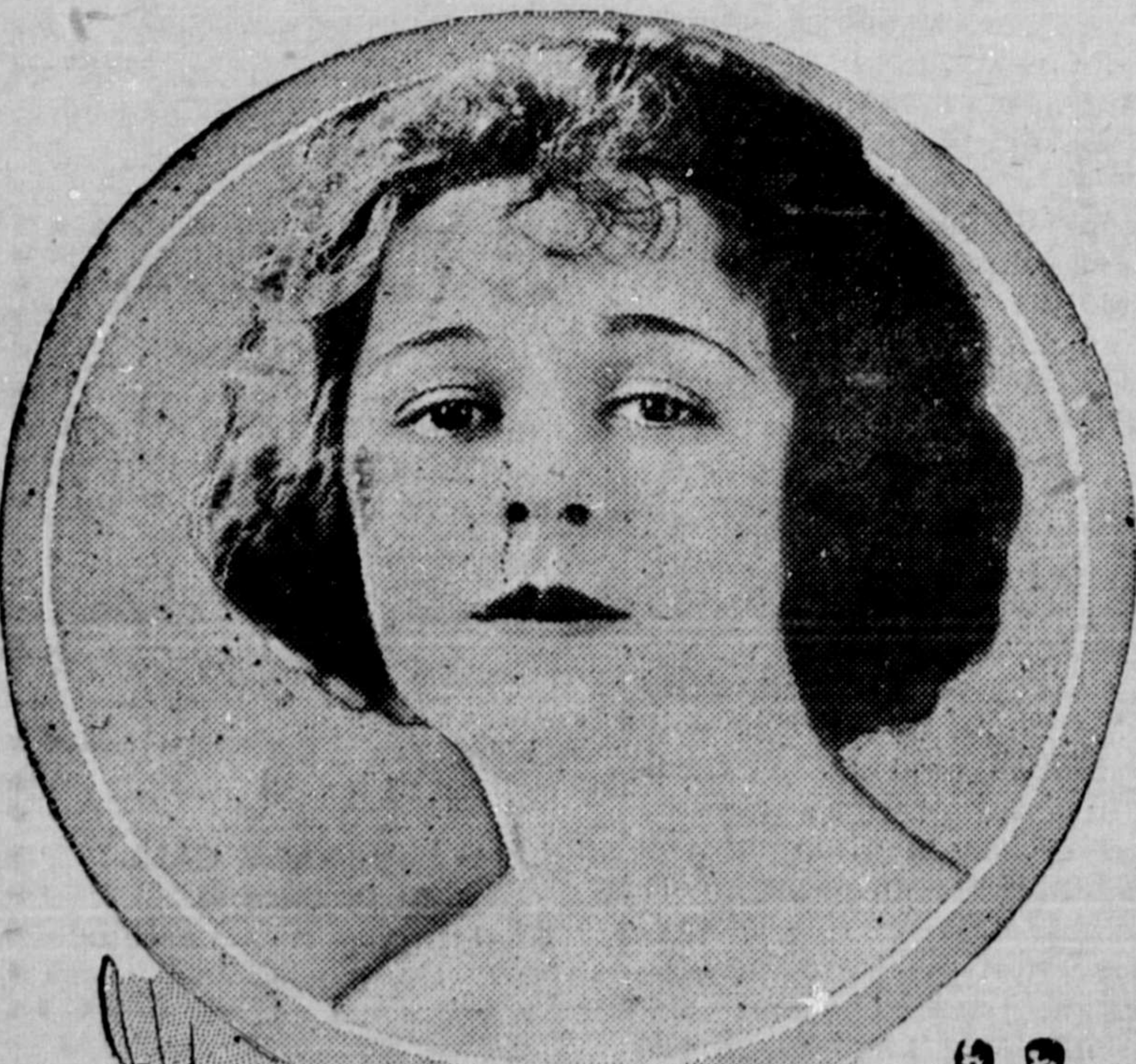
Anita Stewart "Virtuous Wives"

Adapted from the 2,000,000 edition novel by Owen Johnson, this great production, which is now running at the Rex Theatre in Vancouver nightly with standing room only, will be screened at the Westholme Theatre on Wednesday, May 7, matinee and evening only. No advance in prices.