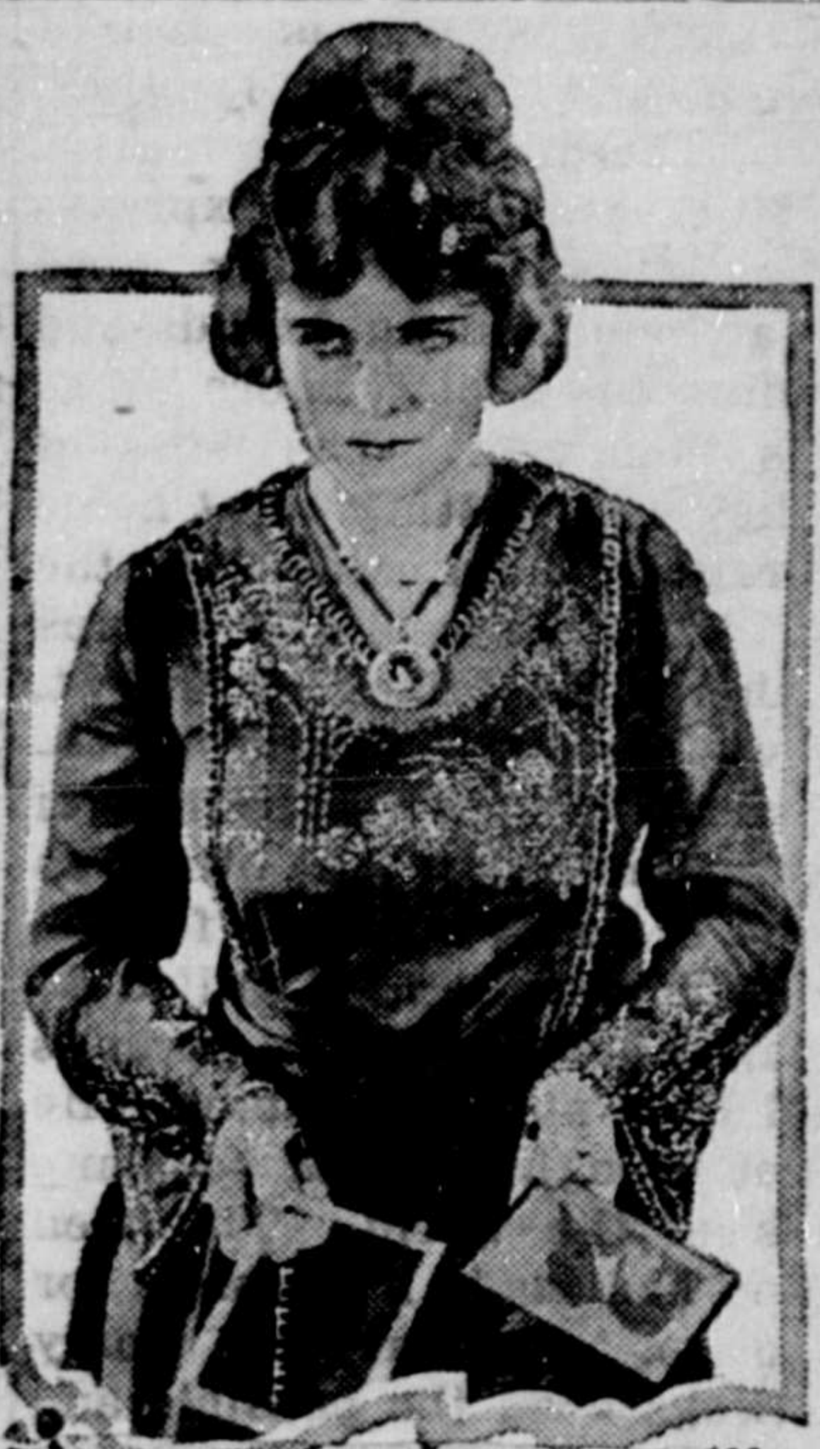
CECIL B. DeMILLE'S "We Can't Have Everything"