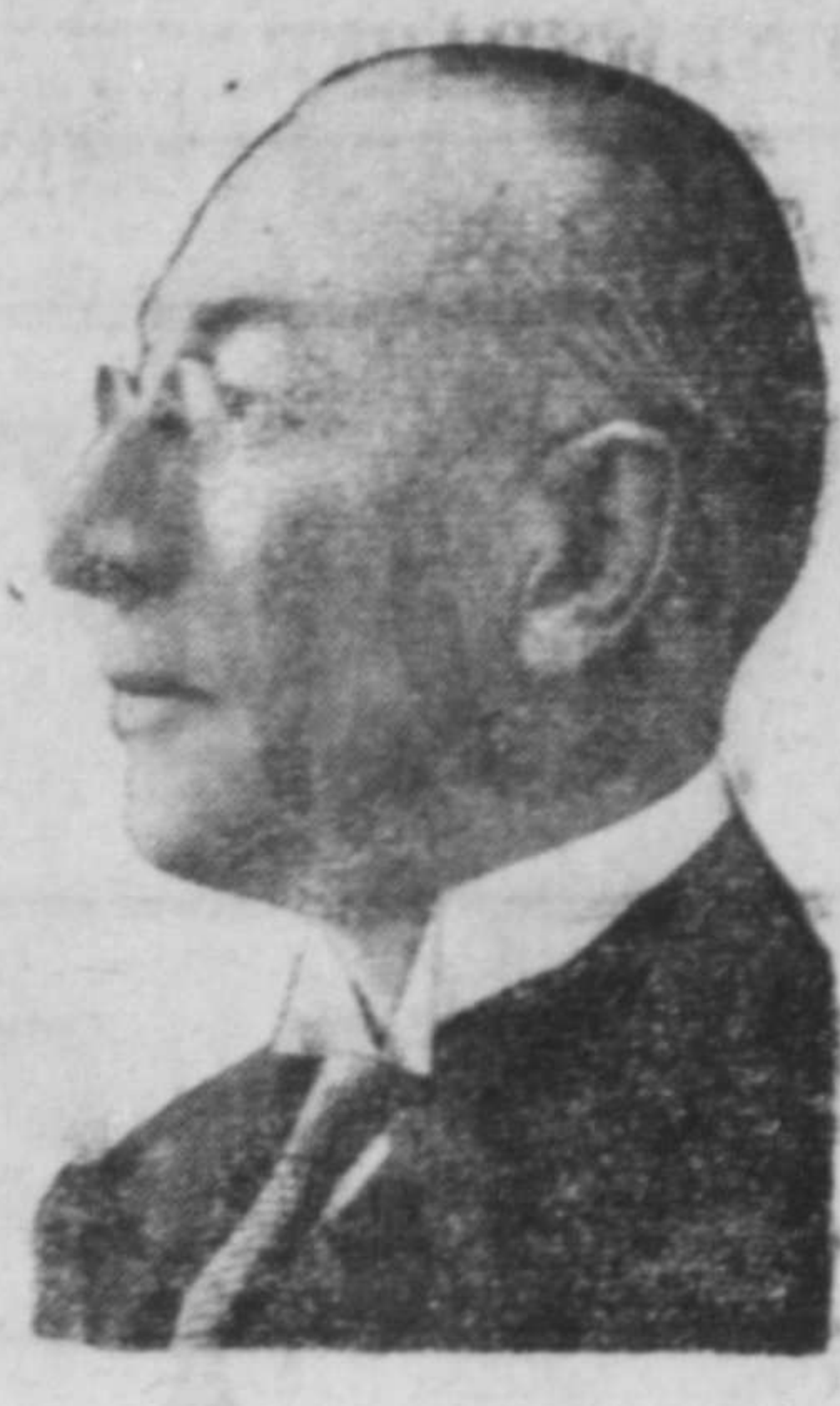
Edgar Nelson Rhodes, Minister of Finance