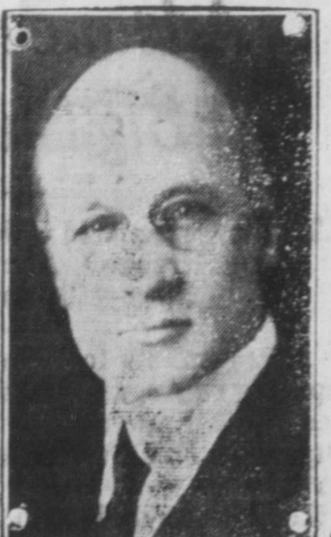
H. H. Stevens, Minister of Trade and Commerce