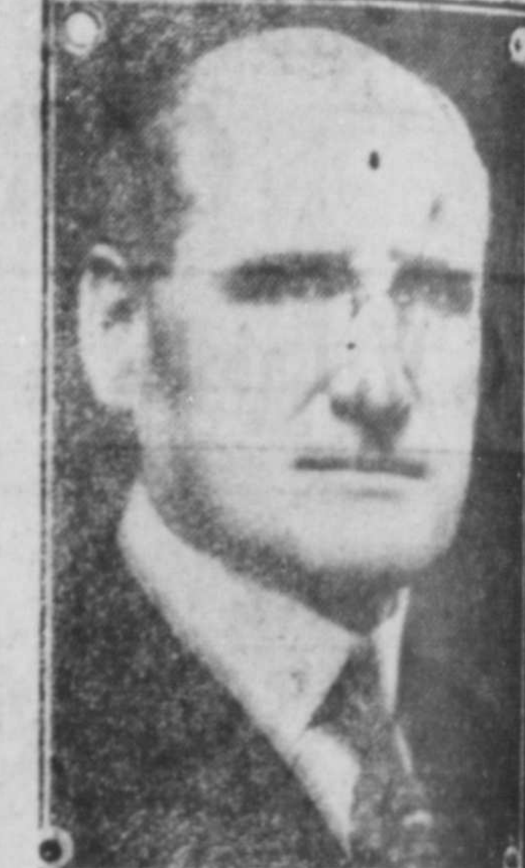
Edmond Baird Ryckman, Minister of National Defence