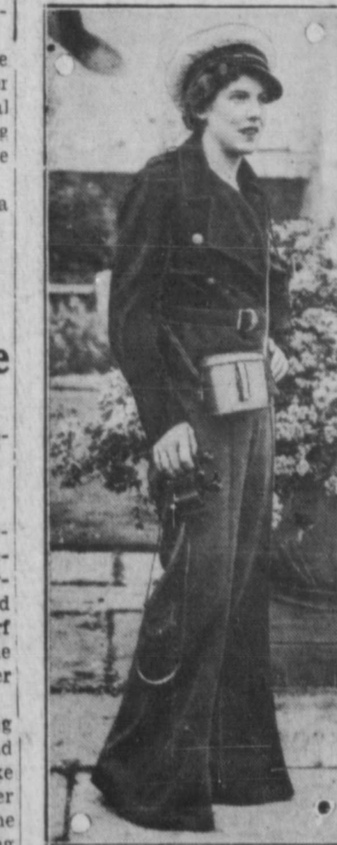
Something new for yachtswoman. dark blue belted reefer jacket and bell-bottomed stockinette trousers. The ensemble was seen at Cowes.

BERLIN, Aug. 10.—President Paul von Hindenburg signed an emergency decree yesterday providing the imposition of the death penalty upon persons found guilty of acts of political terrorism. The decree follows recent events in Germany of political violence.