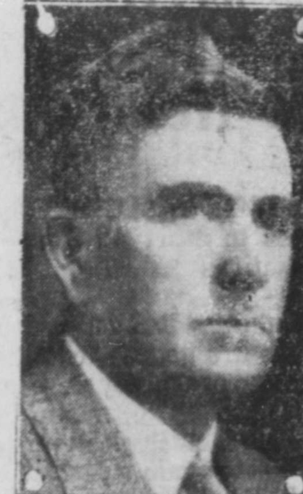
Robert Weir, Minister of Agriculture