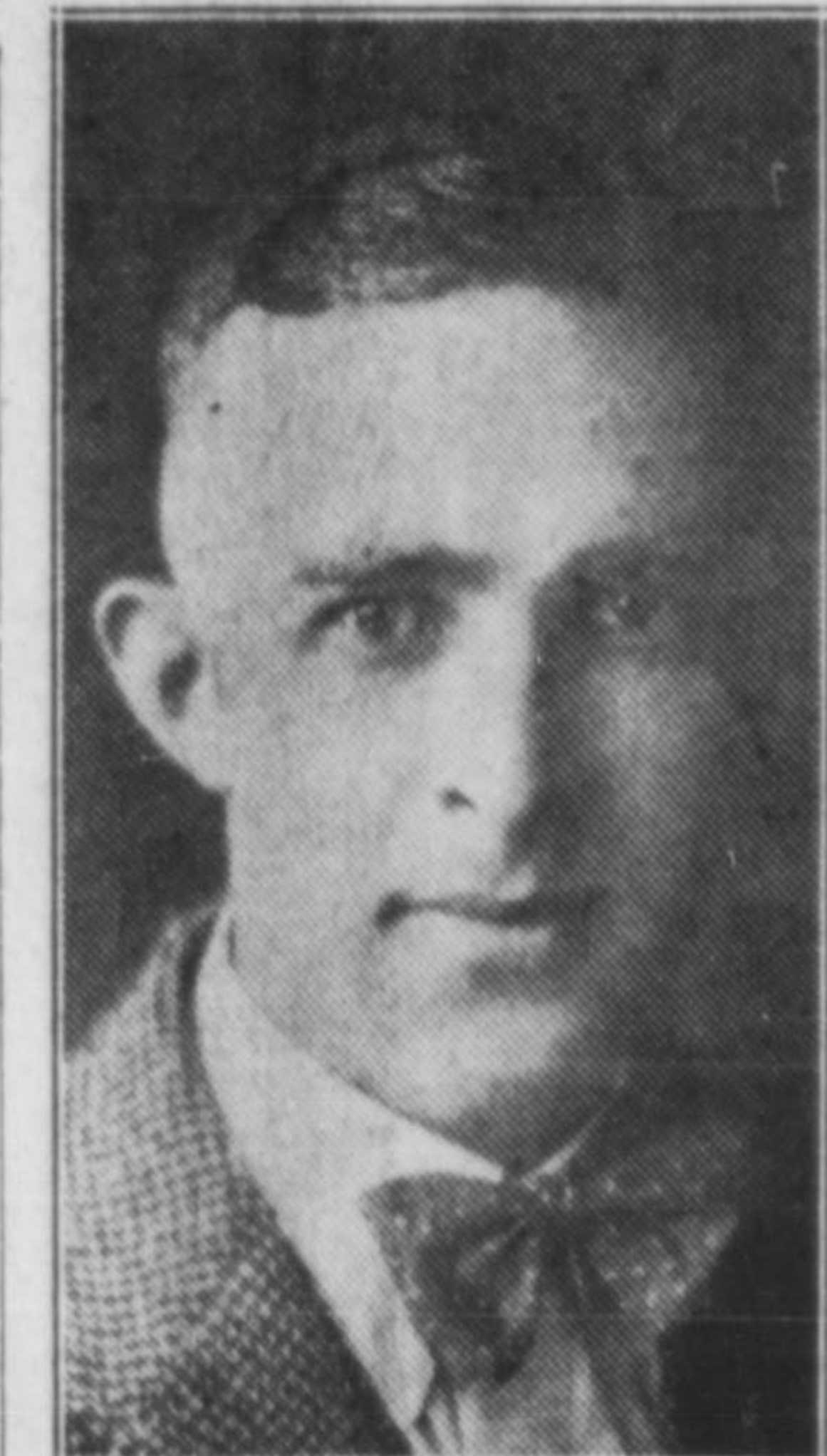
Transferred to Vancouver in W. H. Malkin Co. Ltd. service.