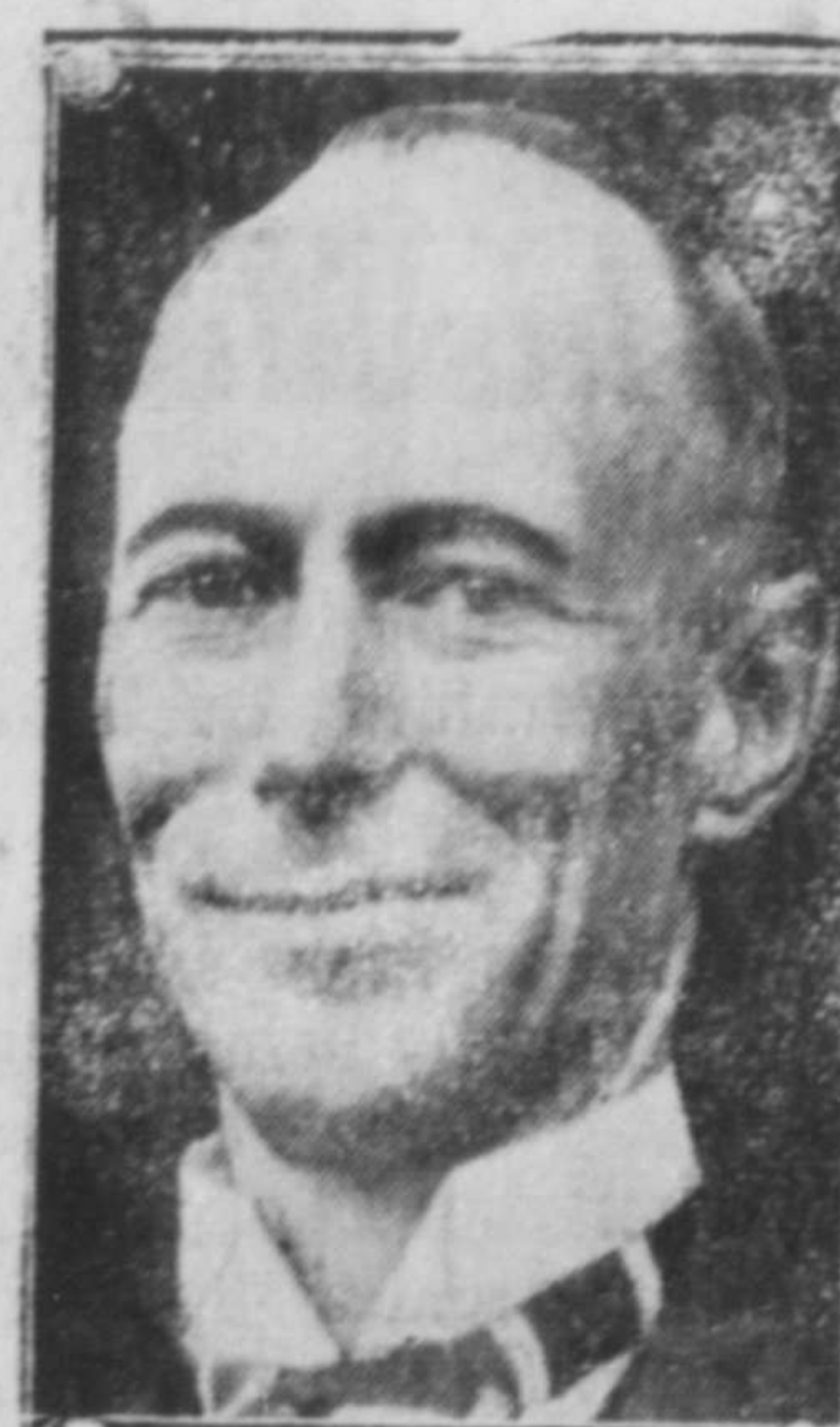
T. G. Murphy, Minister of the Interior