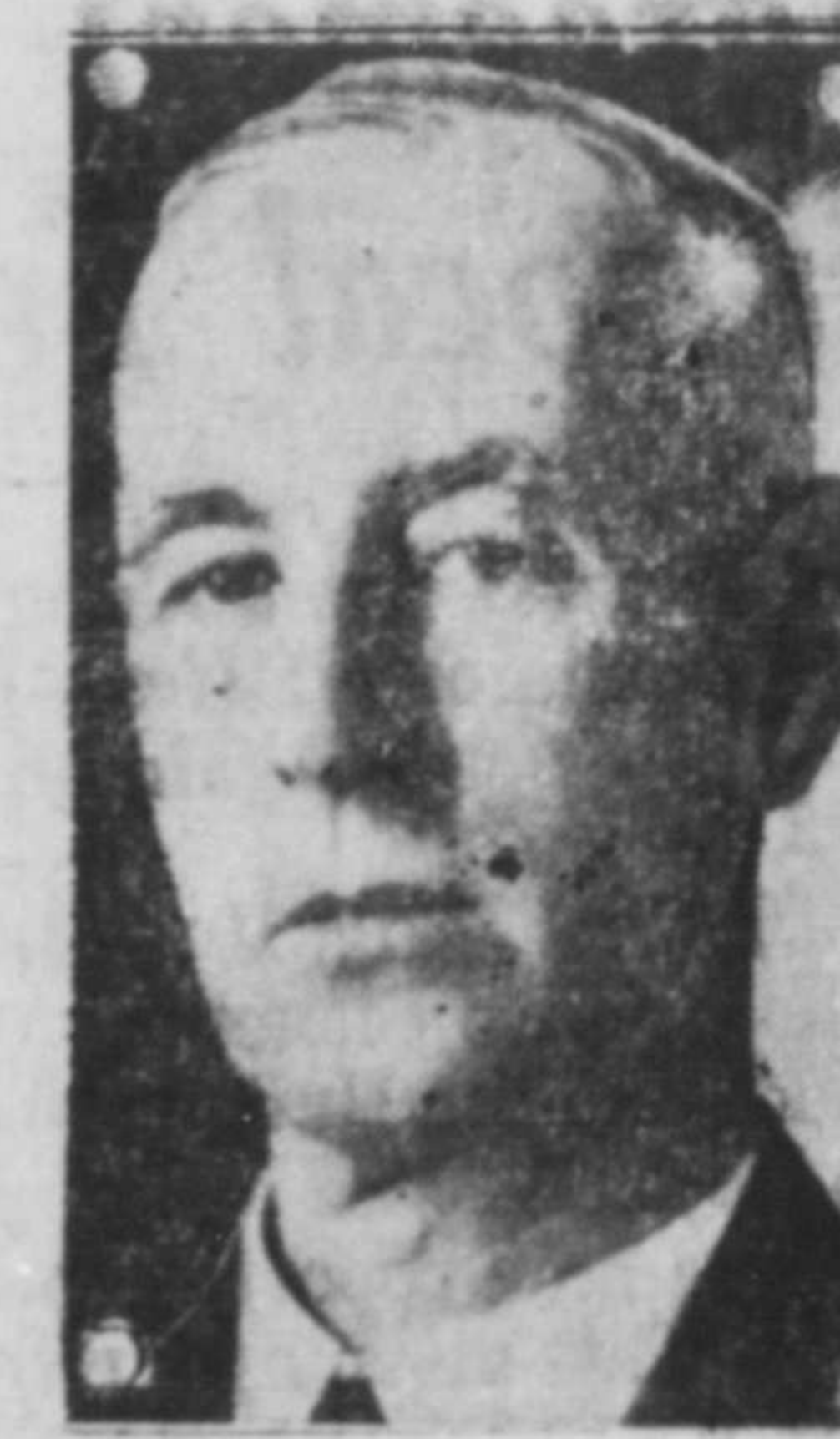
John A. Macdonald, Minister without Portfolio