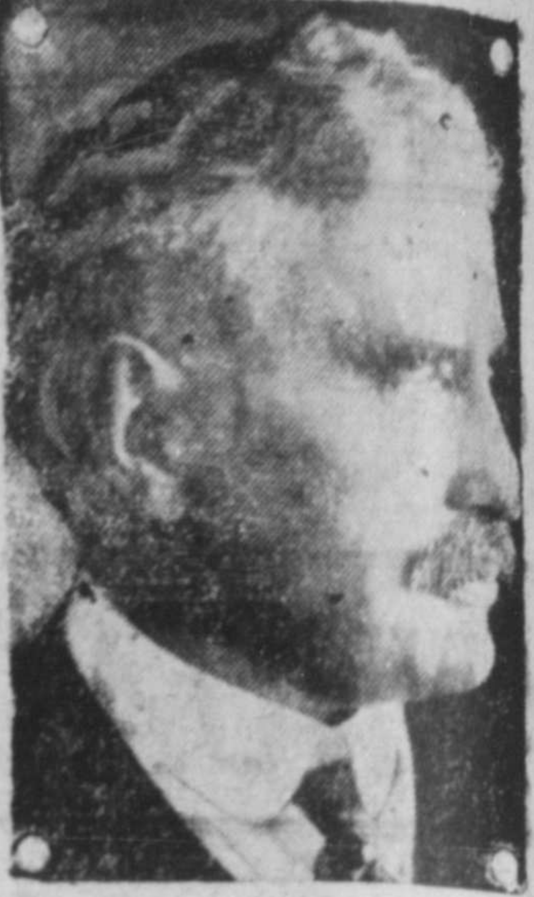
Sir Robert Borden