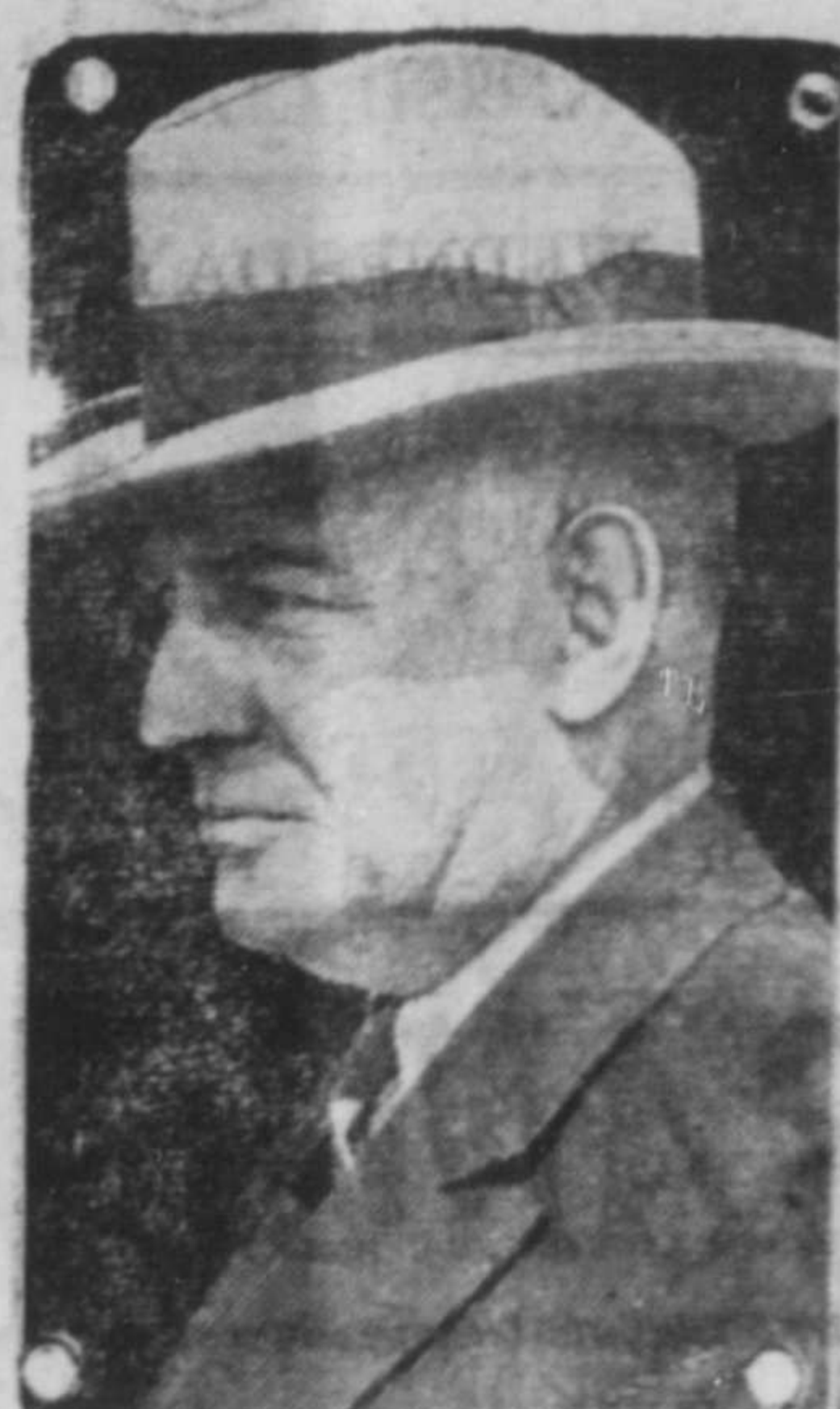
Lieut.-Col. D. M. Sutherland, Minister of National Defence