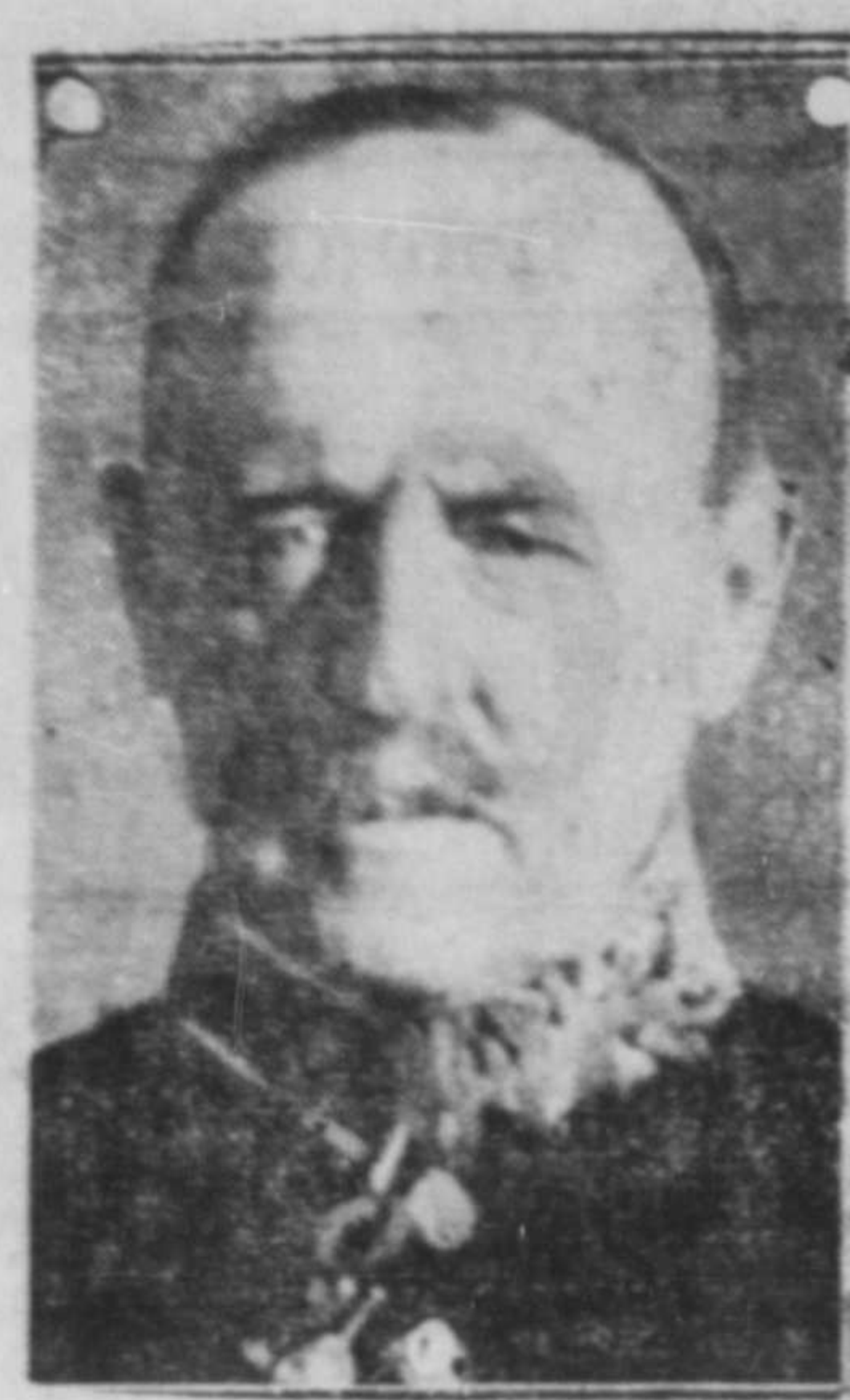
Chief Justice Rt. Hon. Francis Alexander Anglin, P.C.