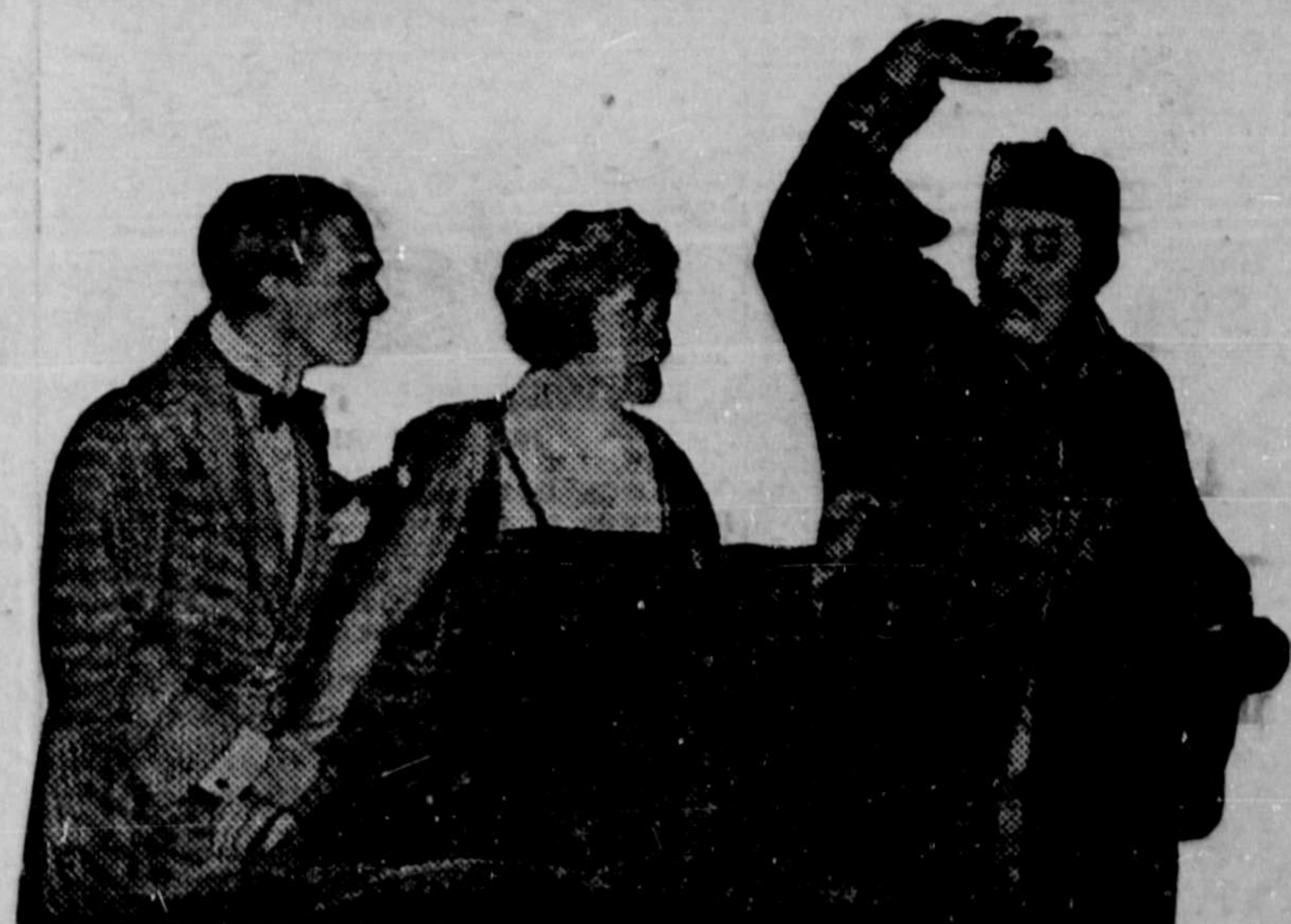
PEARL WHITE in "THE LIGHTNING RAIDER," greatest serial ever filmed, starting Monday, 19th April, at the Westholme Theatre