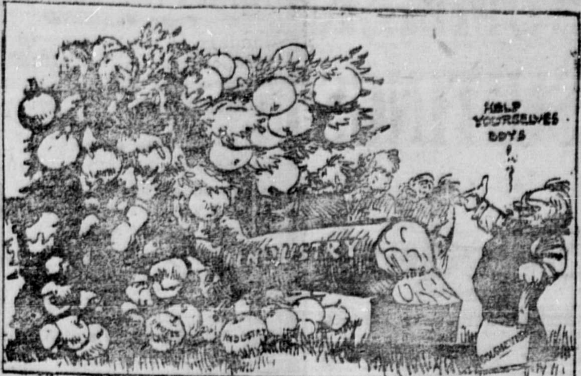
IT MAKES IT EASY PICKING FOR A WHILE.