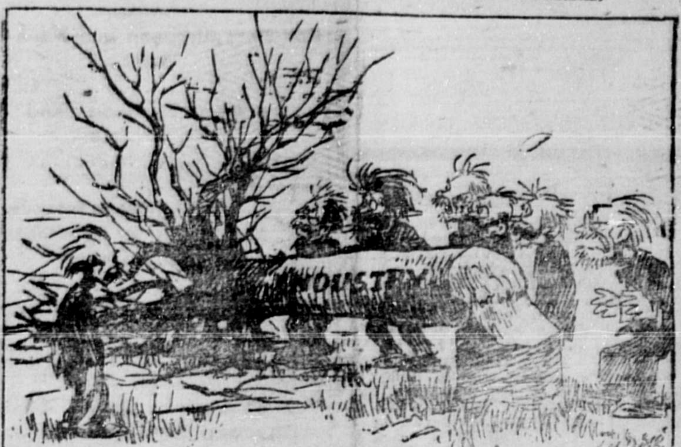
BUT WHAT WILL THEY DO NEXT SEASON?