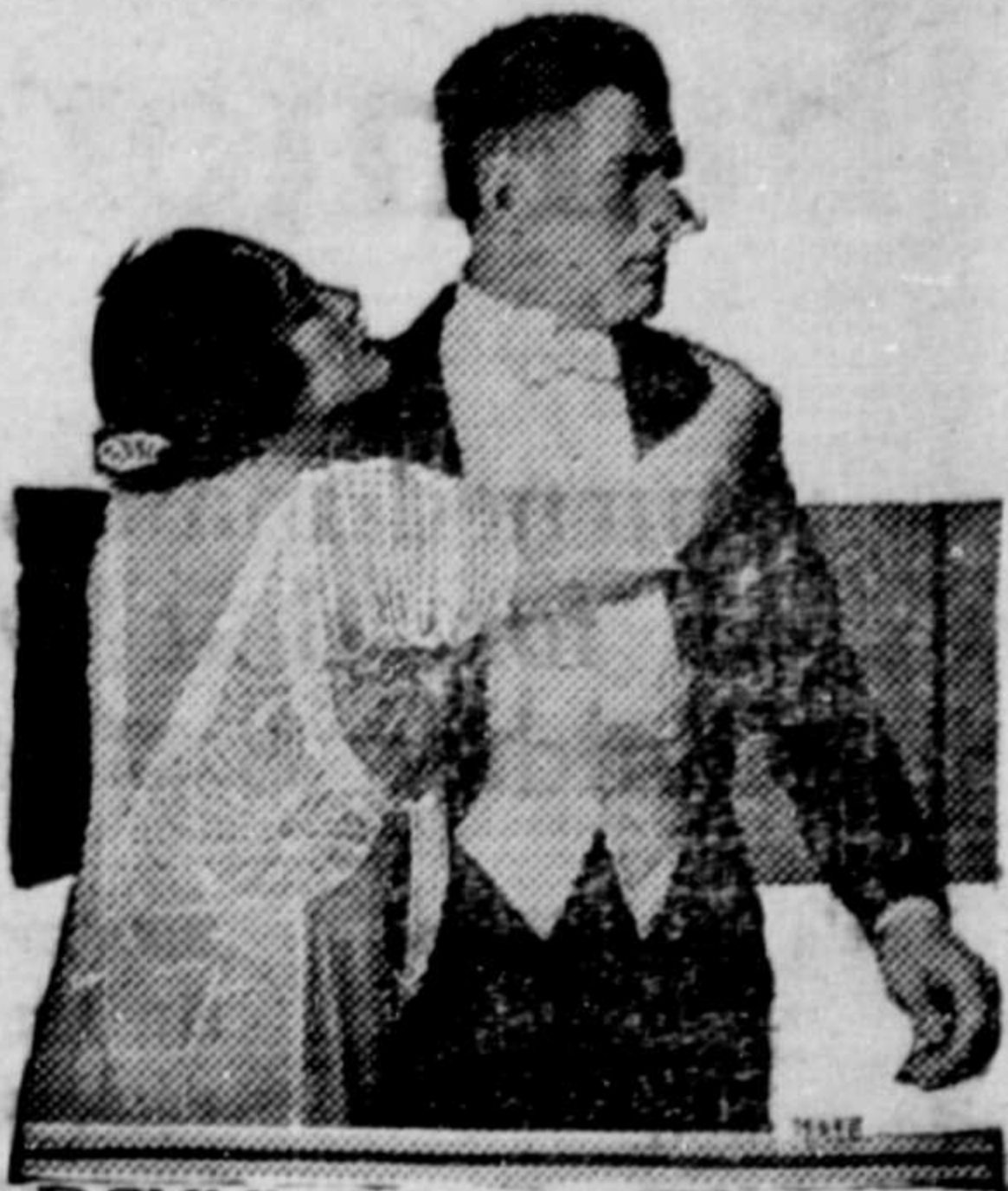
PAULINE FREDERICK in "Fedora" A Paramount Picture

The famous death scene in "Fedora," when, to save her husband from the disgrace of murdering the woman he loves, Fedora, his wife, takes poison and dies a suicide, is perhaps one of the most dramatic scenes of the new Paramount photoplay starring Pauline Frederick, which