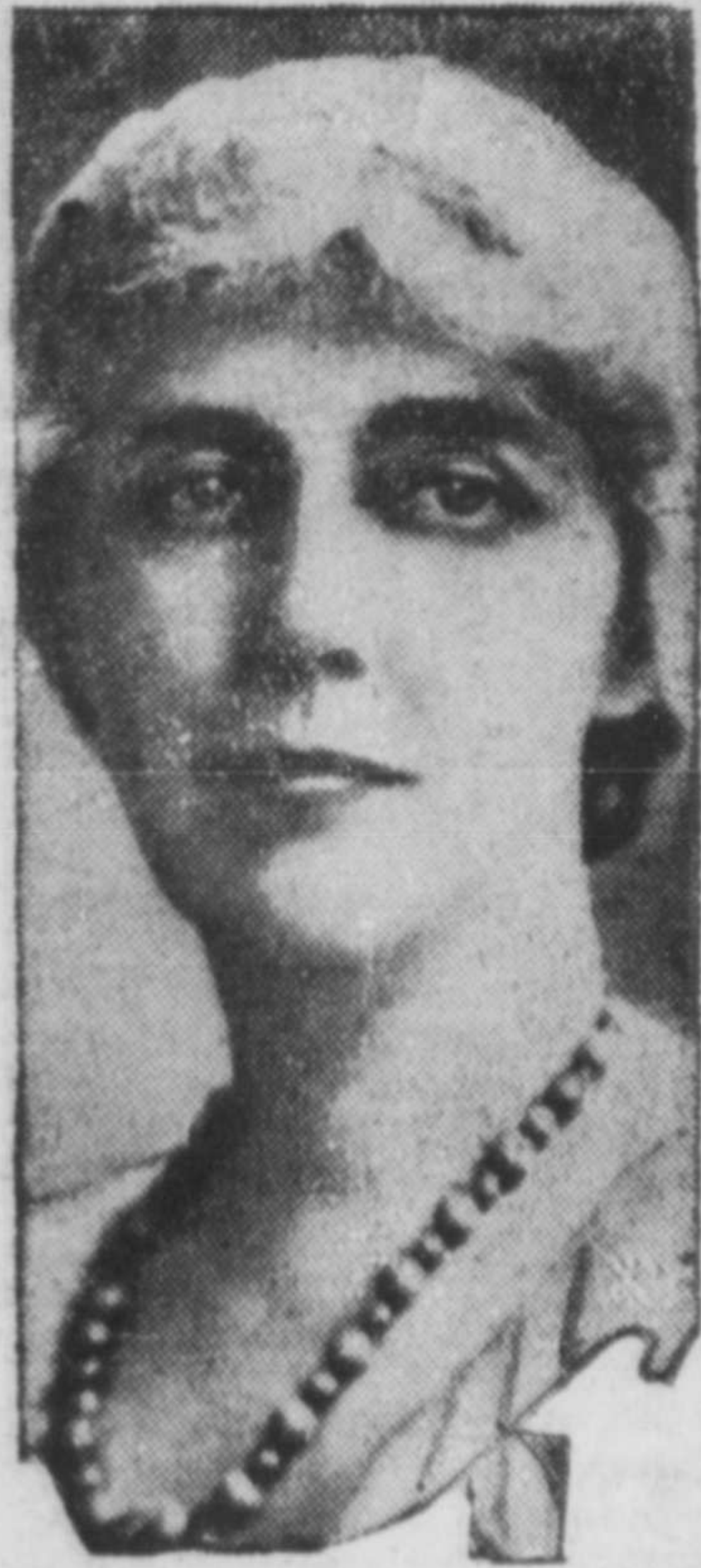
Who received with United States President at reception on White House grounds today.