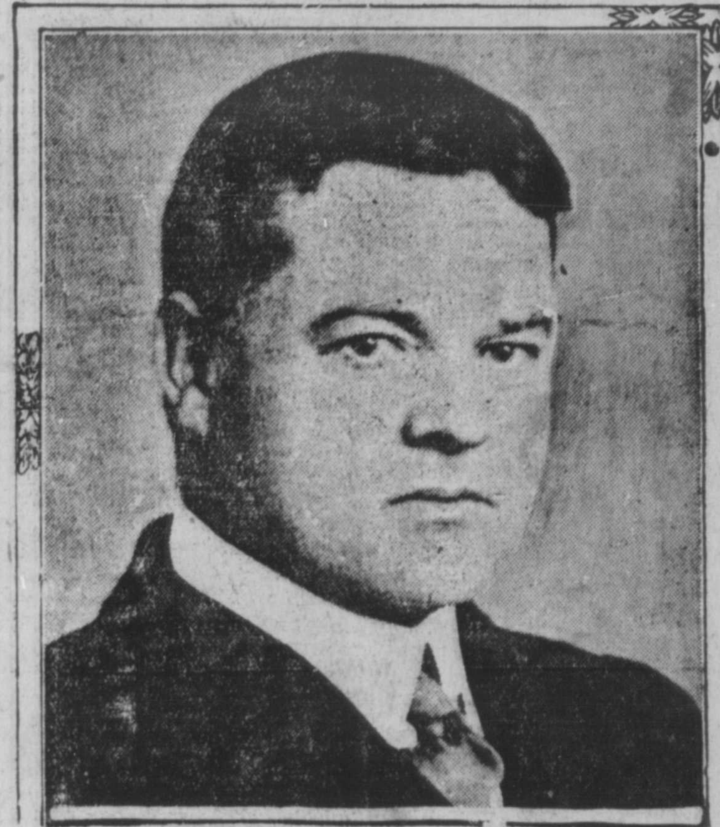
Celebrated fifty-eighth birthday yesterday and delivered speech of acceptance today.