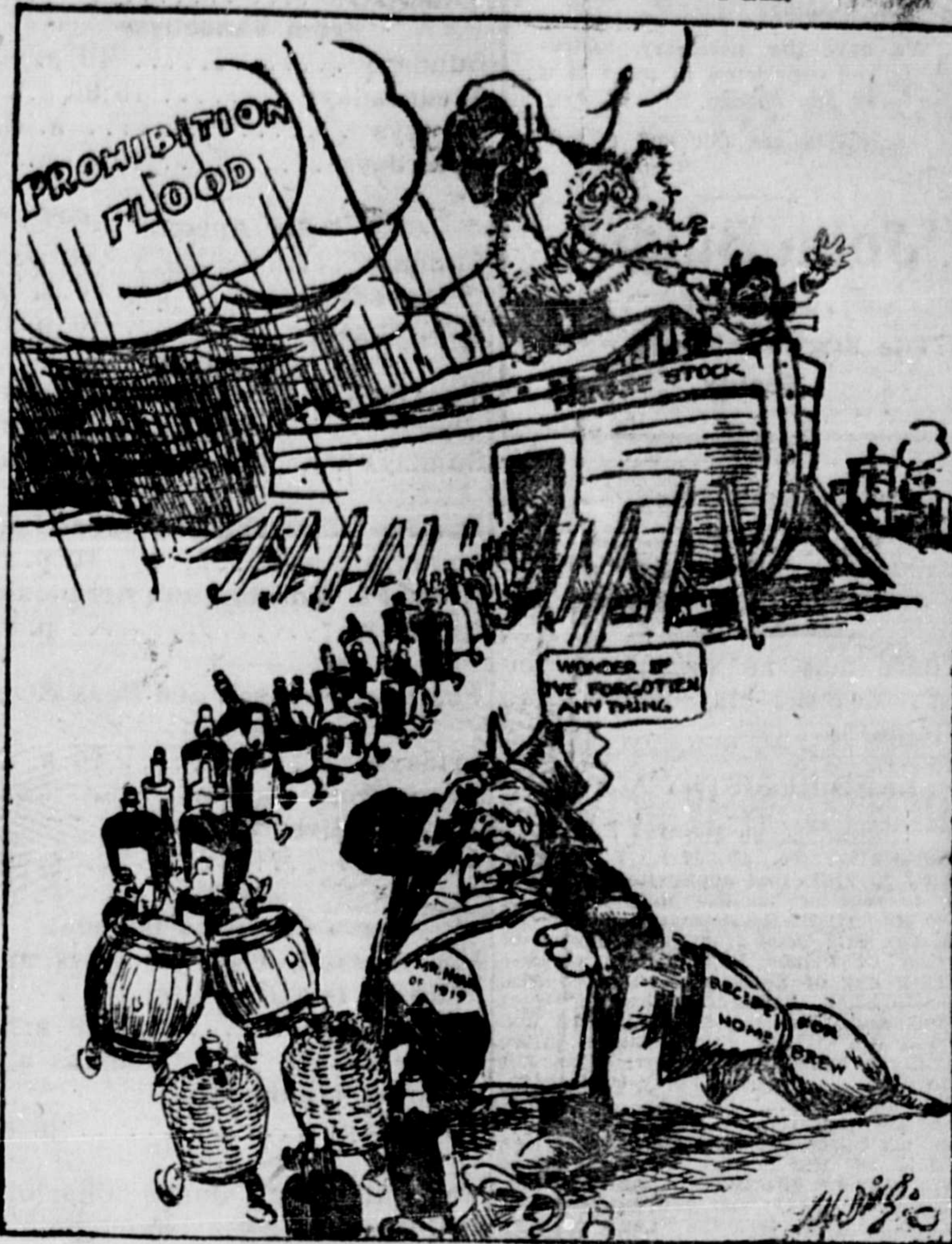
PROHIBITION VERY SOON IN UNITED STATES