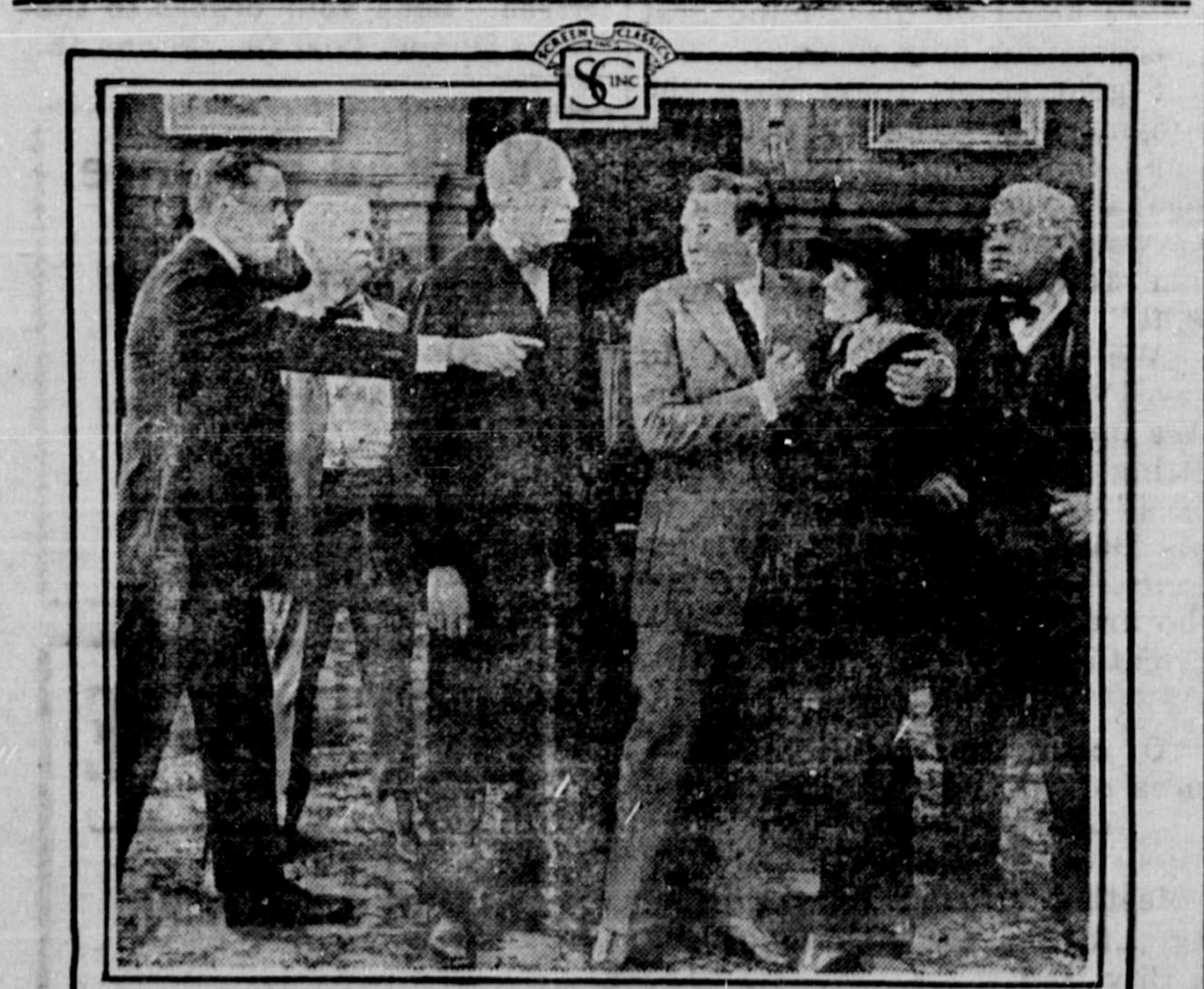
HAROLD LOCKWOOD in "PALS FIRST" Starring tonight at the Westholme Theatre.