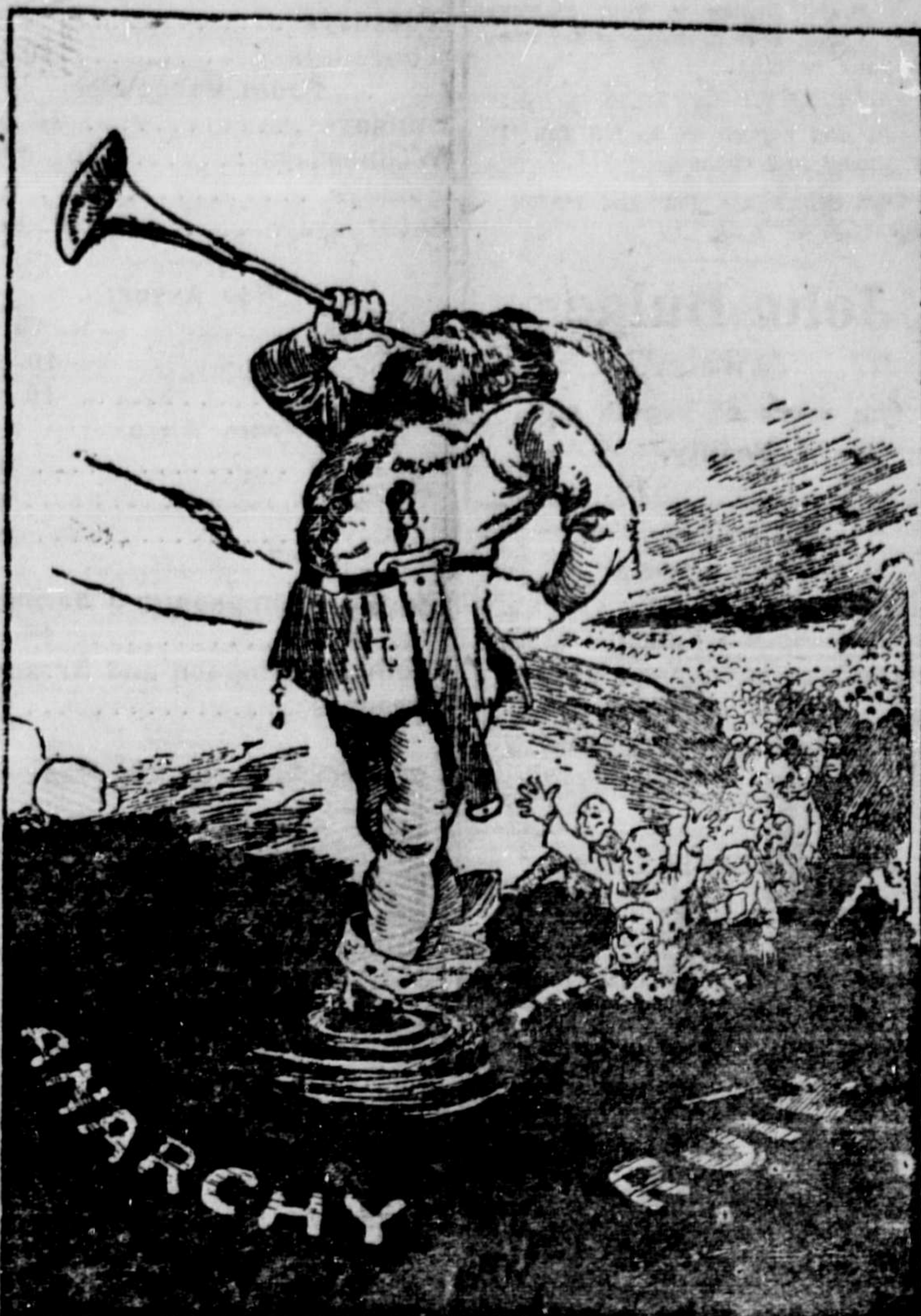
THE FIED PIFER.