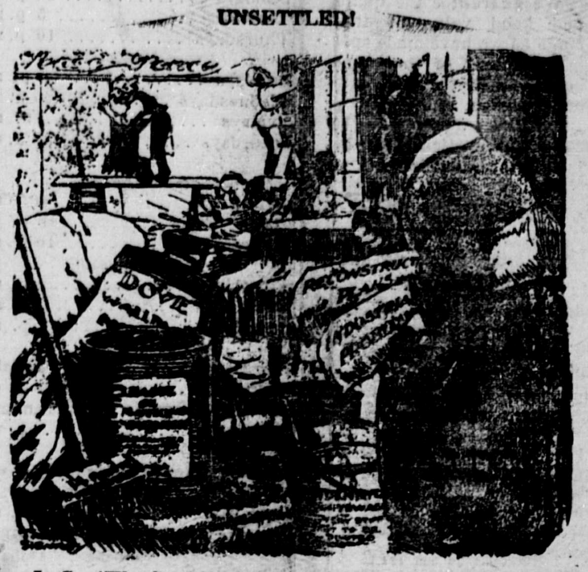
L. G.: "We shan't be long now, John" J. B.: "I hope you won't. I can't settle down to my work until this mess is cleaned up!"