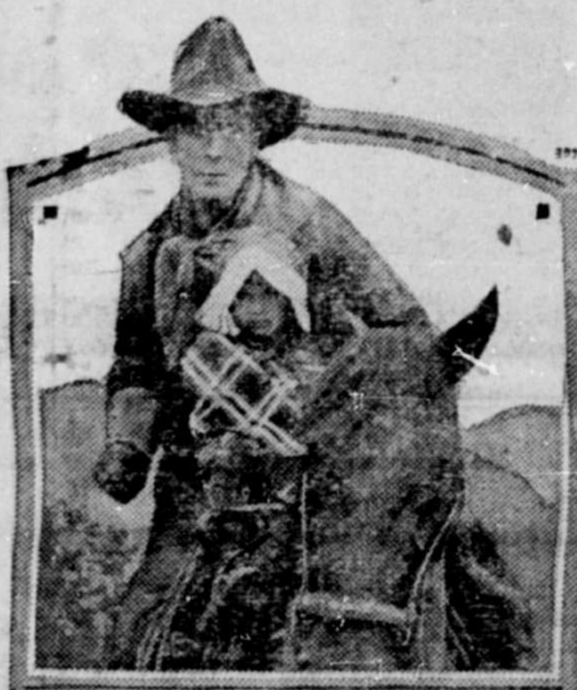
WILLIAM S. HART "The Riddle Gawne" An Autocrat Drama

Never forget to look through the classified list on Page 5.