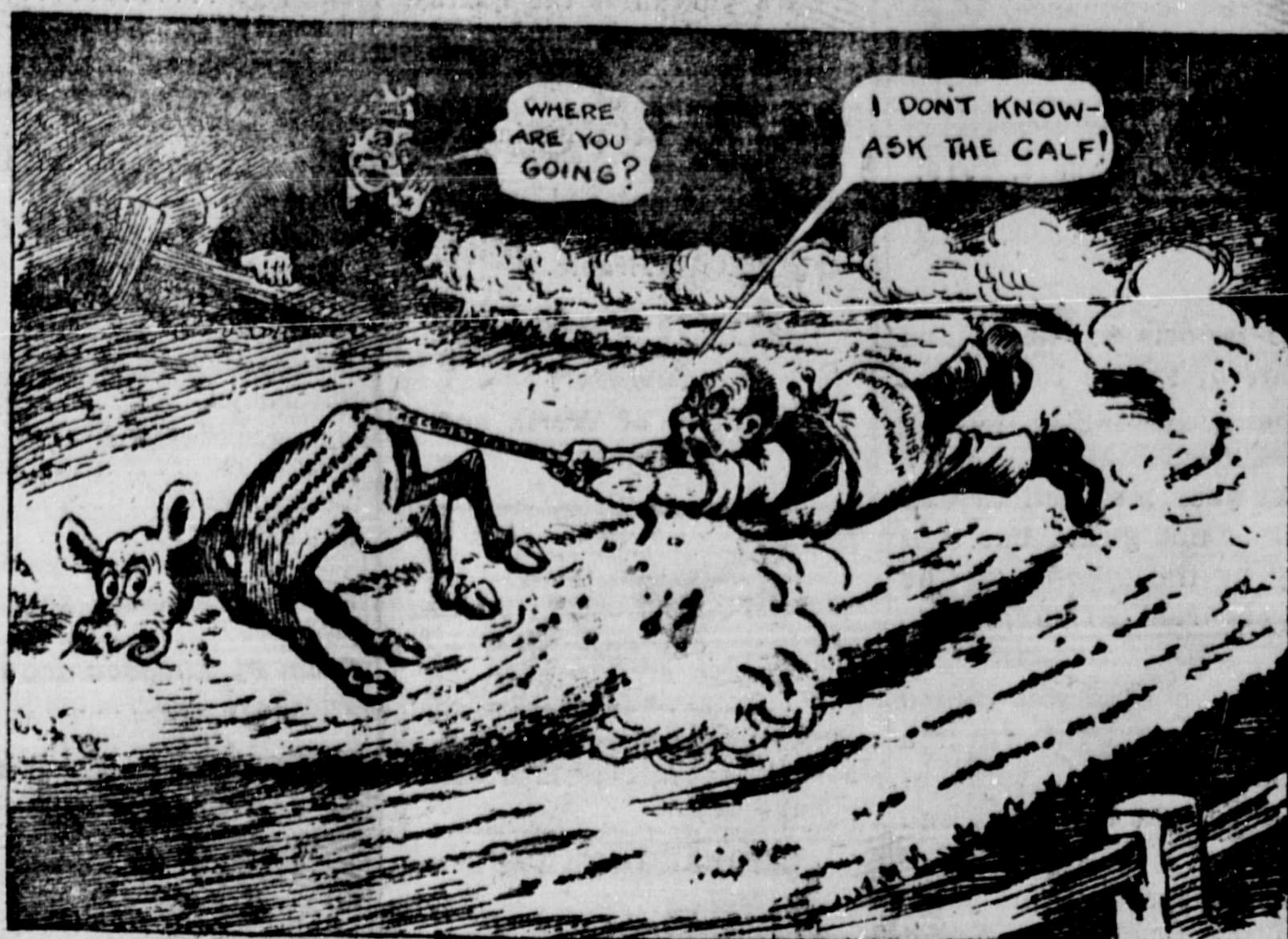
THE WAY OF THE PROTECTIONIST POLITICIAN IS HARD.

1,000 tons Ladysmith Coal, the best on the Pacific Coast, just arrived. Send your orders to the Prince Rupert Coal Co. Phone 15.