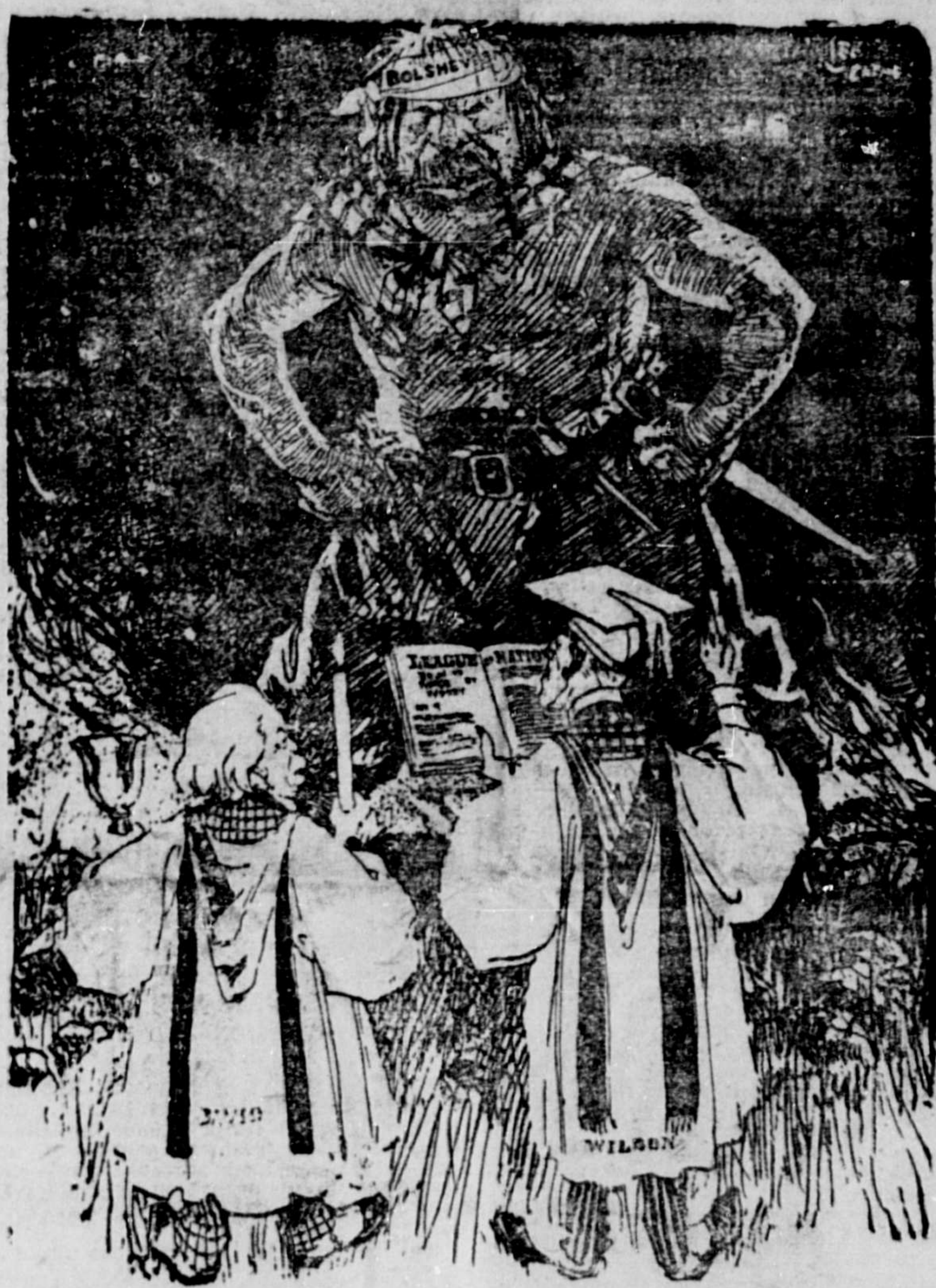
Is the Day of Miracles Past?

The only fish boat catches in port today are the Progress with 6,000 pounds; Telma, 8,000, and the Flivver, 1,000 pounds of halibut, which sold to the Canadian Fish and Cold Storage Co., Ltd., at 10.5c and 5c per lb. Eleven hundred pounds of salmon sold at 12.1c per lb. for the reds and 5c per lb. for the whites to the Canadian Fish and Cold Storage Co., Ltd.